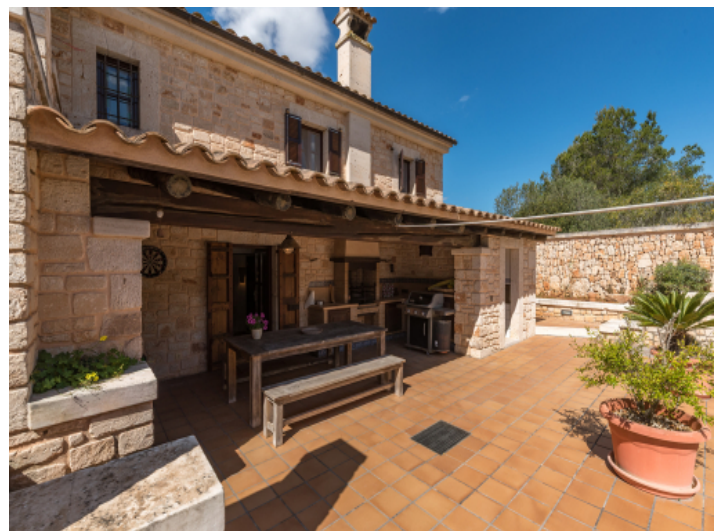
Covered terrace directly adjacent to the house with access to the ground floor