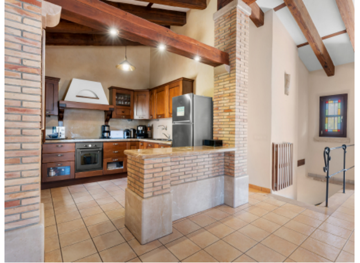
Kitchen adjoining the living area