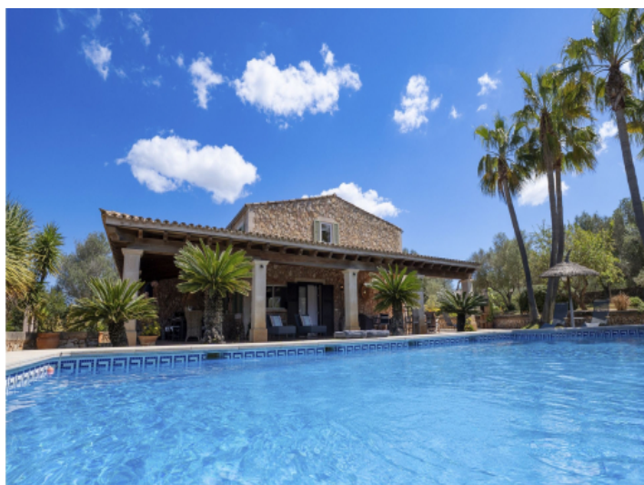
Countryhouse with pool