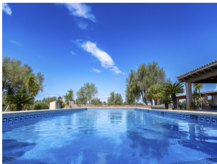
Nice large pool