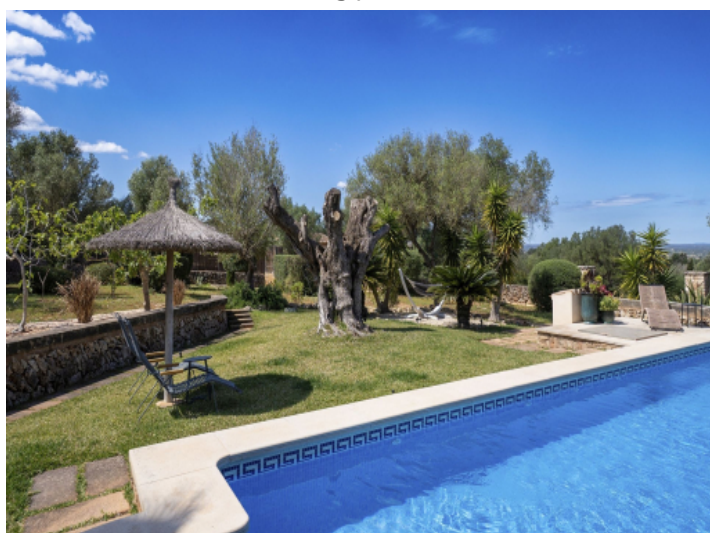
Nice maintained garden