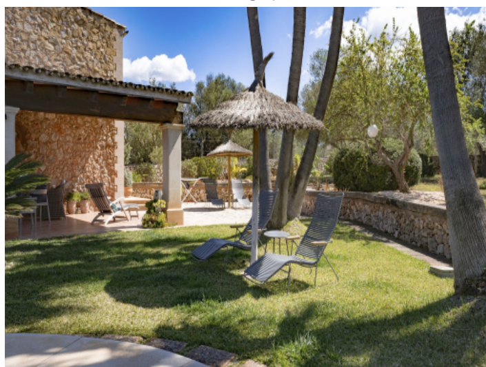
Sunplace near the pool