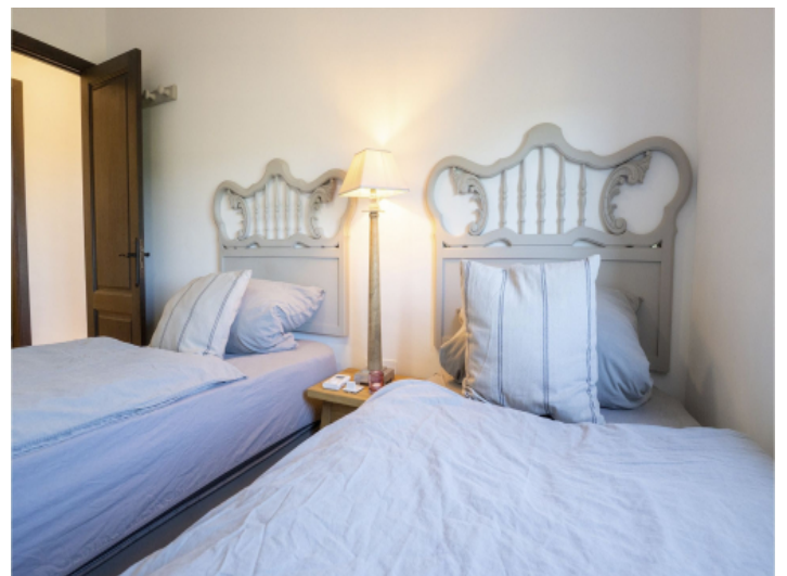
One of four bedrooms