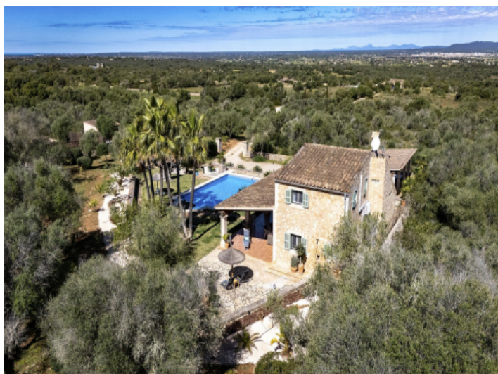
Nice Finca with views