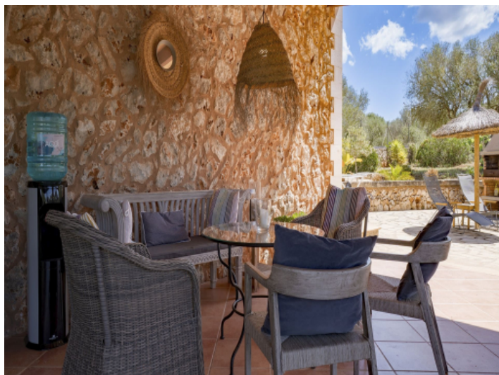
Large covered terrace