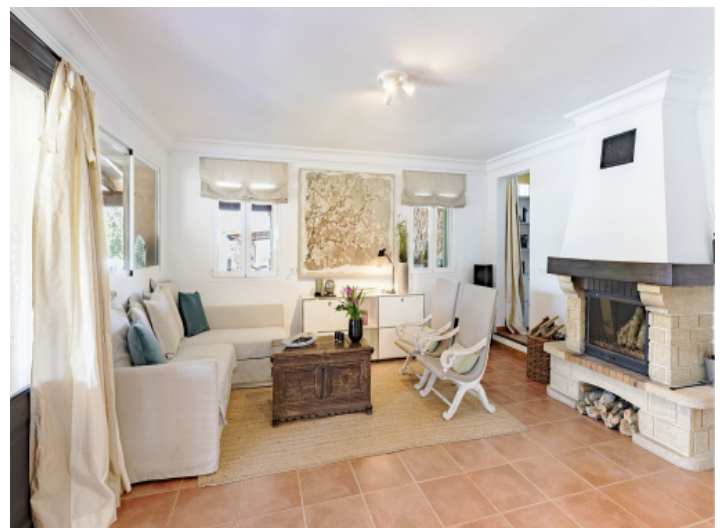
Open Living space