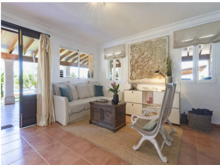
Living space with exit to the terrace