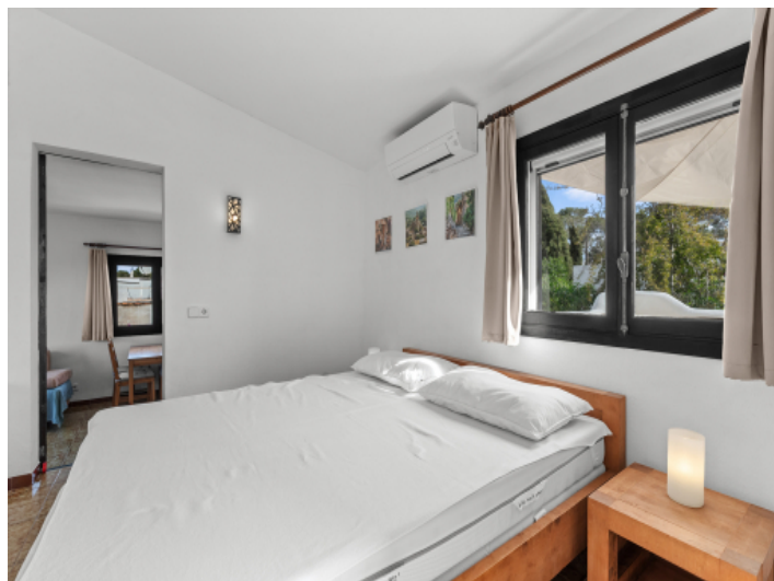
Bedroom on the upper floor