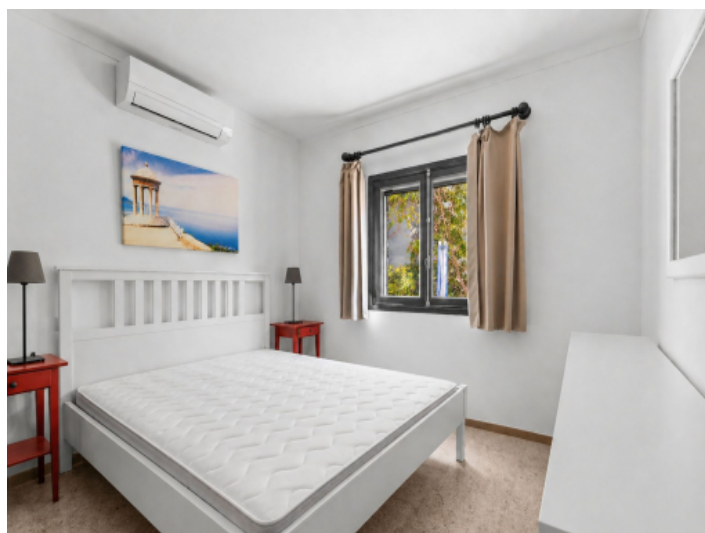
Second bedroom on the ground floor