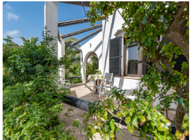
Terraces run all the way around the house