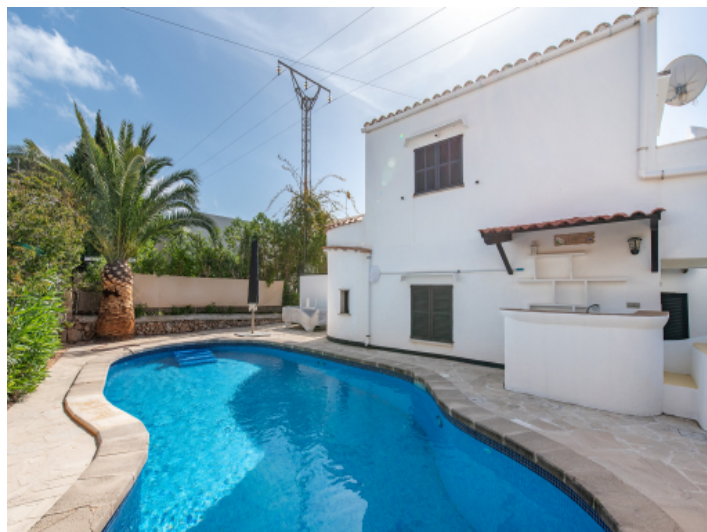
Pool area with outdoor bar