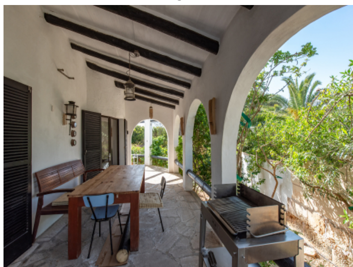
Terrace with entrance to the living area