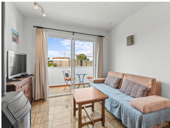
Living area with private balcony