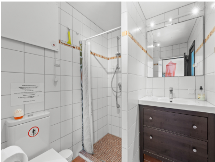
Bathroom in the tower