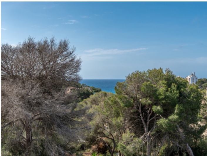
Rooftop terrace with sea view