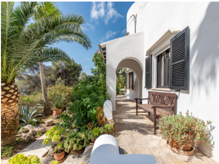
Garden and entrance area