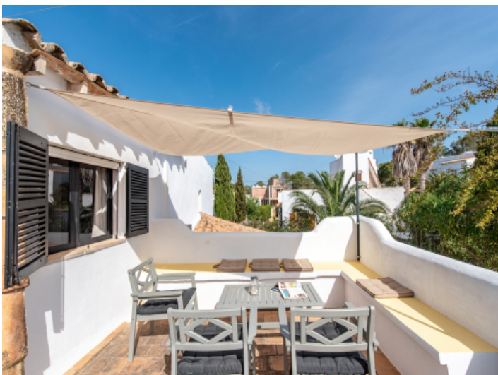
Terrace on the upper floor