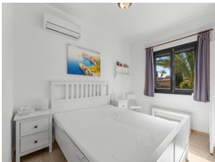
First bedroom on the ground floor