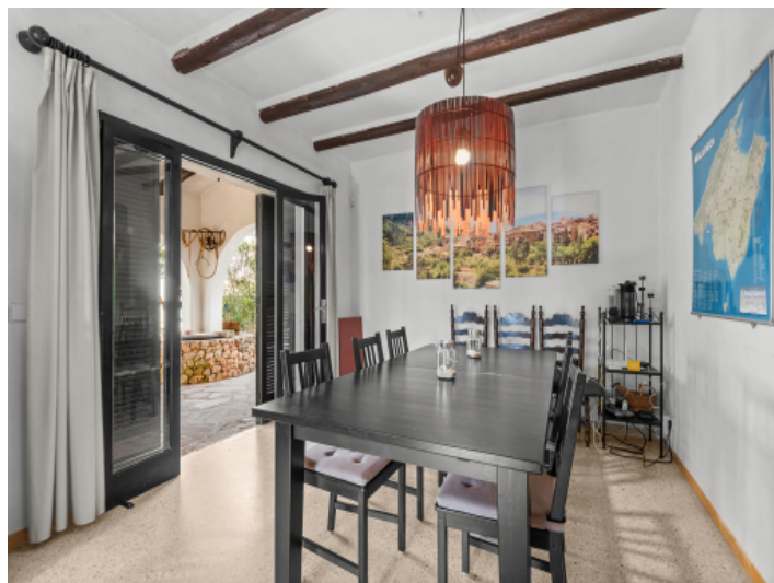
Dining area with access to the terrace