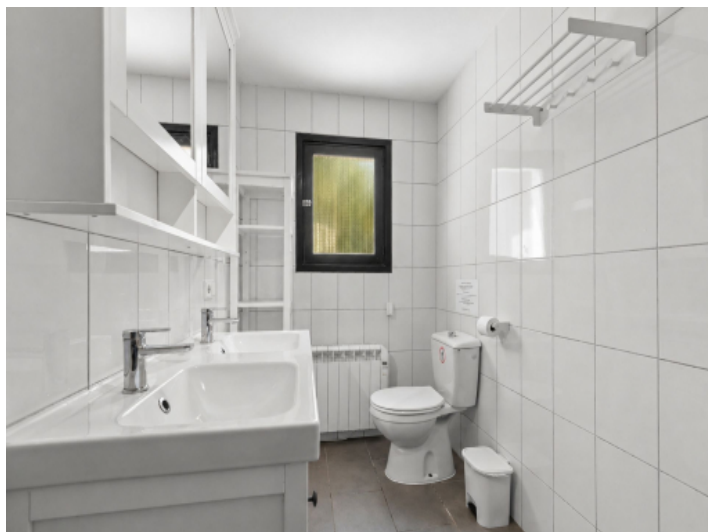
Bathroom on the ground floor