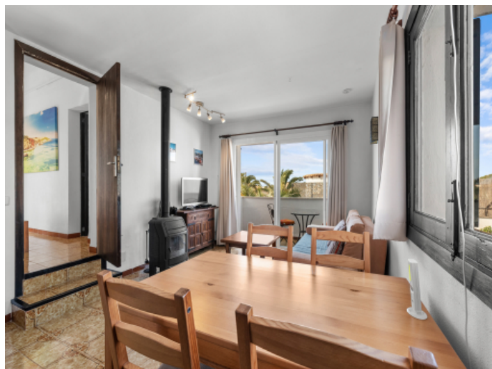
Living area on the upper floor