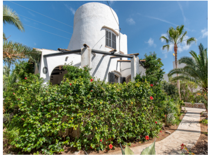
The garden and terraces extend all around the house