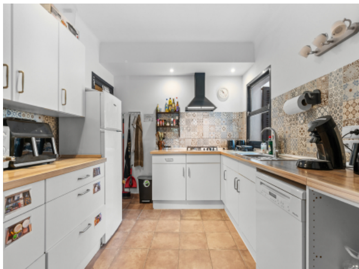
Kitchen in the main apartment