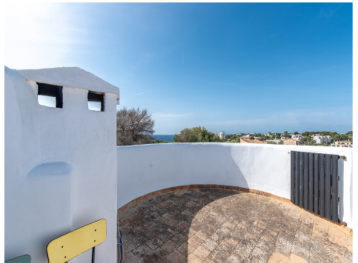
Rooftop terrace with sea view