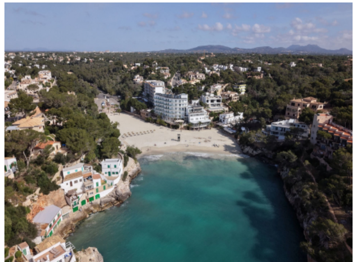
Cala Santanyi beach is just a few meters away