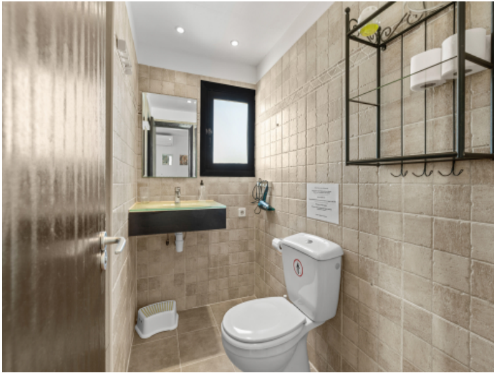
Bathroom on the upper floor