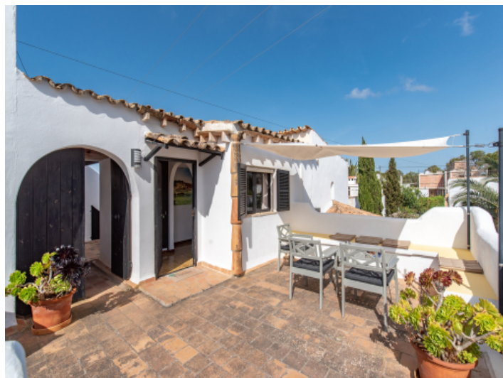
Terrace on the upper floor with entrances to separate living