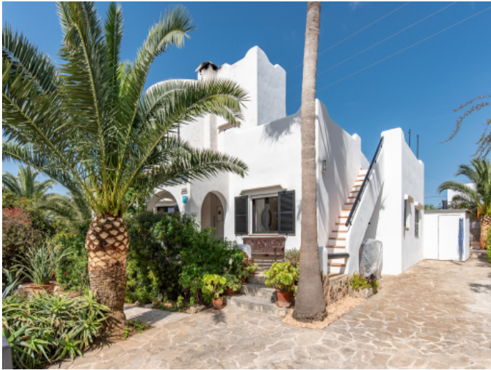
Entrance from the street