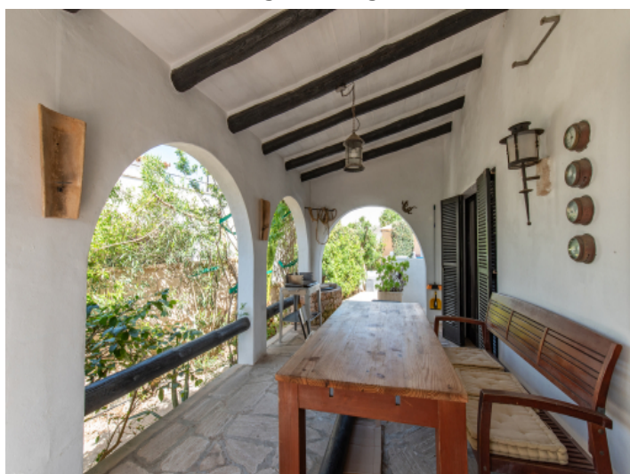
Terrace with entrance to the living area