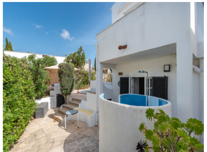
Outdoor shower behind a separate living unit