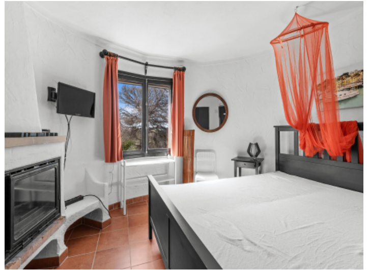
Bedroom in the tower