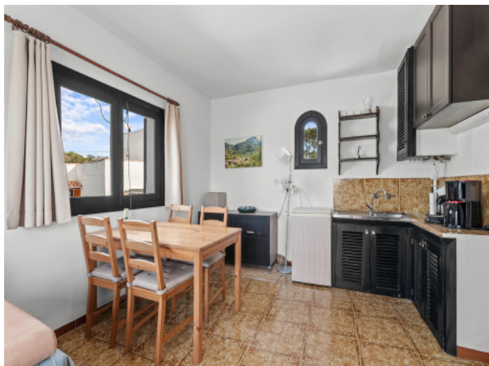
Living area on the upper floor