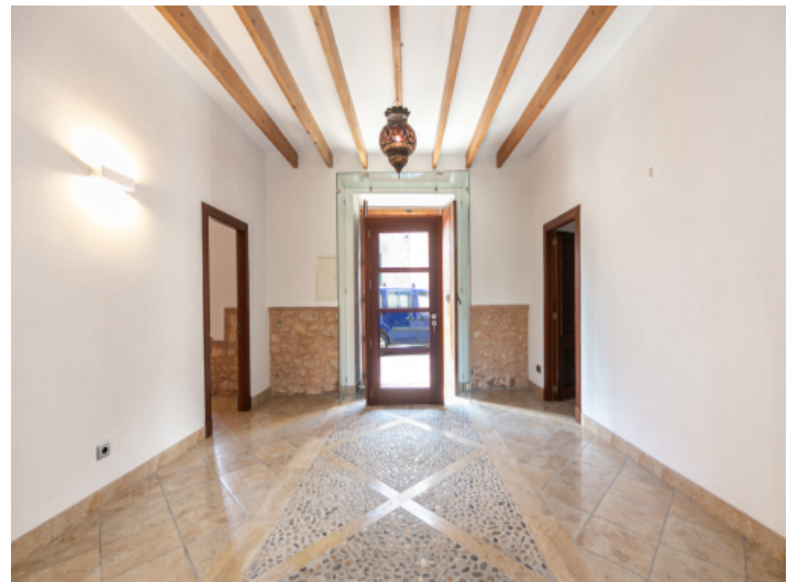
Traditional entrance to the house