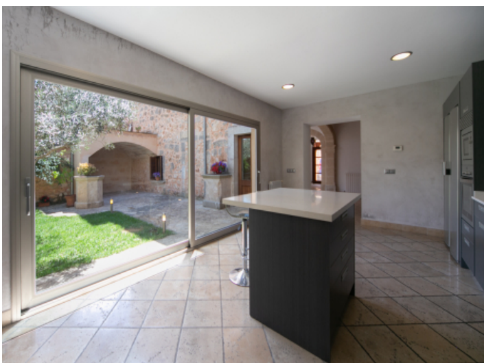
Townhouse with patio in Algaida