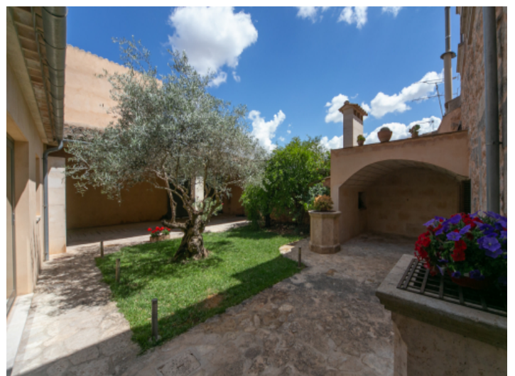
Charming patio with garden