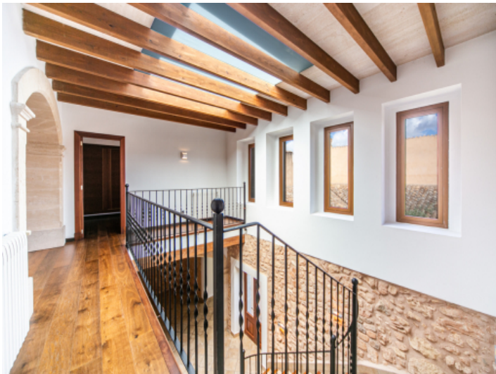
Completely modernized townhouse with patio in Algaida