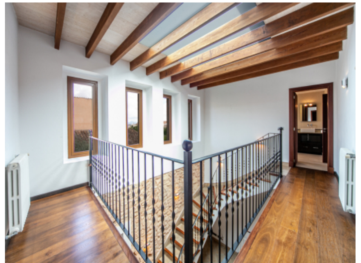
Upper floor with wooden ceiling beams