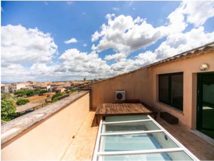
Roof terrace with views over the town