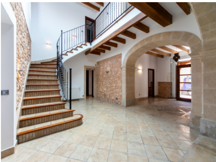
Traditional entrance hall with stone arch