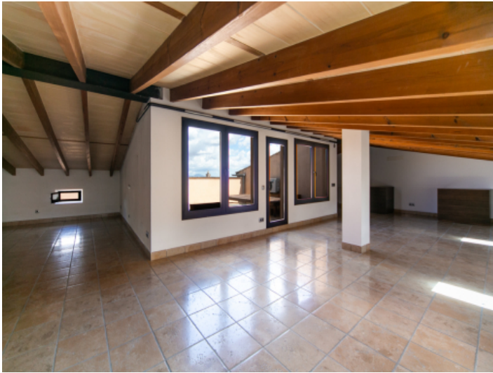
Large room with terrace access