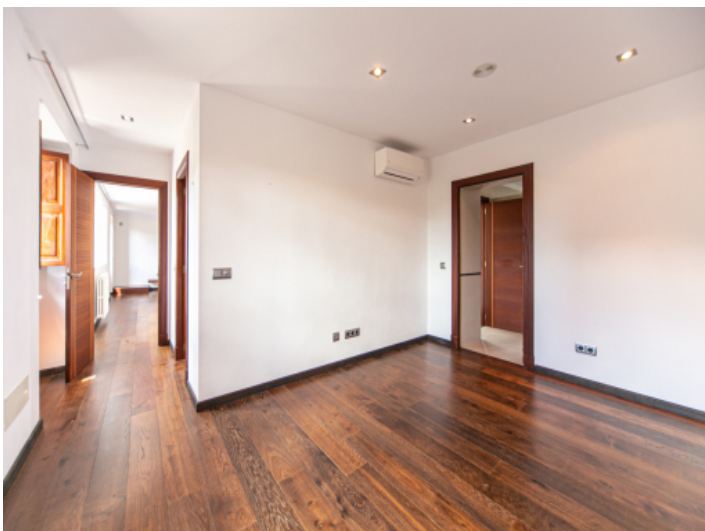
Bedroom on the upper floor