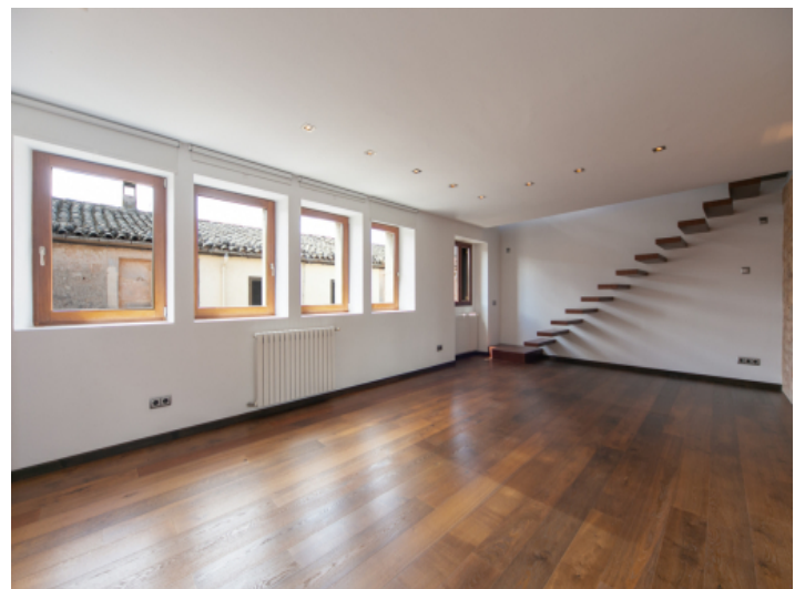
Further living room on the upper floor