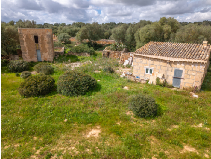
Authentic historic water mill on the property