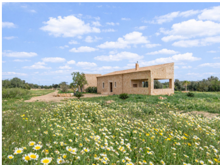
Authentic Mallorcan finca