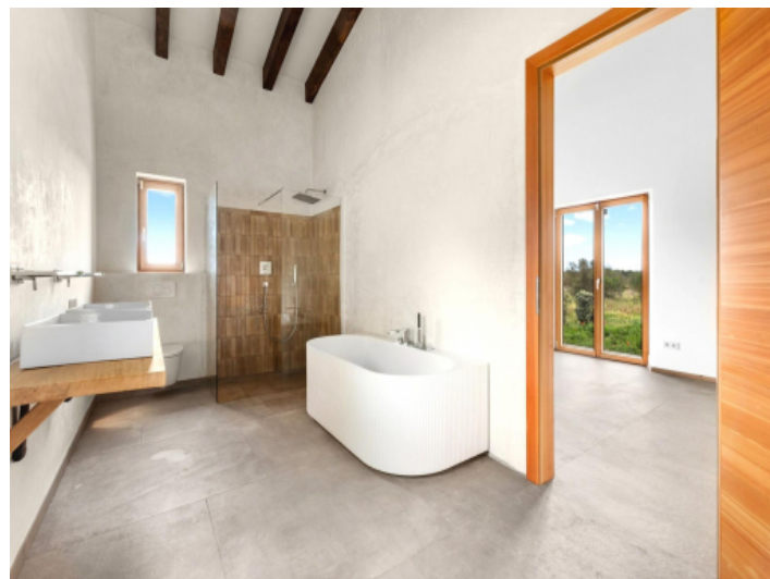
Master bathroom with bathtub and shower