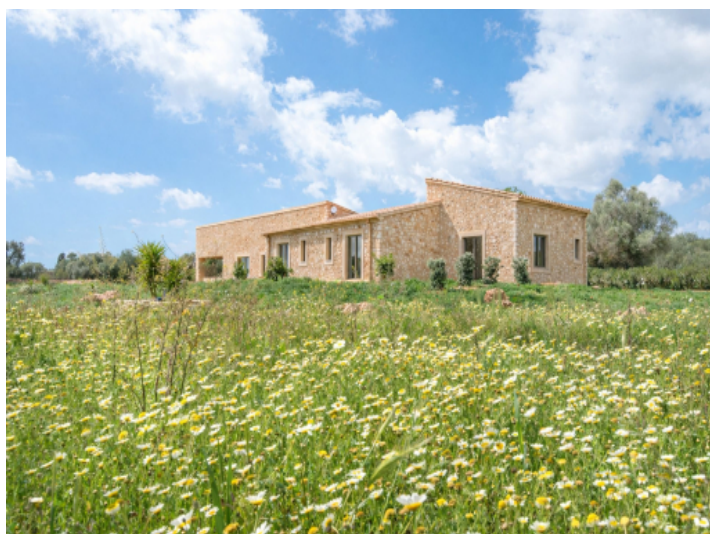
House with plenty of privacy