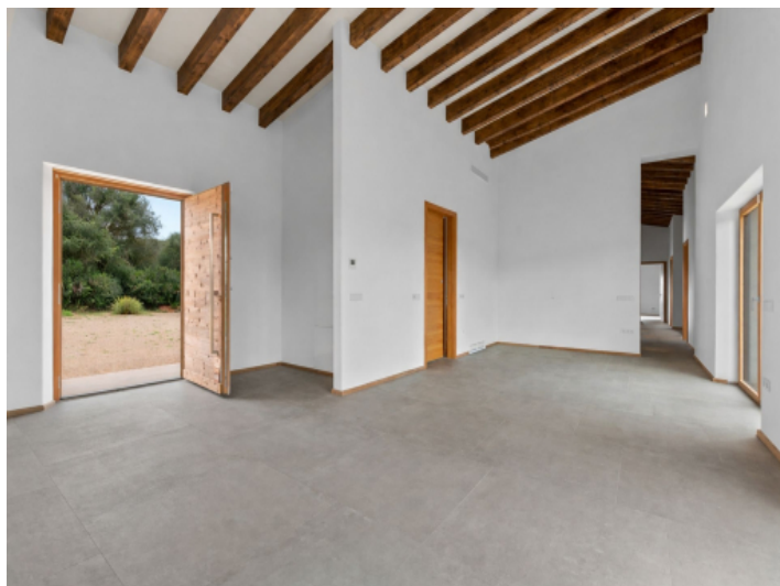
Kitchen and entrance area