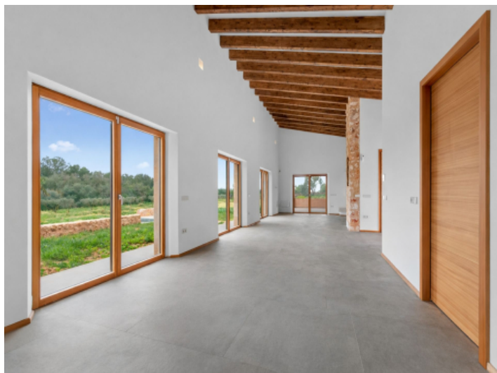
Kitchen with open concept