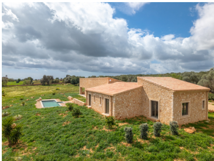
Natural stone façade