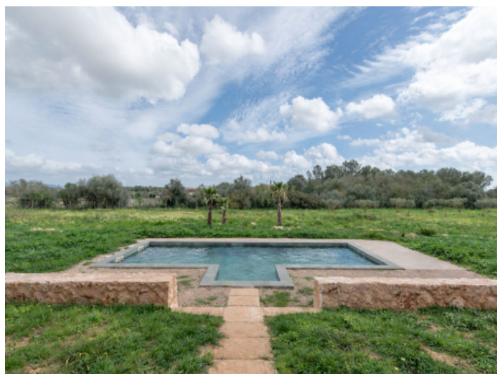
Pool with views