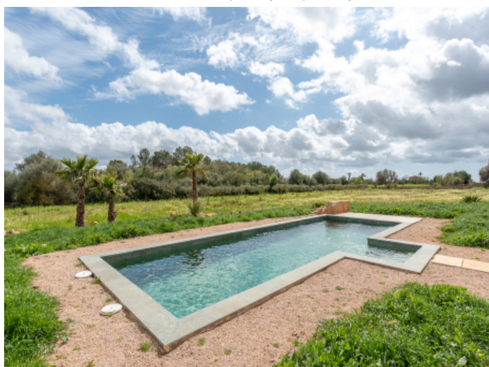
Pool and garden