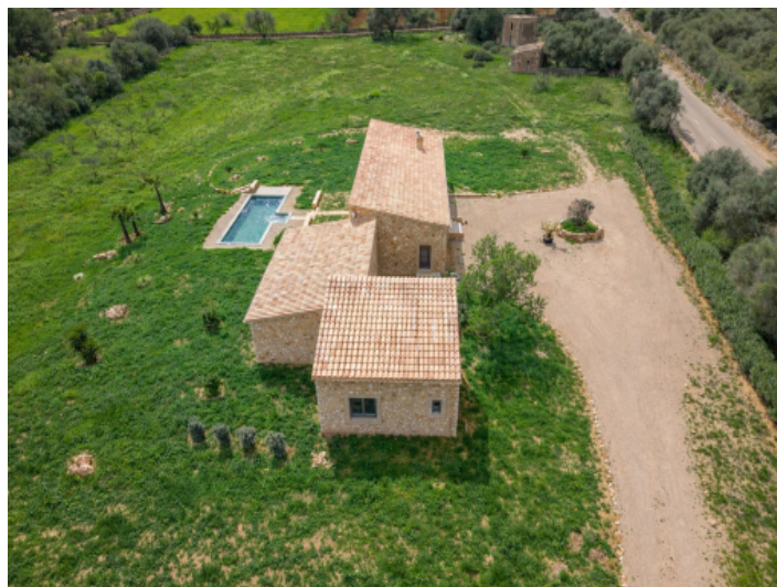
Generous landscaped garden