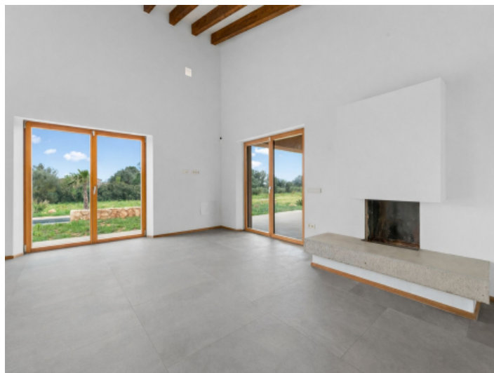
Living room with fireplace