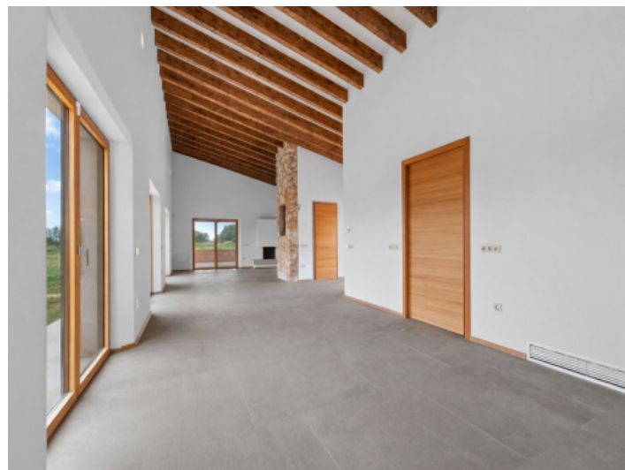
Kitchen with pre-installation for a kitchen island