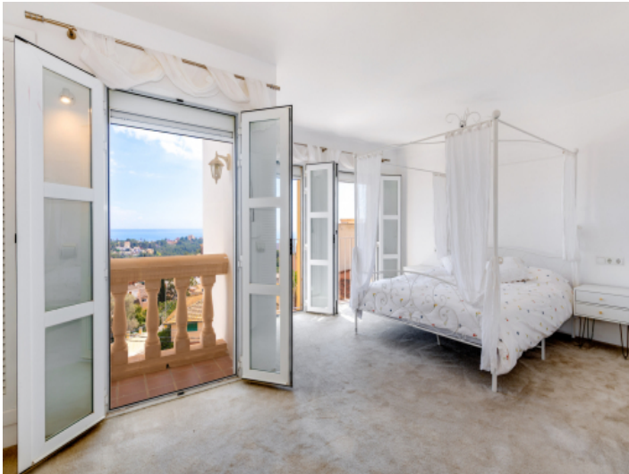
Bedroom with sea views