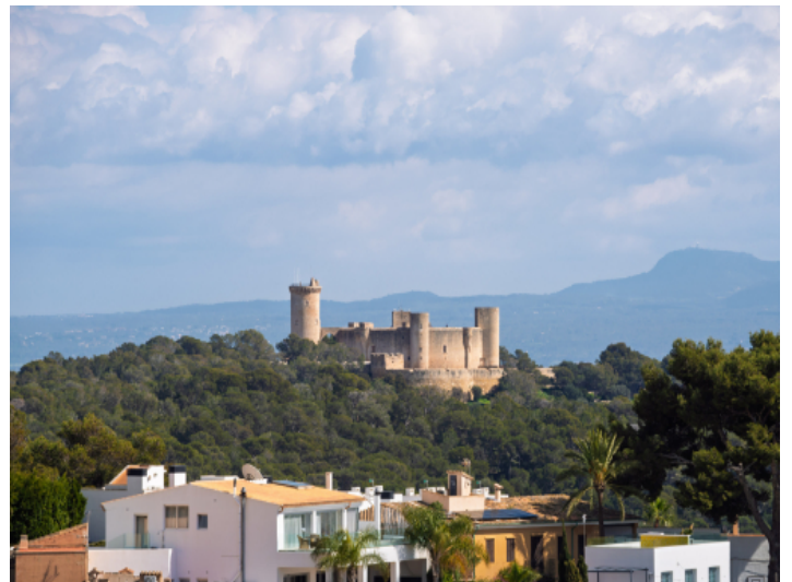
Views to Bellver castle