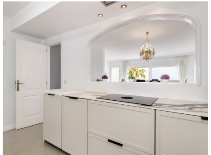
Open plan kitchen