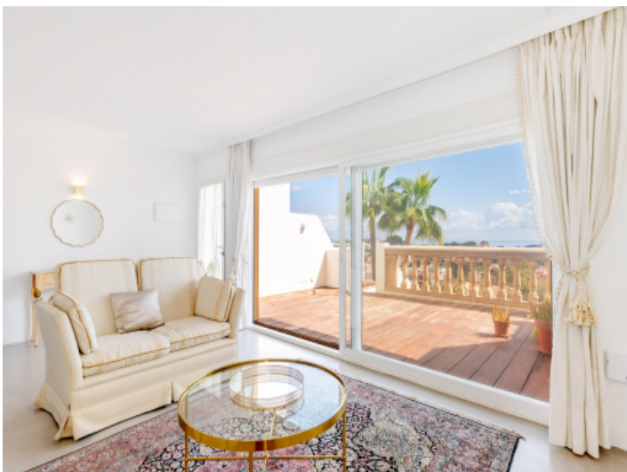
Sunny living room