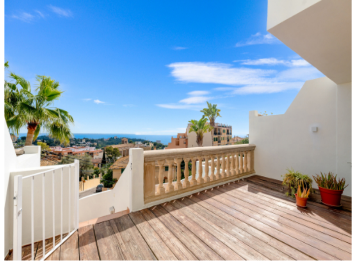
First floor terrace