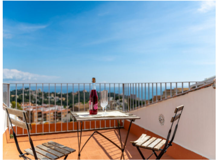
Roof terrace with views