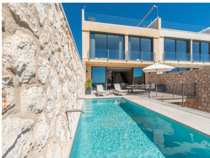
Newly built semi-detached townhouse in Ses Salines