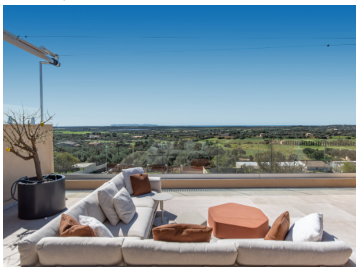
Roof terrace views