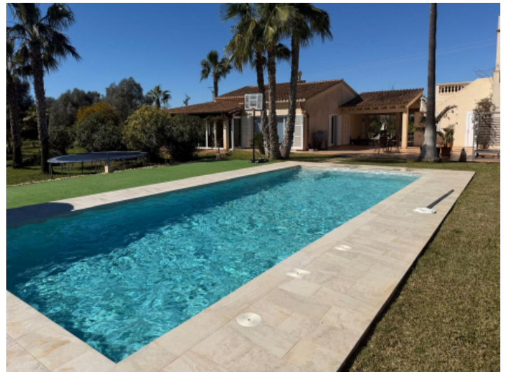
Pool 60 sqm