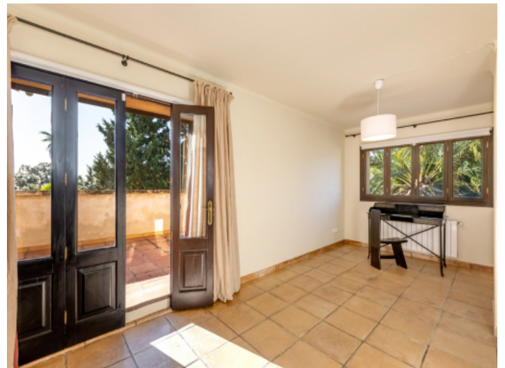
Bright room on the first floor