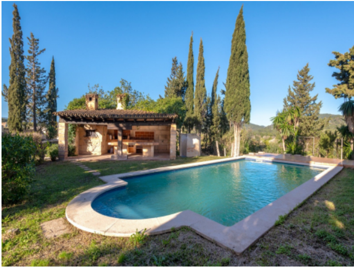
Garden, pool, views and barbecue