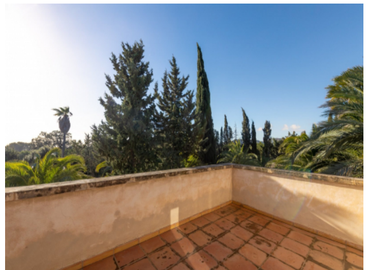
Private sun terrace