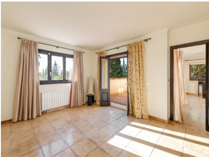
Master-bedroom with 30 sqm terrace