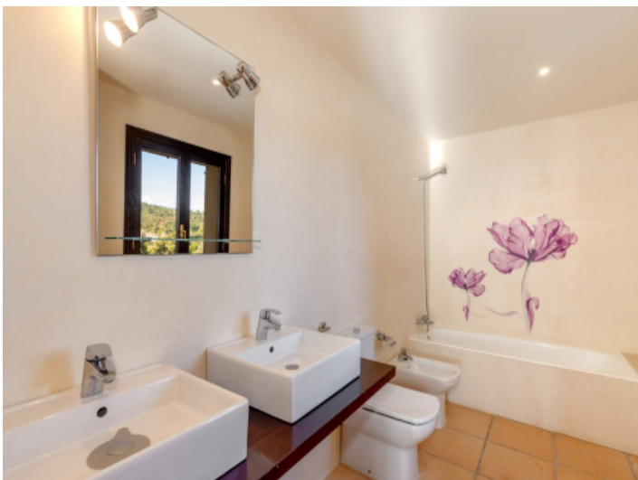
Bathroom en Suite with bathtub