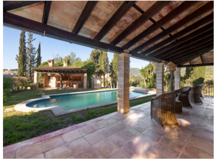
Covered porche with views over the pool and the landscape