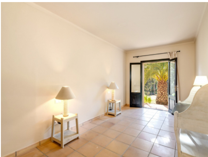
One of the three bedrooms on the groundfloor with access to the garden