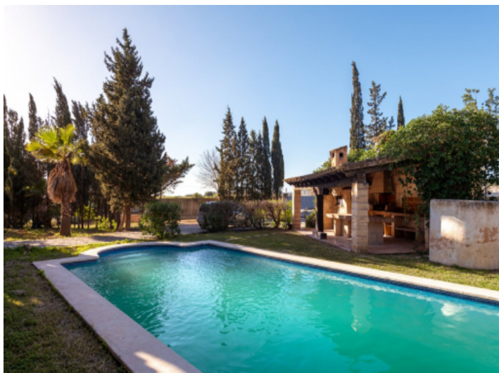
Pool and barbecue area