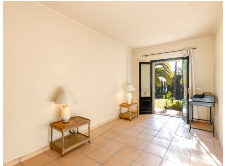
One of the three bedrooms on the groundfloor with access to