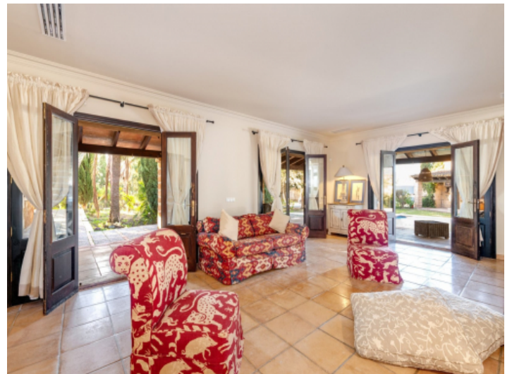
Bright and spacious living room