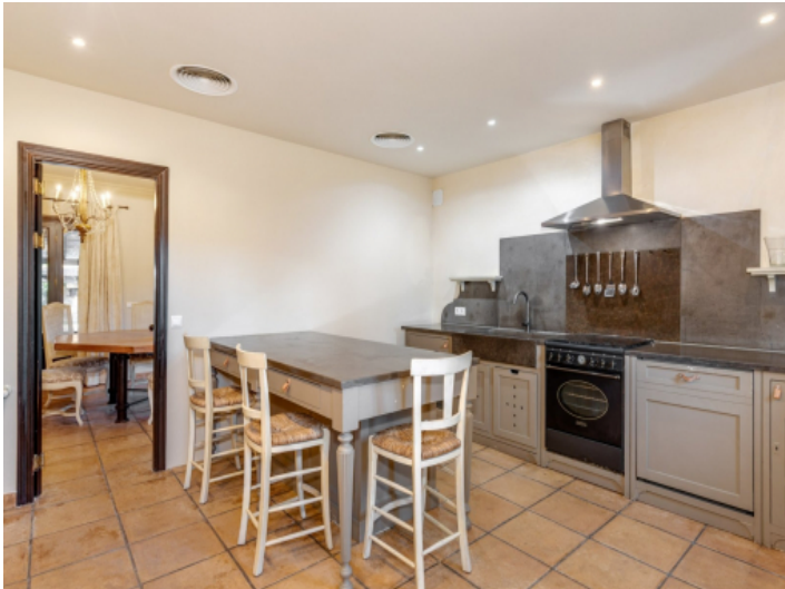
Modern kitchen with breakfast table