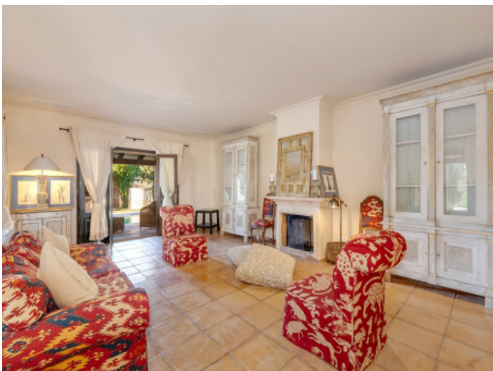
Living room with chimney