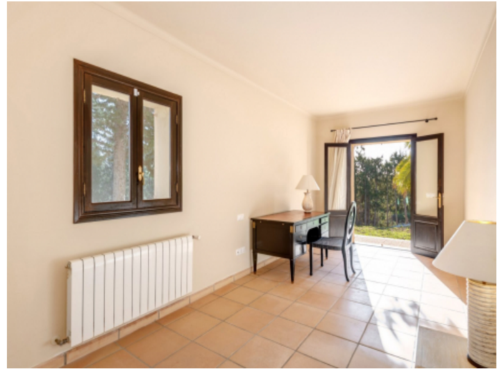
Upstairs - room with many possibilities