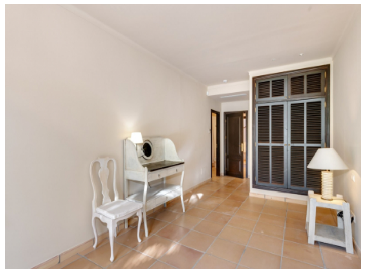
One of the three bedrooms on the groundfloor and built-in cupboard

PORTA MALLORQUINA • C./ COLOM 20 2º, 07001 PALMA, SPAIN