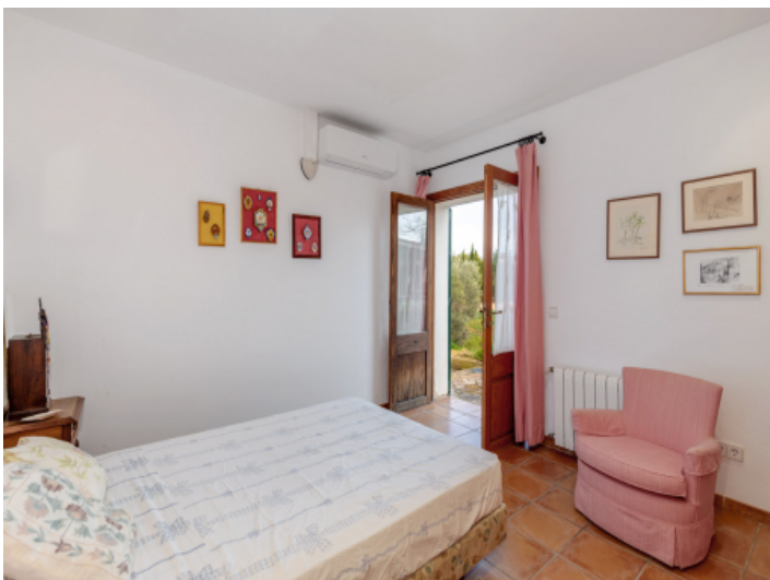
One of the four bedrooms with access to the garden