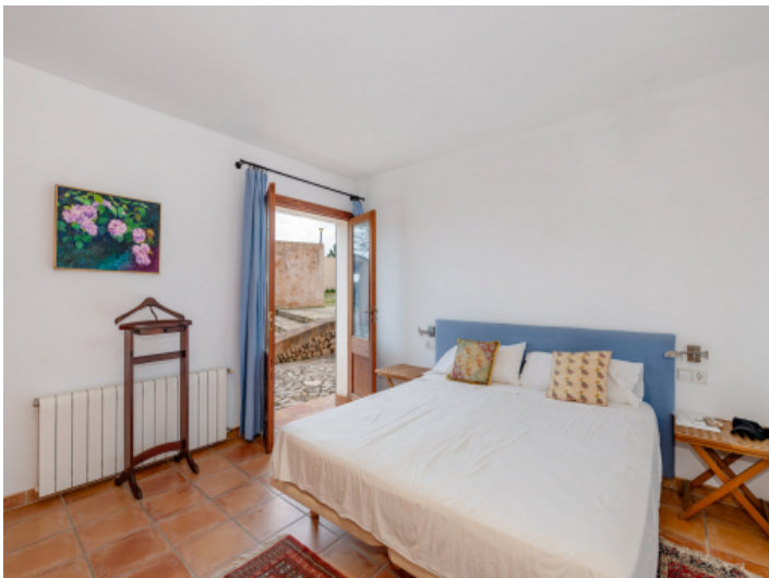
One of the four bedrooms with access to the garden