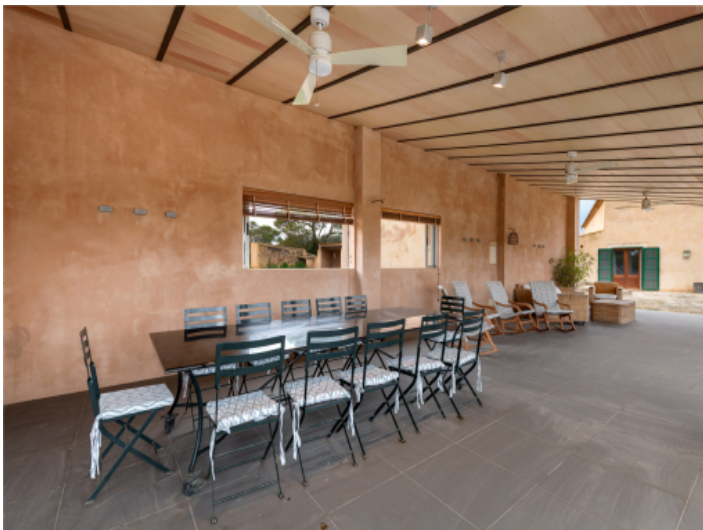
Veranda – perfect for cozy moments outdoors