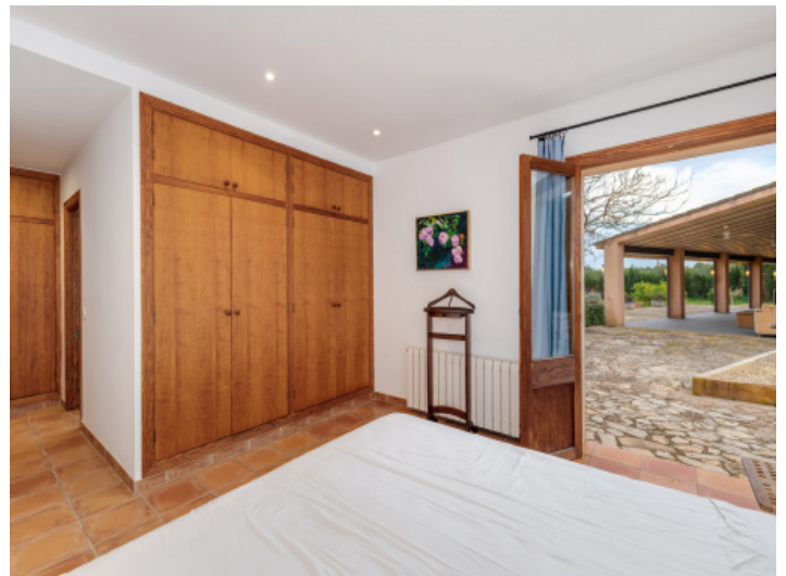
One of the four bedrooms with access to the garden