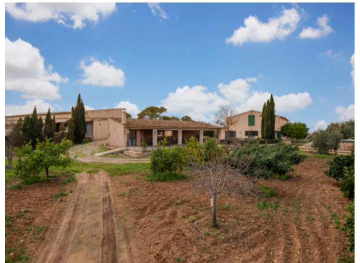
Well-kept garden with Mediterranean fruit trees