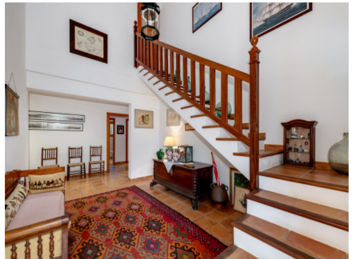
Light-flooded entrance area