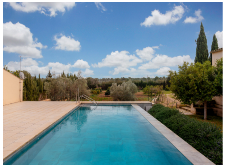
Pool with dream views