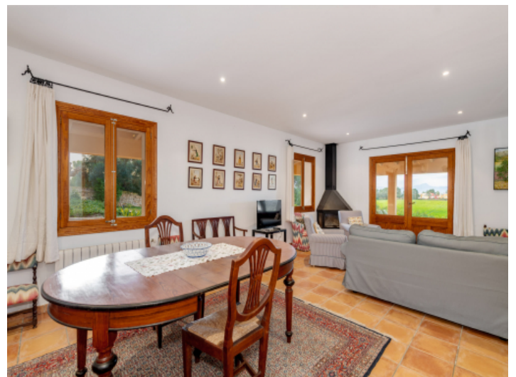
Cozy living-dining area