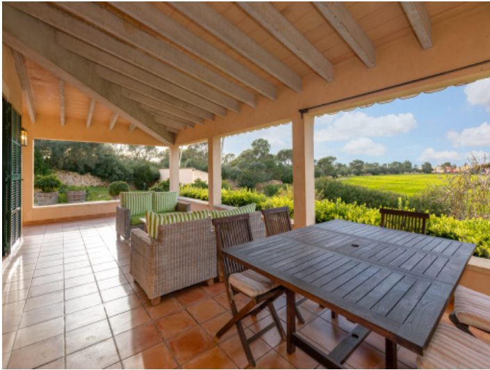
Covered terrace with a view