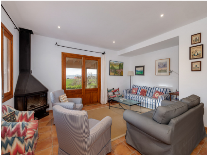
Living area with views outside