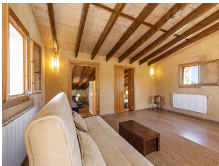
Living room on the upper floor