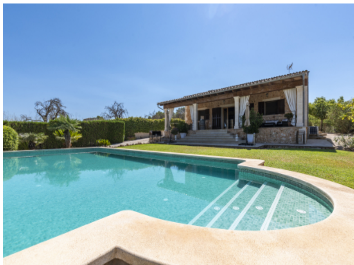
Holiday finca with pool in Sineu