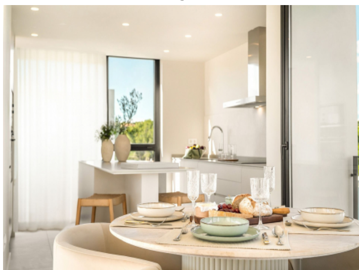
Open modern kitchen