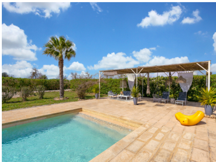
Pool with stair entrance