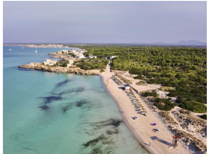
Coast less than 10 minutes away