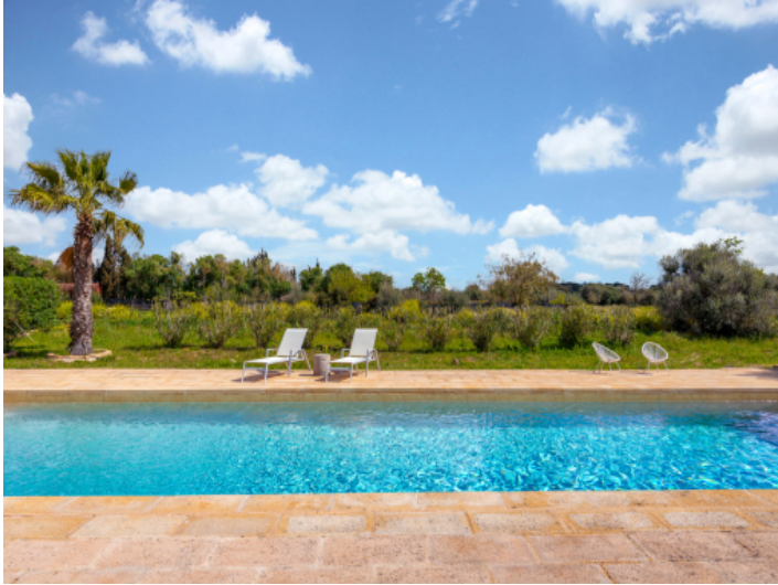
Pool 5x18 meters