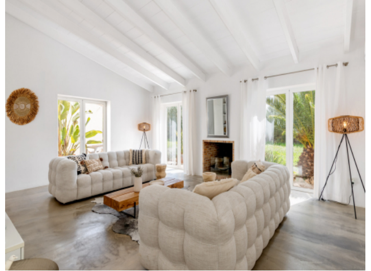
Living room with chimney