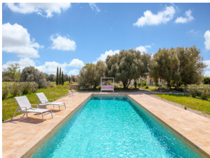
Pool 5x18 meters