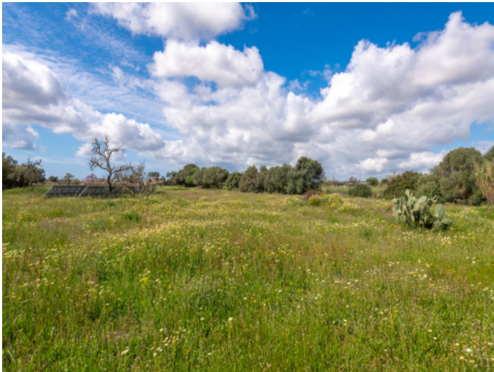
Garden view to the west