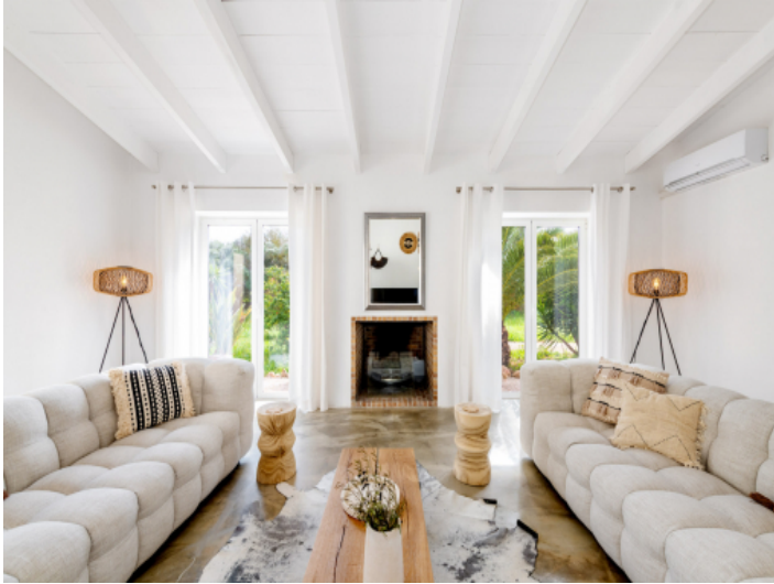
Living room with chimney