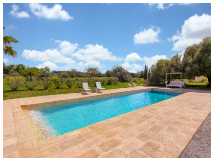
Pool with stair entrance