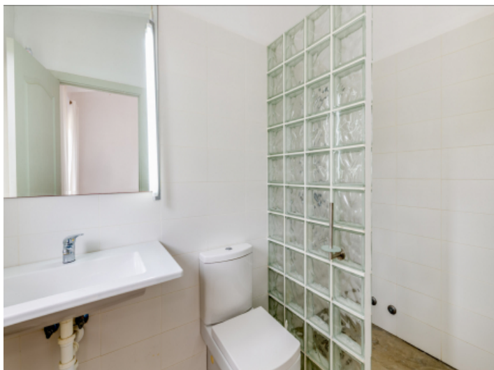
Bad en Suite Guest bedroom