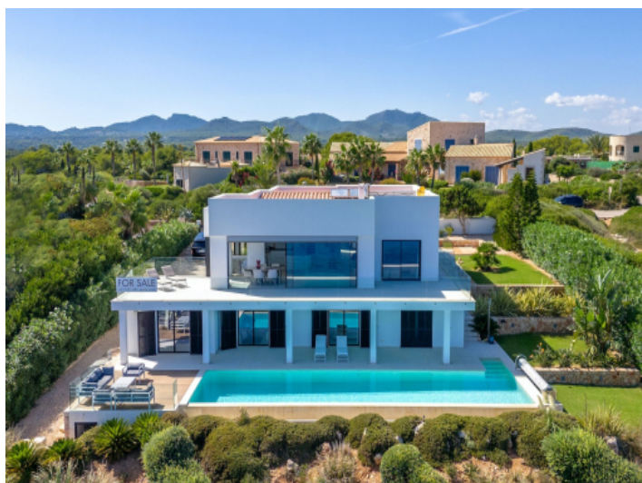
Villa on the first sea line