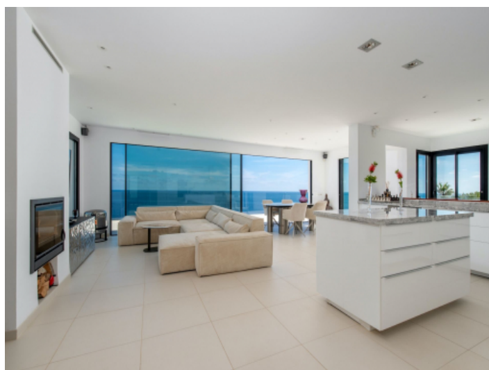
Open-plan living and dining area