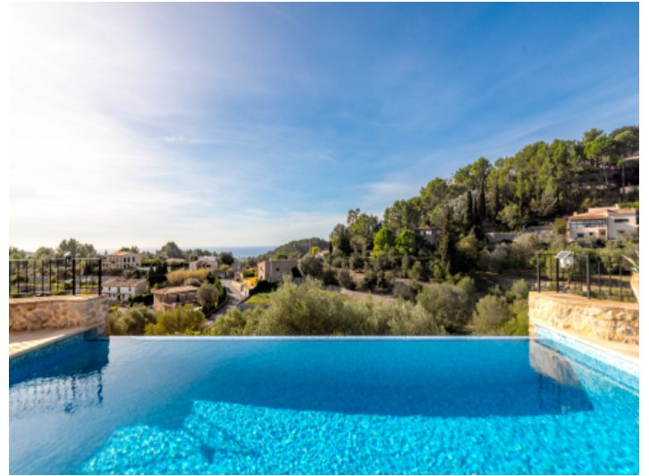
Charming infinity pool