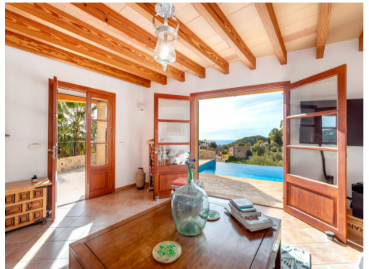
Bright living with beautiful views