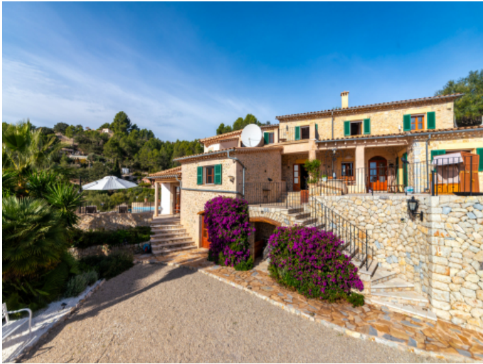
Charming village house with pool and amazing views in