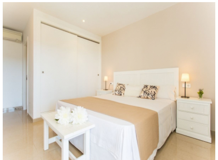
One of three bedrooms with bathroom en suite