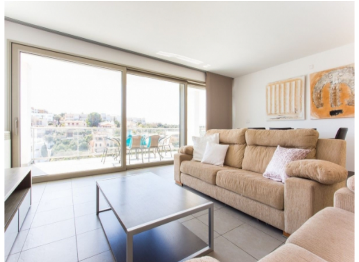
Bright living area with access to the terrace