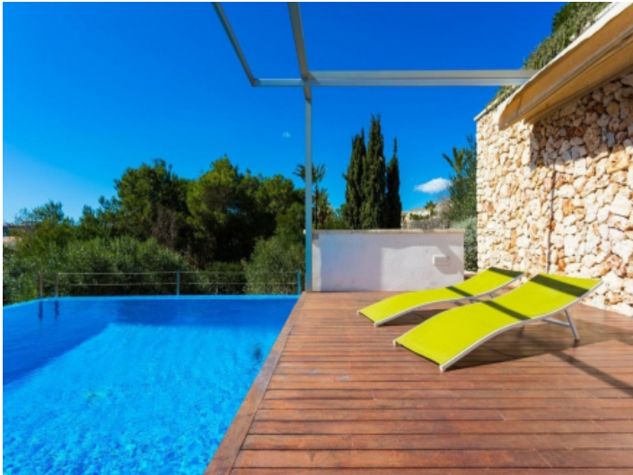
Wonderful pool area