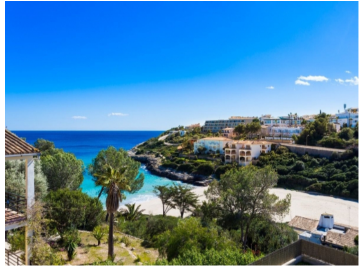
Exclusive situation near the sea