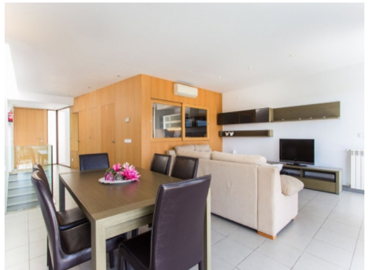
Open living and dining area and separated kitchen