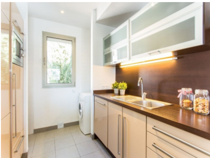
Kitchen and laundry