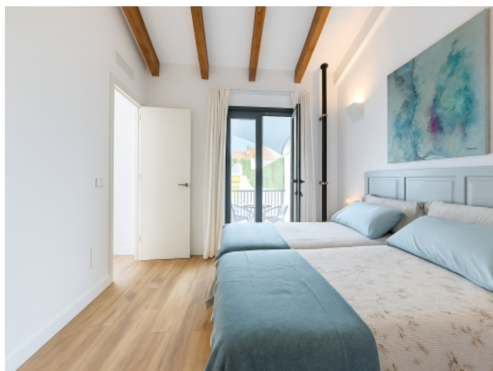
Master bedroom with view of the upper terrace