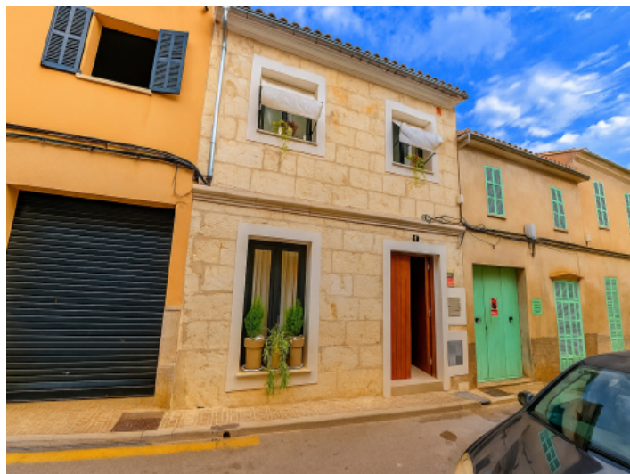
Street view of the renovated sandstone façade in Santa