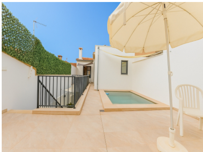
Upper floor with pool and sunny terrace