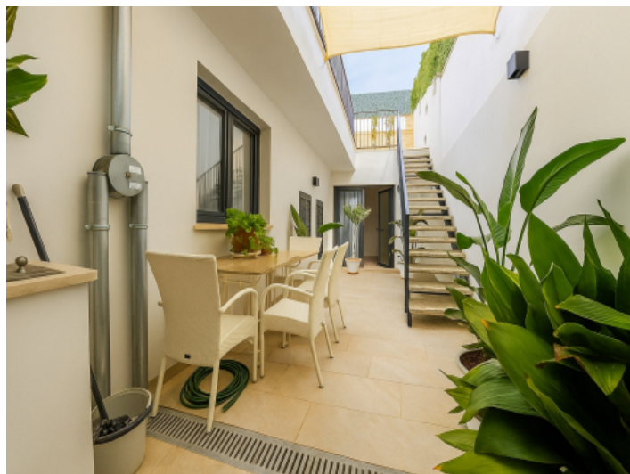
Ground-floor patio with dining area and stairs leading to the