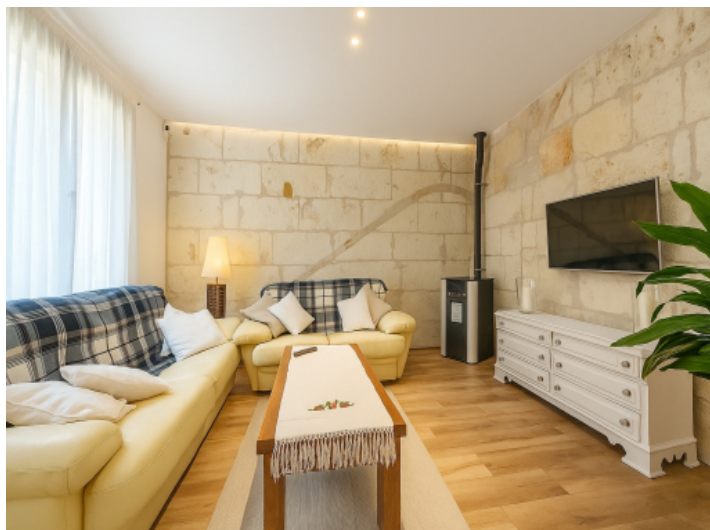
Living area with natural stone wall and pellet stove