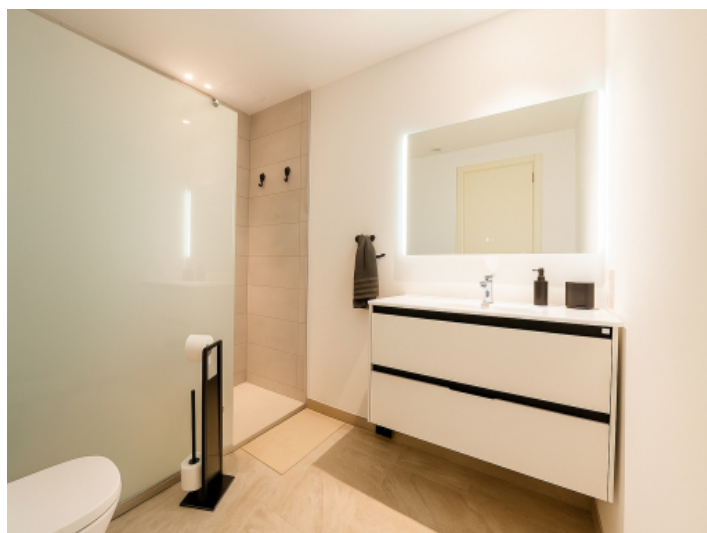
Second en-suite shower room with frosted glass and modern fittings