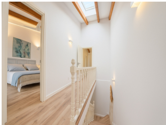
Upstairs hallway with skylight and exposed beams