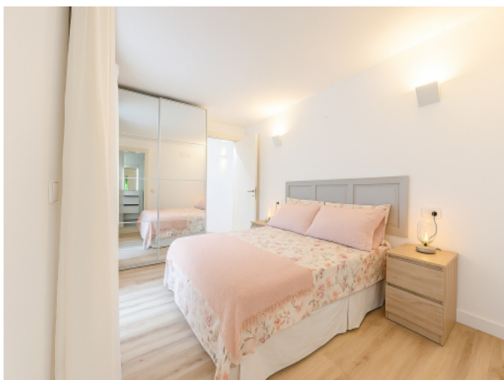
Third double bedroom with built-in wardrobe and bright accents