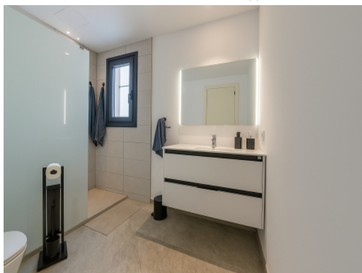
En-suite bathroom with walk-in shower and illuminated