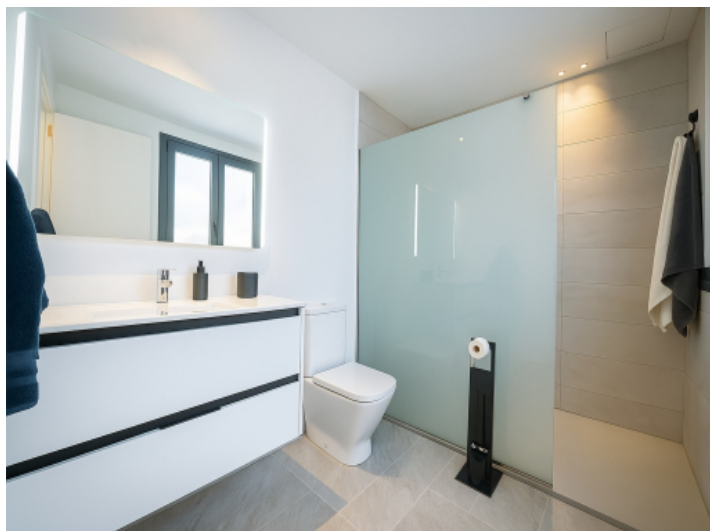
Modern en-suite shower room with frosted glass partition