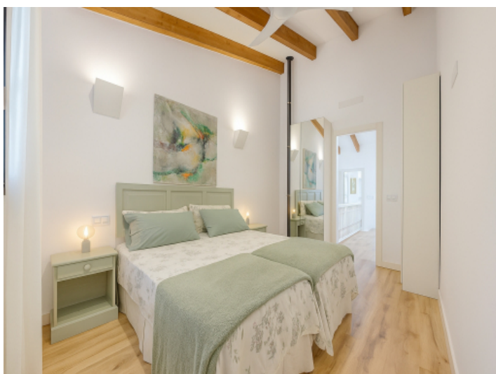
Second double bedroom with built-in wardrobe on the upper