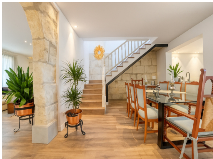
Dining area with staircase to the upper floor and open layout