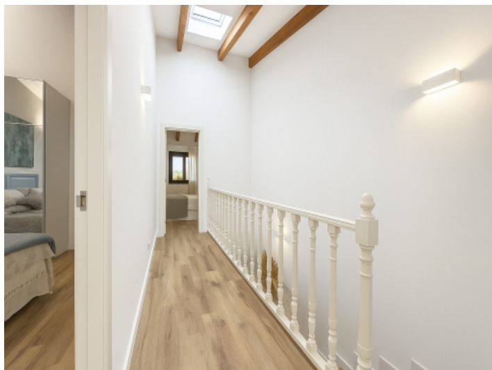
Staircase with skylight and bright gallery hallway to the