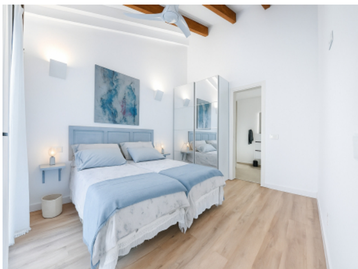
Master bedroom with double bed and terrace access