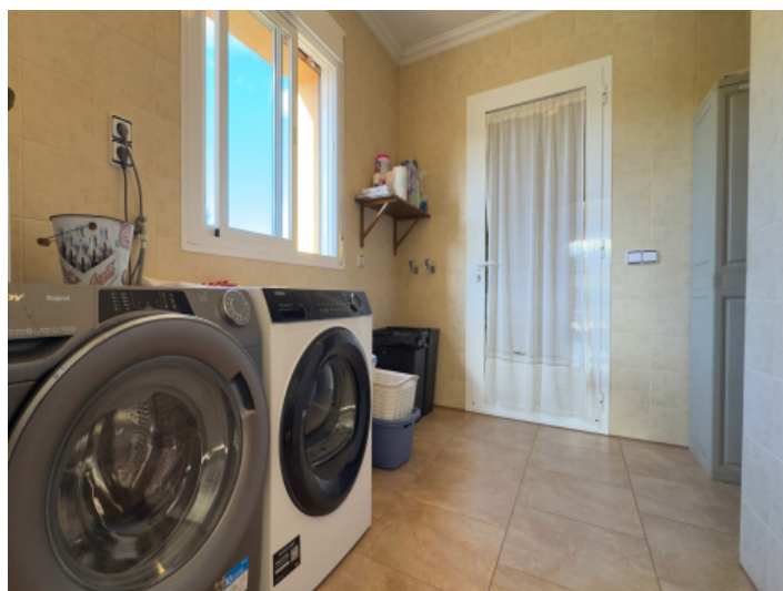
Home economy room