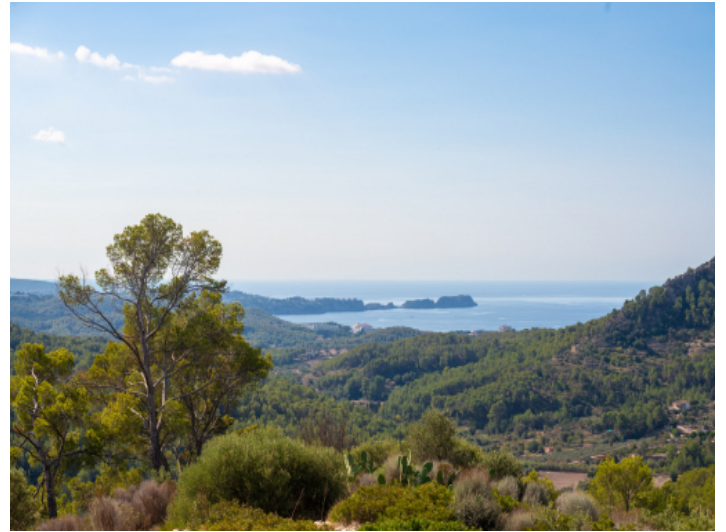
Panoramic sea view