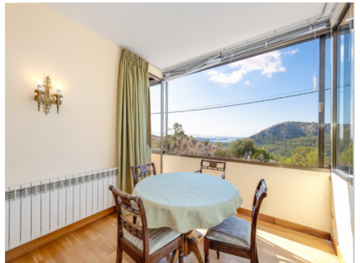
Dining area with stunning view