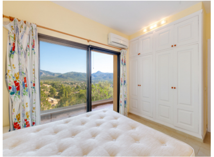
Another bedroom with great view