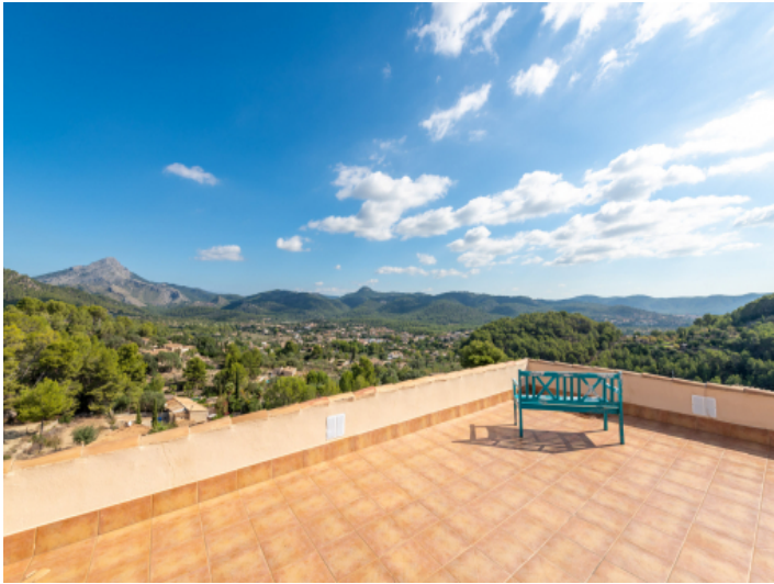
House, Es Capdellà