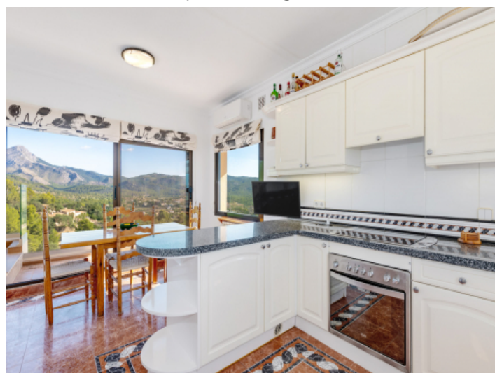
Open kitchen with adjoining dining area