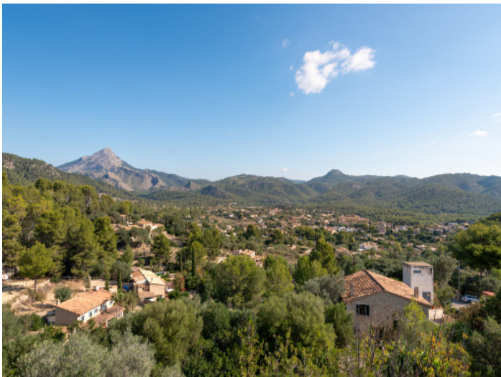
Dreamlike view of the landscape