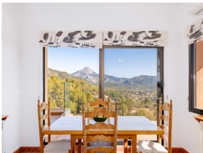
Dining area with fantastic view