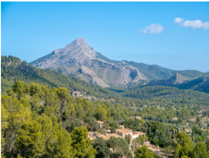
Beautiful view of the mountains