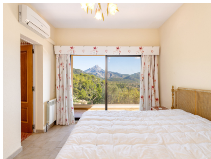
Bedroom with terrace and panoramic view