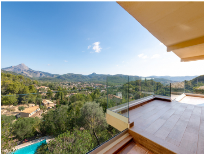
Covered terrace with panoramic view