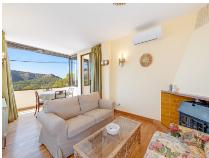
Bright living room