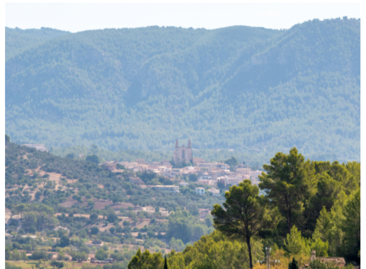
View of the village Es Capdellà