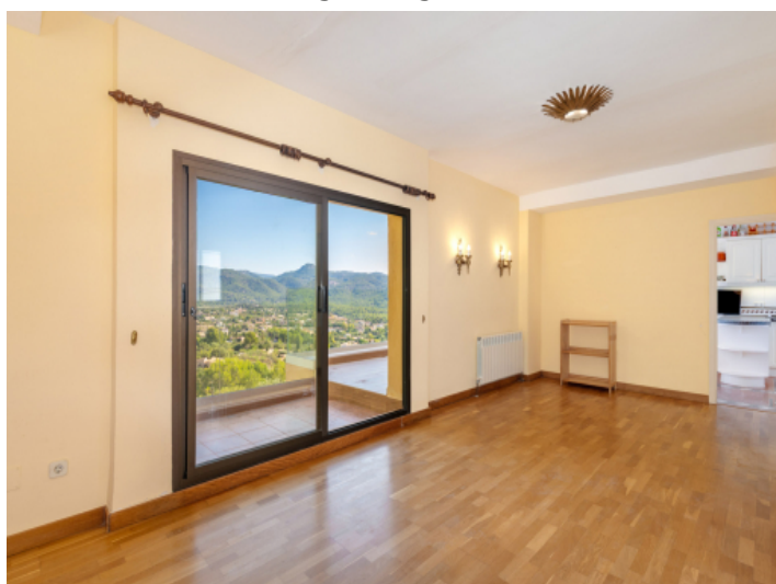
Access to another terrace