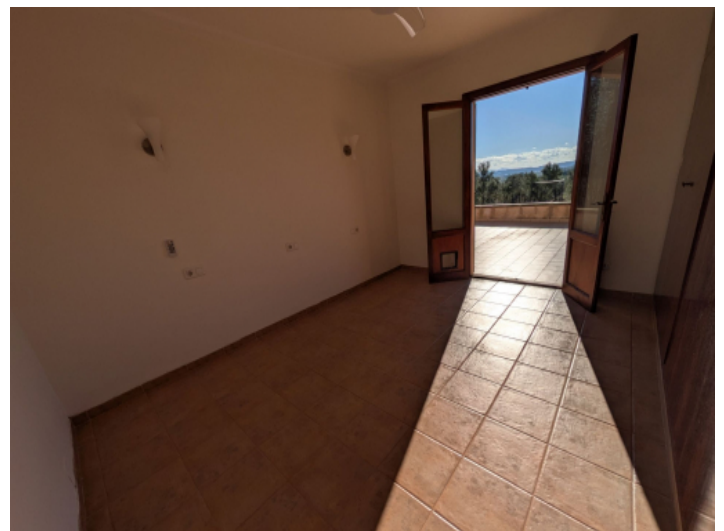
Bright bedroom with access to the terrace and views of the countryside

PORTA MALLORQUINA • C./ COLOM 20 2º, 07001 PALMA, SPAIN