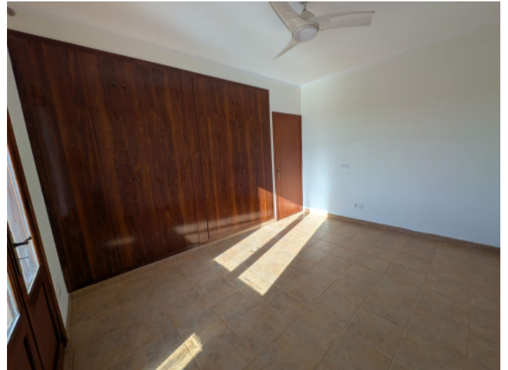
One of the three bedrooms