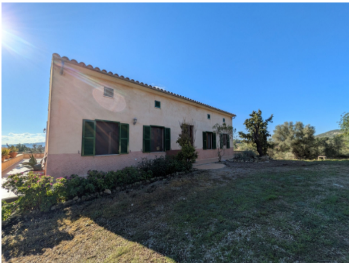
Exterior view of the finca with a well-kept garden area and