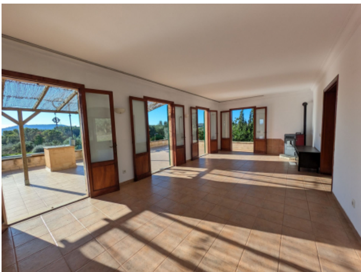
Spacious, light-flooded living area with many windows and doors opening to the terrace