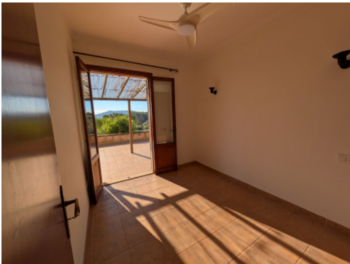
Bright bedroom with access to the terrace and views of the