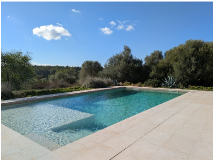
Pool with a shallow entry area – ideal for relaxing by the