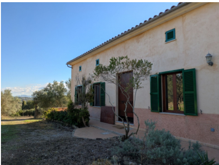
Exterior view of the finca with a well-kept garden area and traditional Mallorcan elements