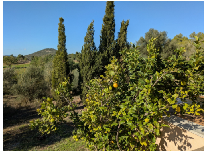
Old tree population – fruit trees