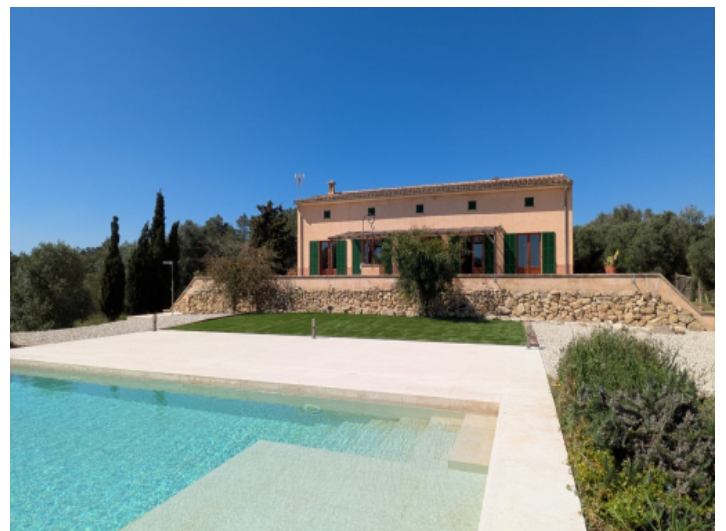
View from the garden

PORTA MALLORQUINA • C./ COLOM 20 2º, 07001 PALMA, SPAIN