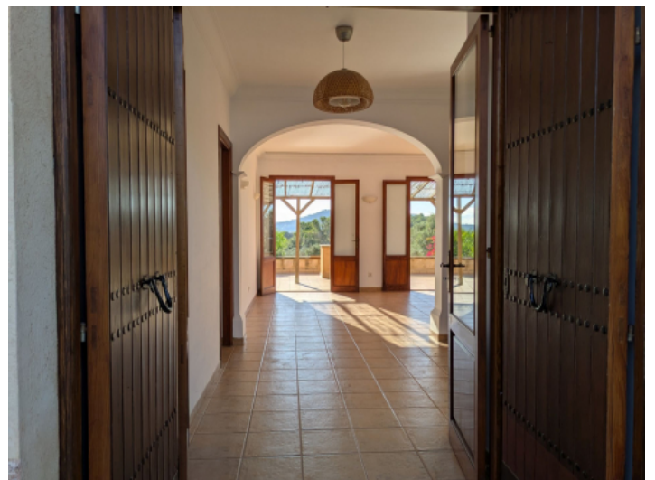
Unfurnished finca for rent

PORTA MALLORQUINA • C./ COLOM 20 2º, 07001 PALMA, SPAIN