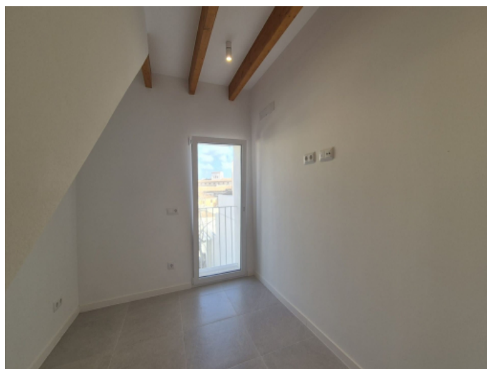
Bedroom 2 first floor