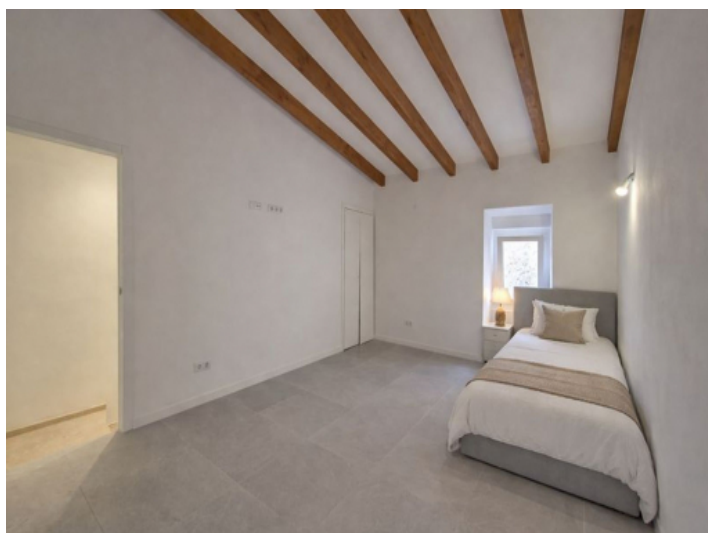
Bedroom 1 first floor