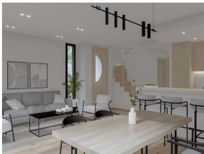
Ground floor area