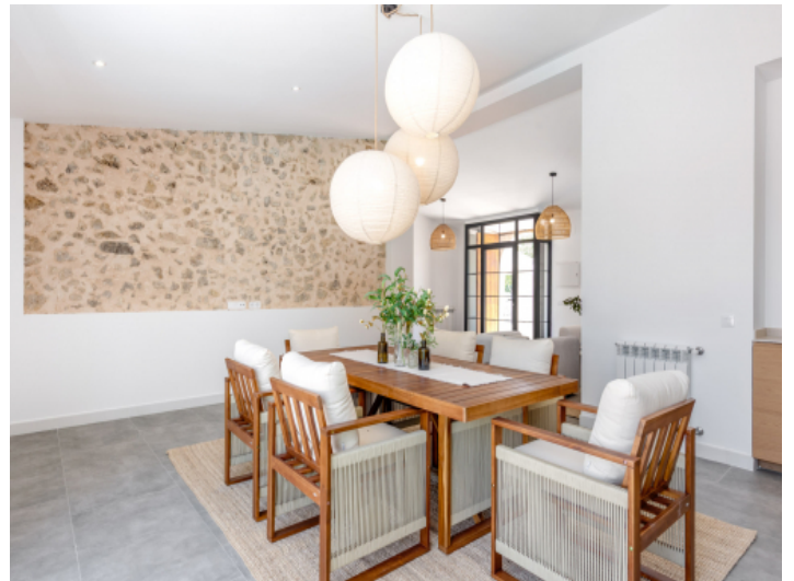
Modern and cosy dining area