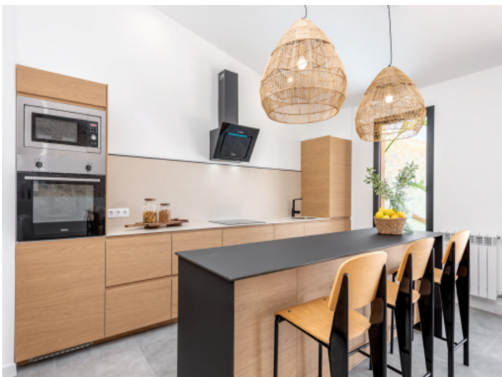
Fully equipped, modern kitchen