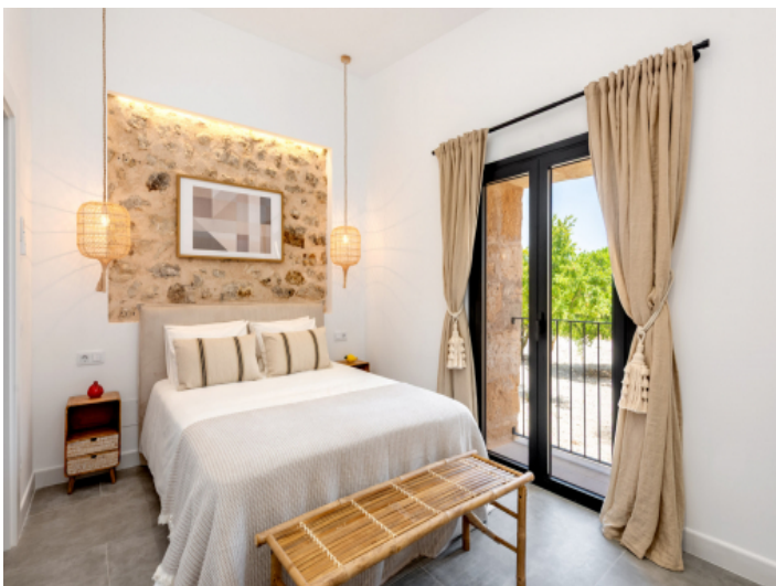
Cozy bedroom with stone wall