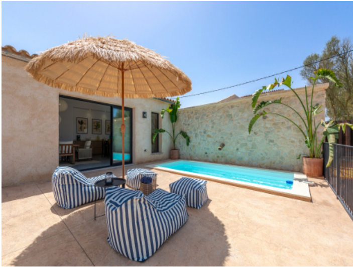
Fina with spacious outdoor area