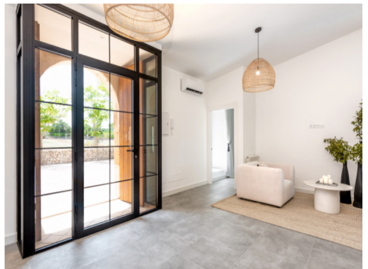
Bright entrance with garden view