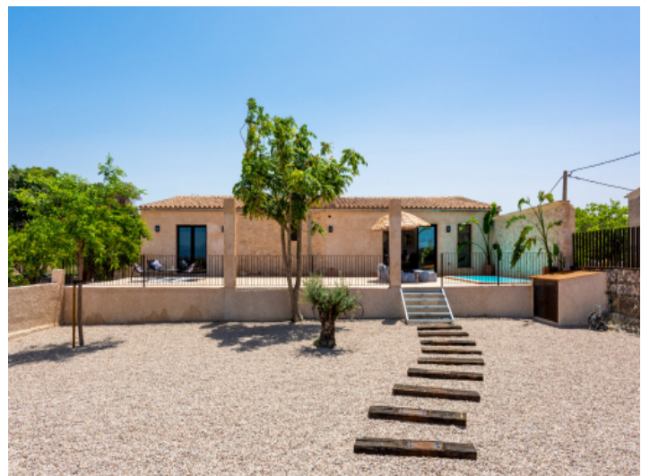
Comfort on one single level