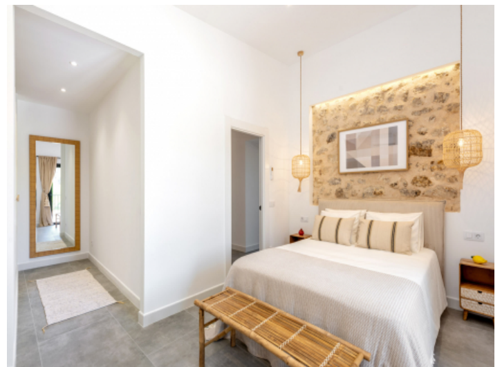
One of the three bedrooms