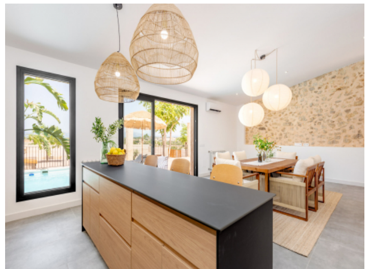
Open kitchen and dining space with pool access