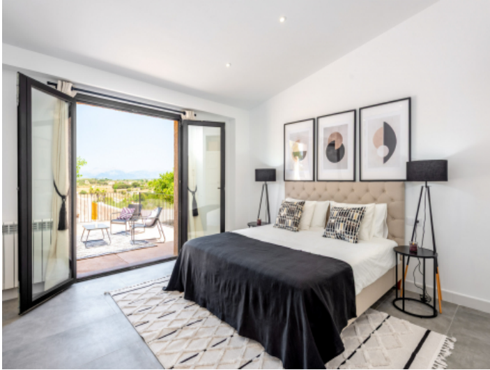
Bedroom with panoramic view and direct access to the terrace