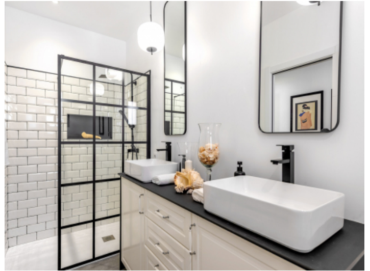
Elegant bathroom with double sink and glass shower