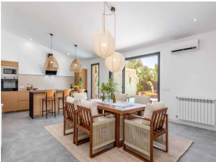
Kitchen and modern and cosy dining area