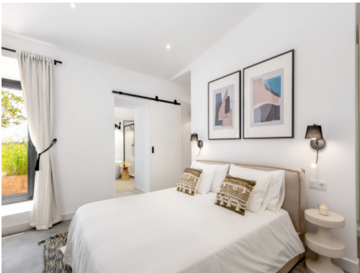
One of the three bedrooms