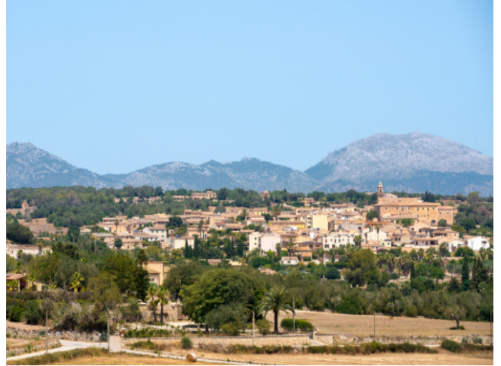
Views to the town