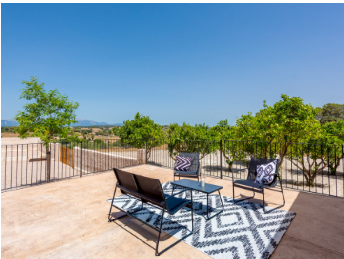
Modern design meets nature - Finca with pool terrace