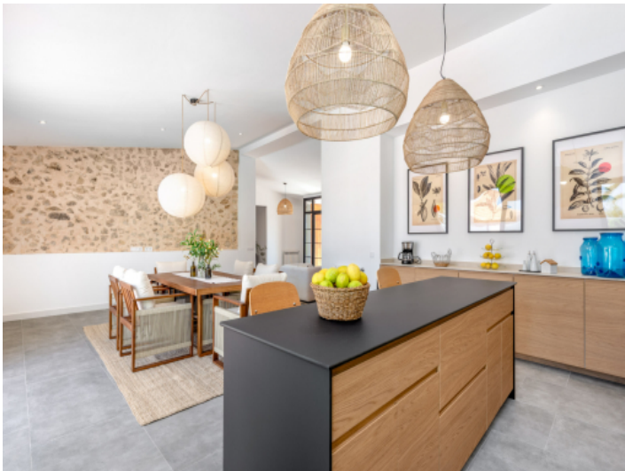
Stylish open kitchen and dining area with Mallorcan charm