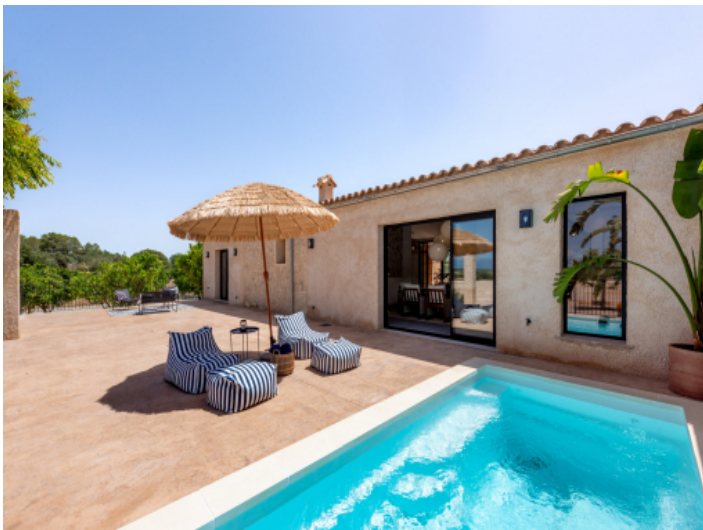
Refresh and relax – Pool area with countryside views