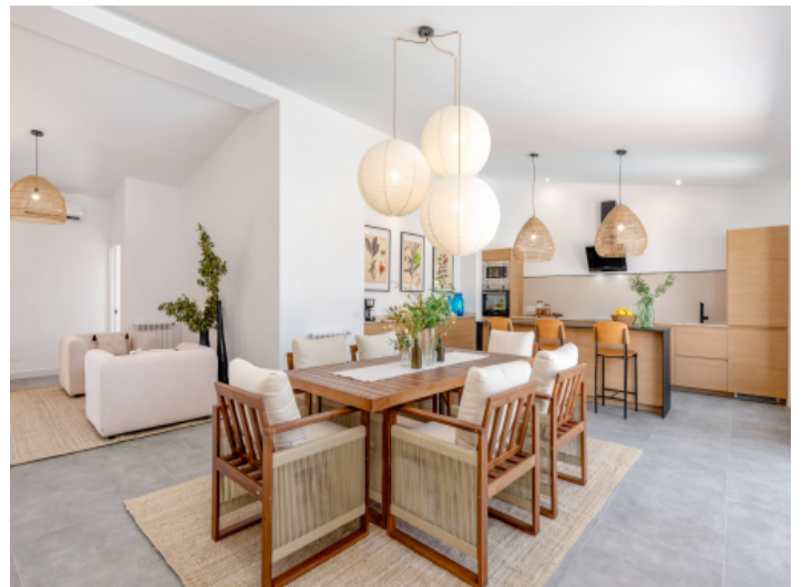
Open space with style