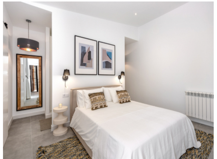
One of the three bedrooms