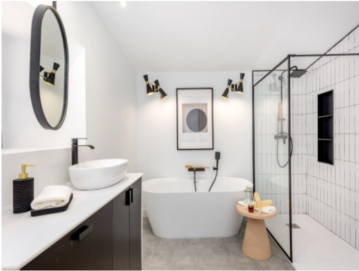
Bathroom with freestanding tub and walk-in shower in