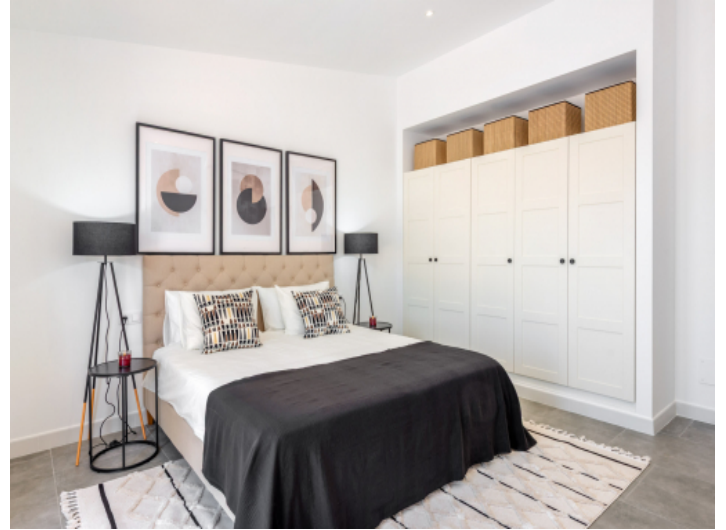
One of the three bedrooms