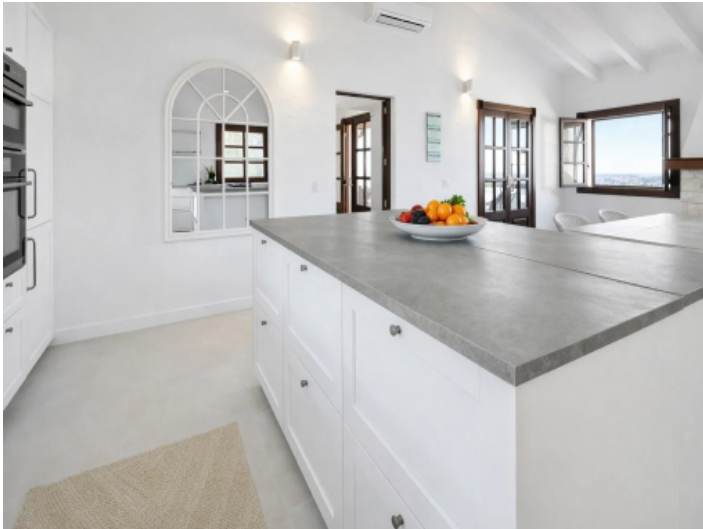
Kitchen with views