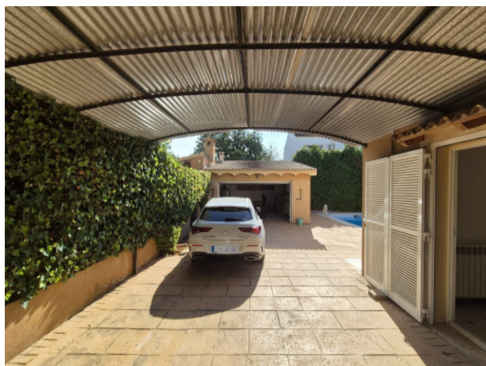
Garage and carport