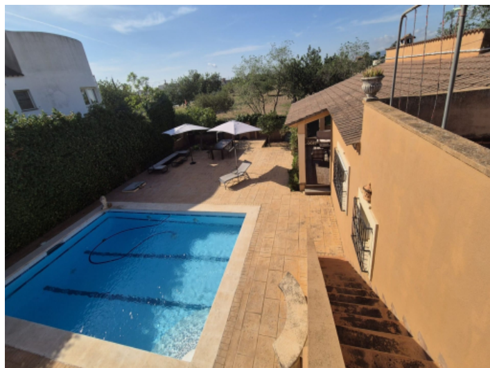
View from rooftop terrace