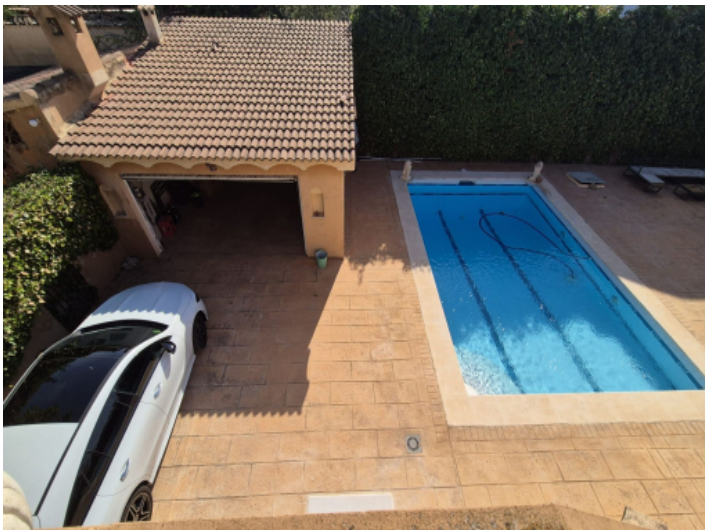
Garage and pool