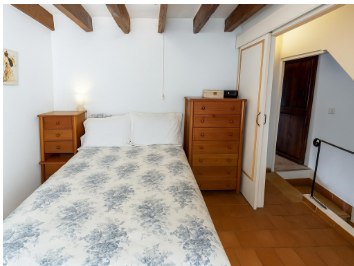
Cozy master bedroom with wooden furniture