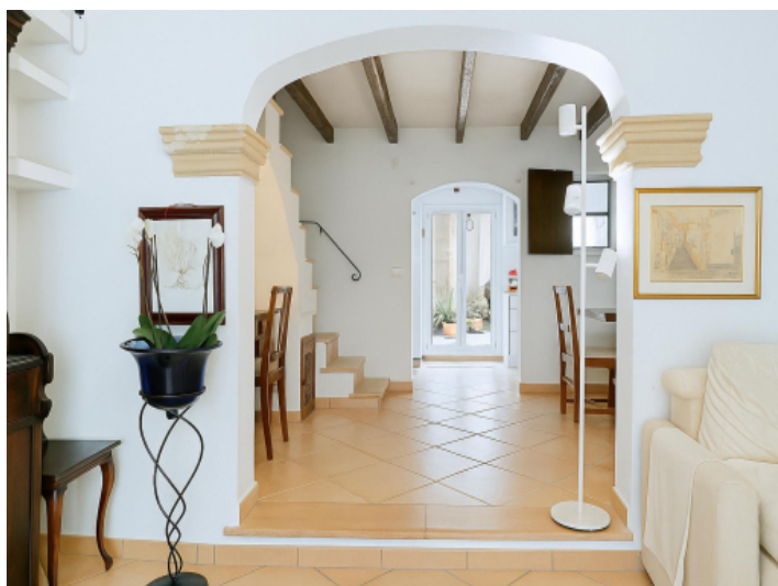
Elegant archway with hallway view