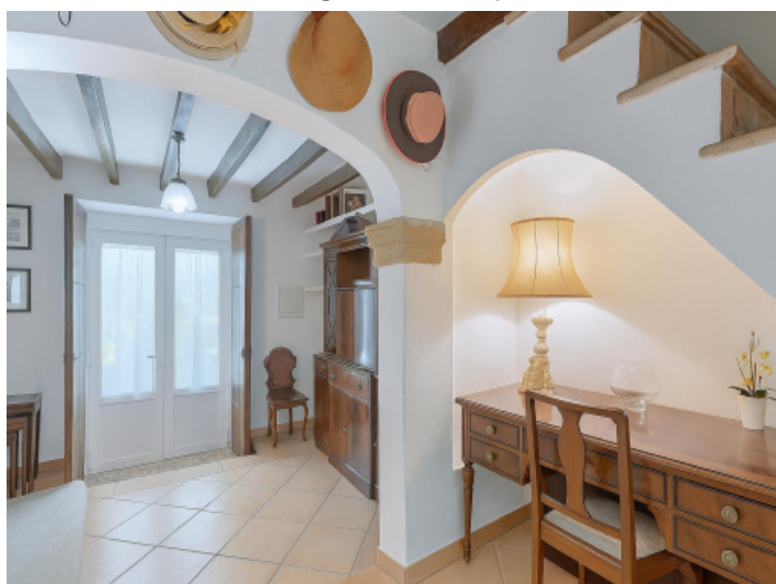
Classic staircase with stone details