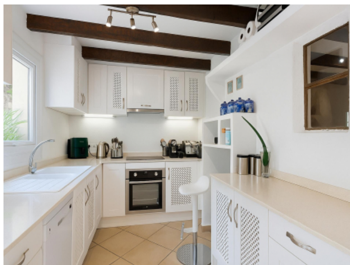
White modern kitchen with traditional beams