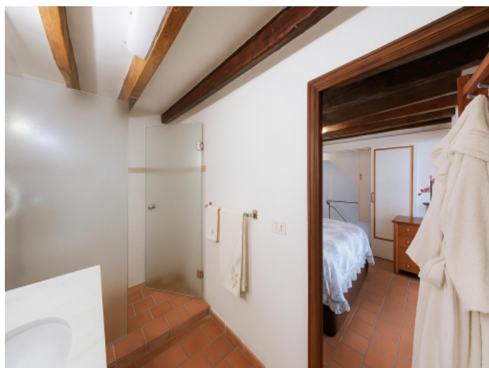
Bathroom with walk-in shower and wood details