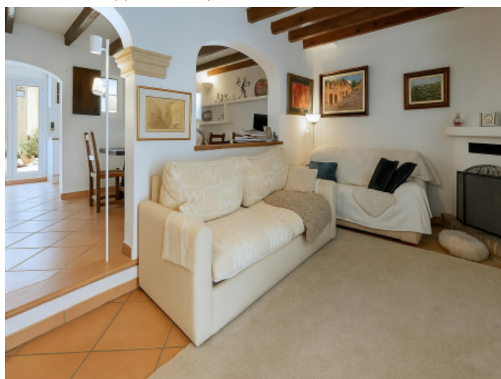
Cozy living room with wooden beams