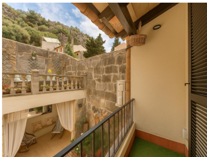
Upper balcony with traditional shutters