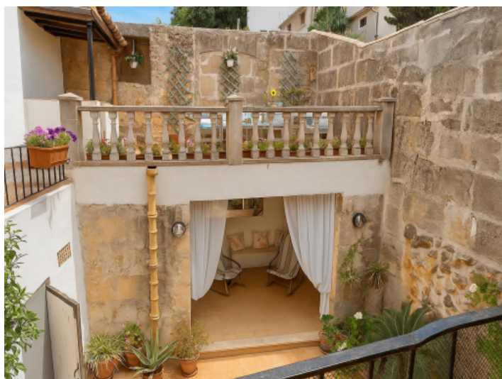
Charming terrace with plants