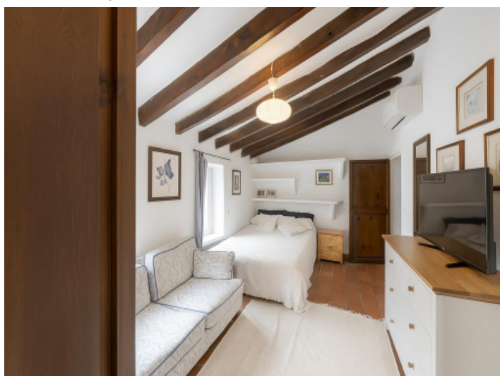
Second bedroom with beamed ceiling