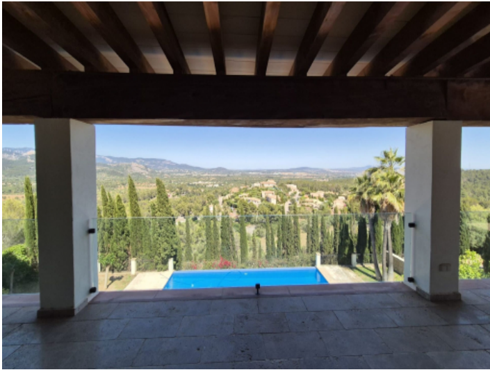
Terrace with views