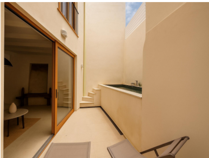
Patio with pool