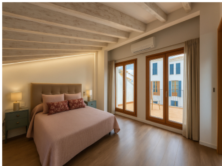
Suite with private terrace