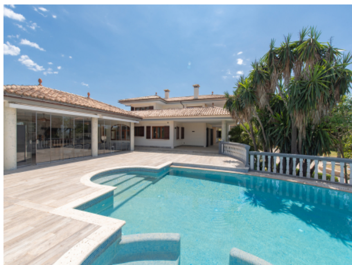
Pool with view to the summer kitchen