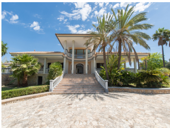
Fantastic entrance area