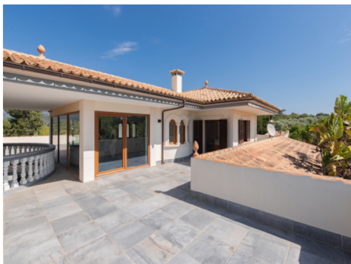
Terrace on the upper floor