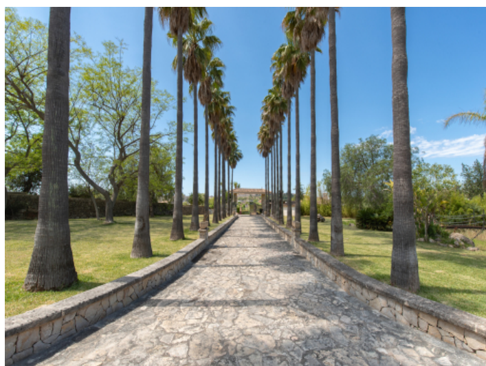
Great driveway with palm trees