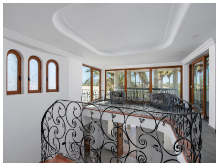
Staircase to the upper floor