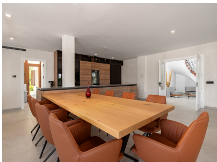
Large kitchen with dining area