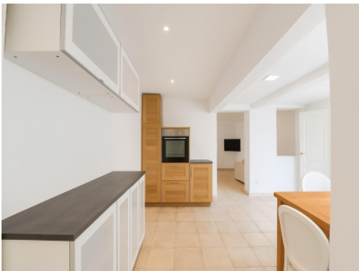
Second kitchen angle with built-in oven and ample storage