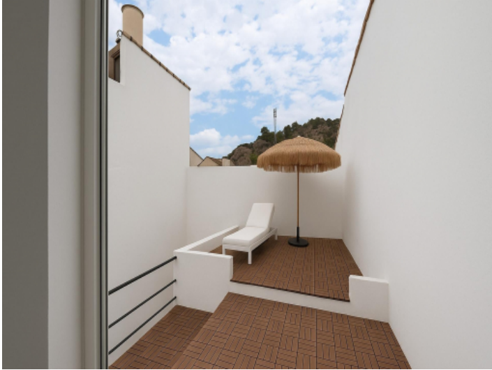
Private sun deck with mountain views and tropical umbrella