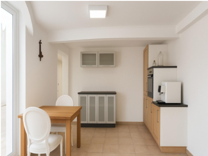
Bright breakfast area with garden access