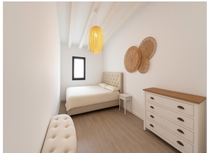
Cozy third bedroom with warm tones and wooden decor