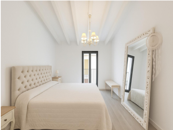
Charming double bedroom with French balcony