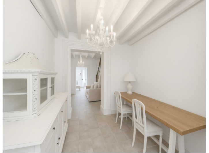
Elegant dining and work space with classic details