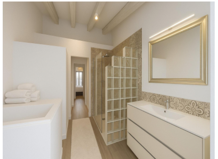
Stylish bathroom with walk-in shower and designer tiles

PORTA MALLORQUINA • C./ COLOM 20 2º, 07001 PALMA, SPAIN