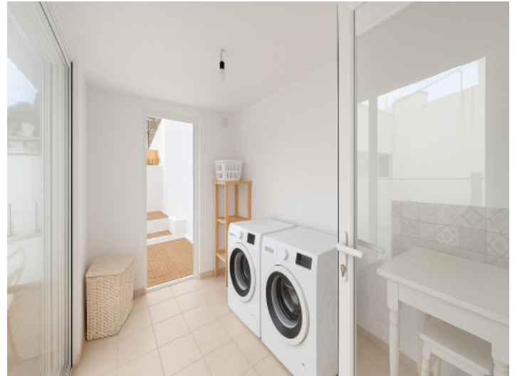
Functional laundry room with outdoor access