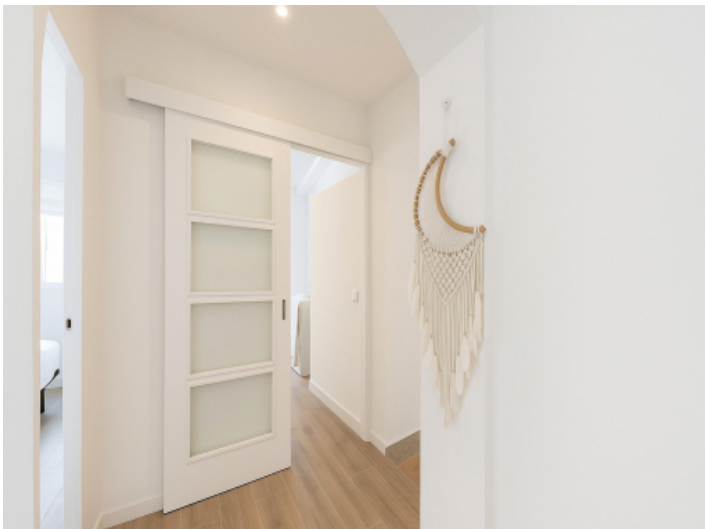
Bright upper floor hallway with sliding door