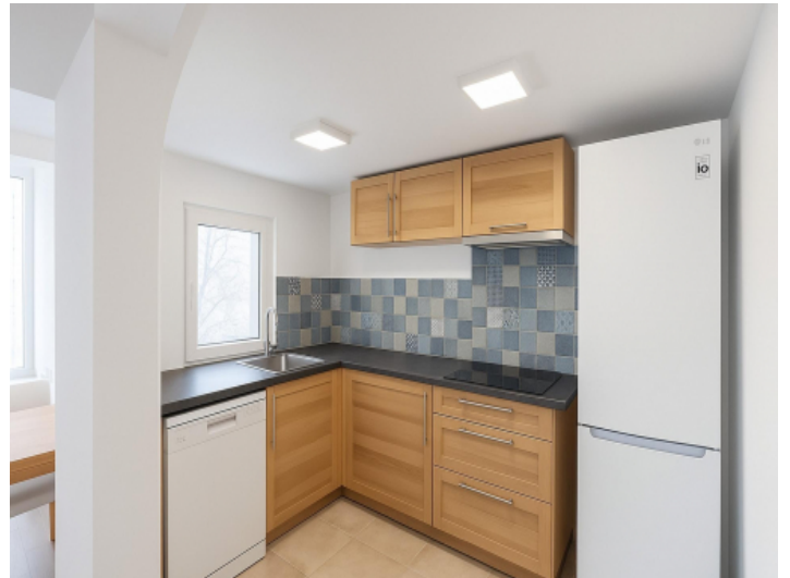
Fully equipped kitchen with modern tile backsplash