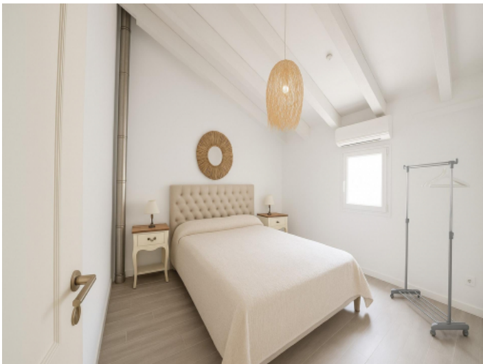
Elegant master bedroom with natural light and large mirror