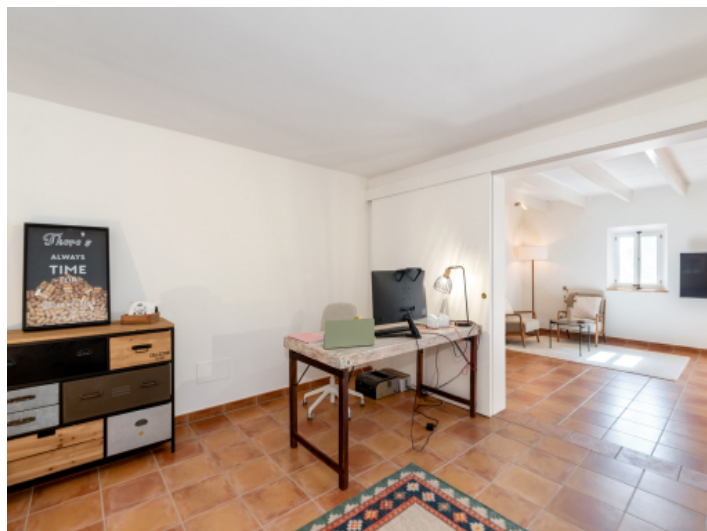
Office with pull-out couch