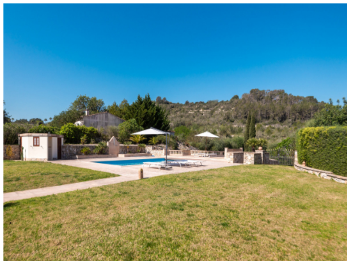
Swimming pool area