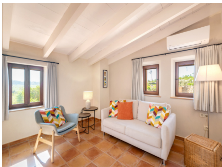
Living area of the guest apartment