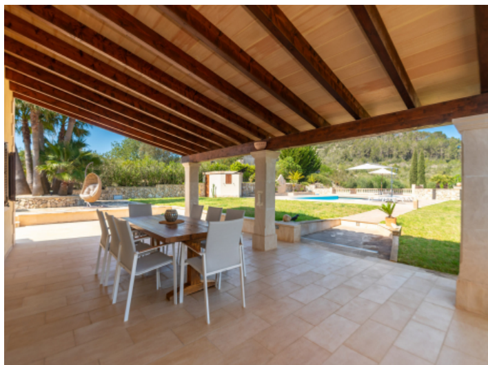
Large veranda ideal for outdoor living