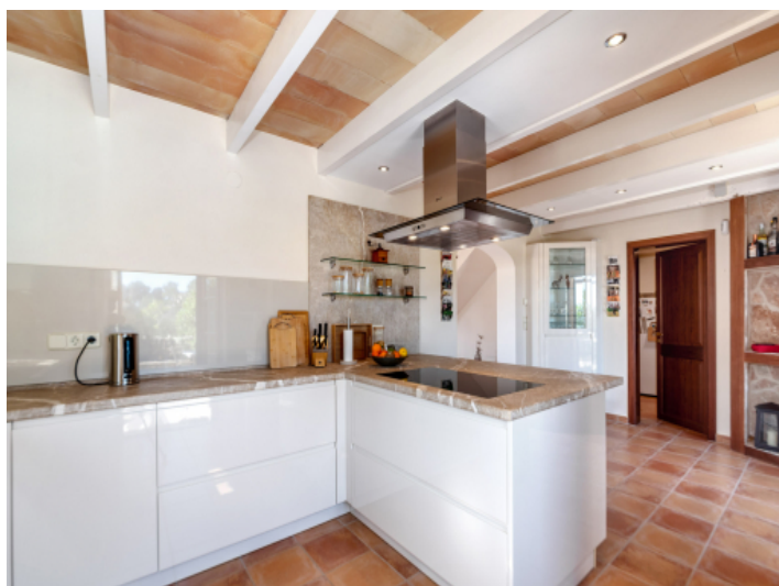
Fully fitted modern kitchen