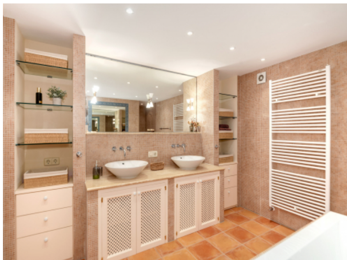
Spacious bathroom with both shower and bathtub