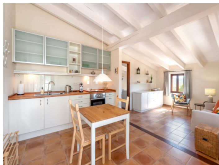
Kitchen, living and dining area