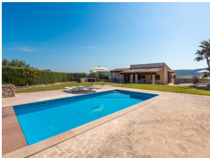
Finca in Sineu with swimming pool