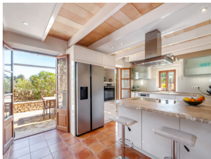
Kitchen with access to the lower terrace