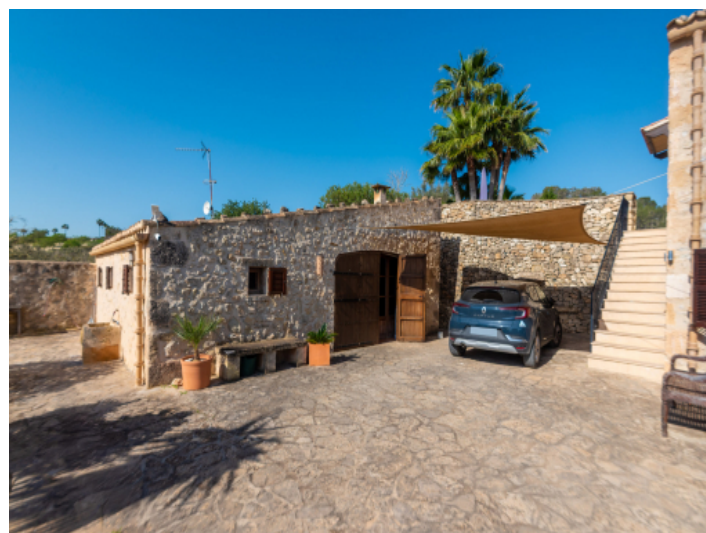
Versatile garage – ideal for hobbies, storage or a workshop