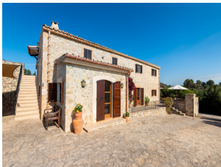
Finca with self-contained guest apartment