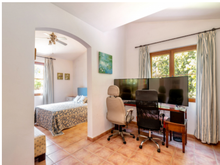
First bedroom in the left wing