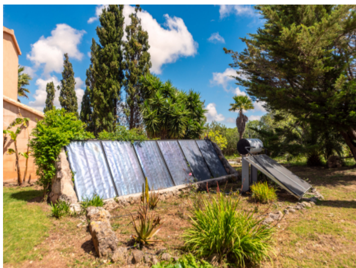
Solar for warm water