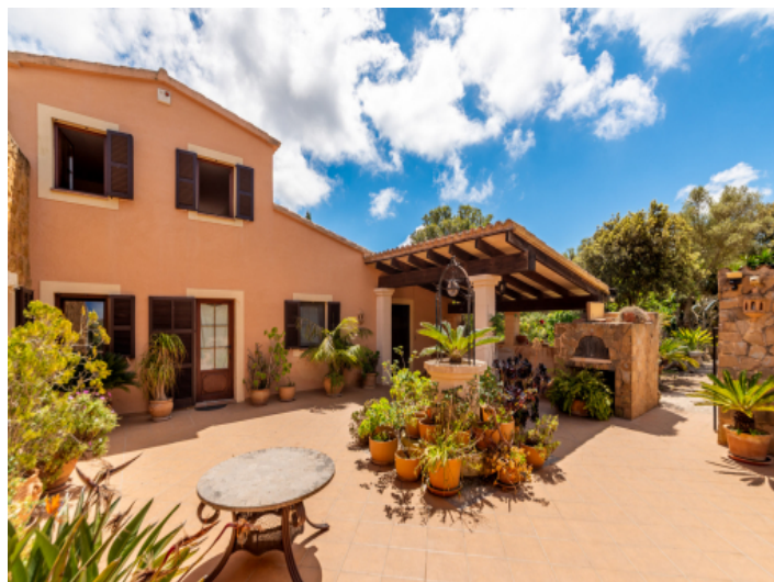
Finca and patio