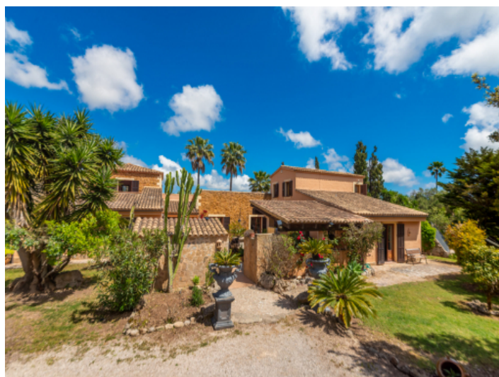
Finca in Arta