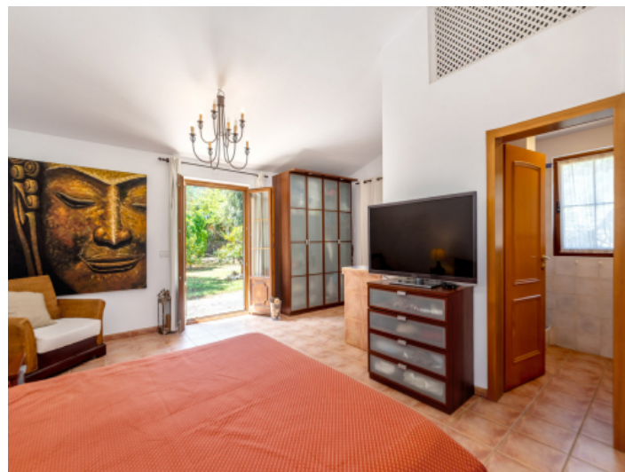
Third bedroom in the right wing with en suite bathroom