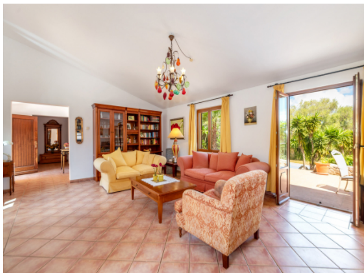
Living area with fireplace and access to the patio and pool terrace