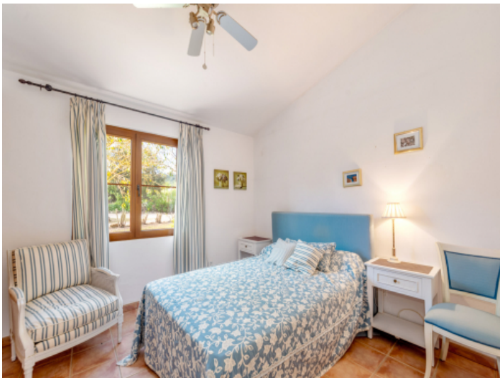
Bedroom in left wing