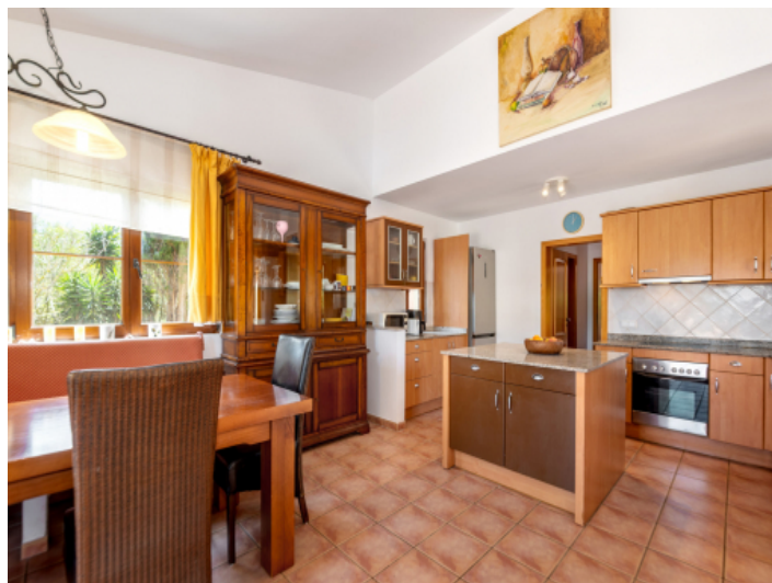
Dining area with open kitchen