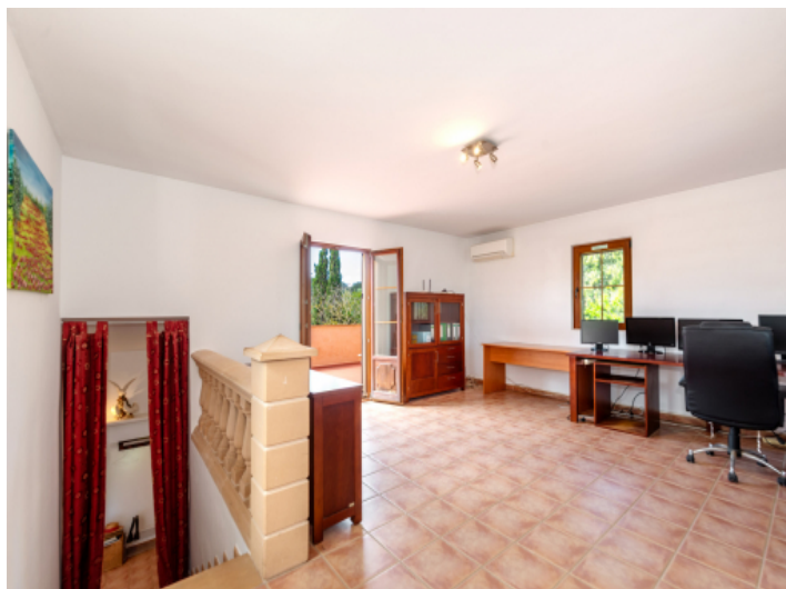
Upper floor with private terrace