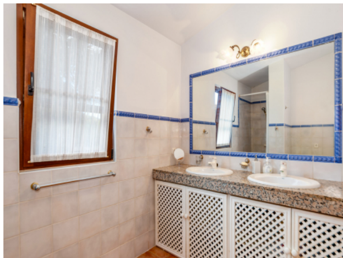
Bathroom in the left wing