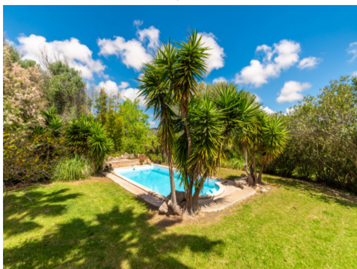
Pool and garden