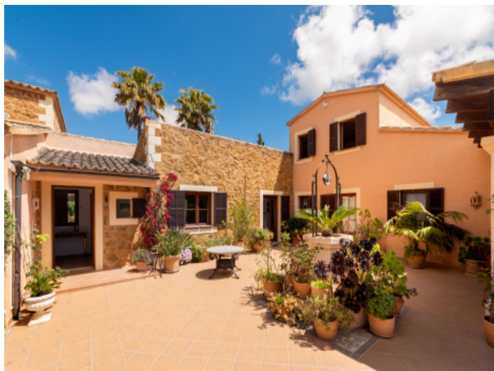
Finca in Artà with cosy patio