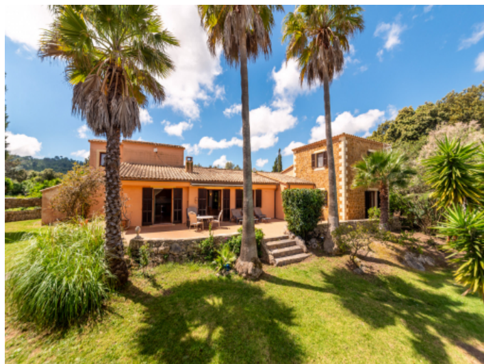
Finca from the pool side