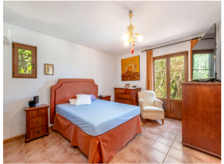
Bedroom in left wing