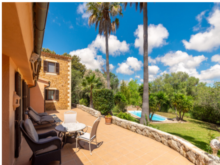
Terrace at the back