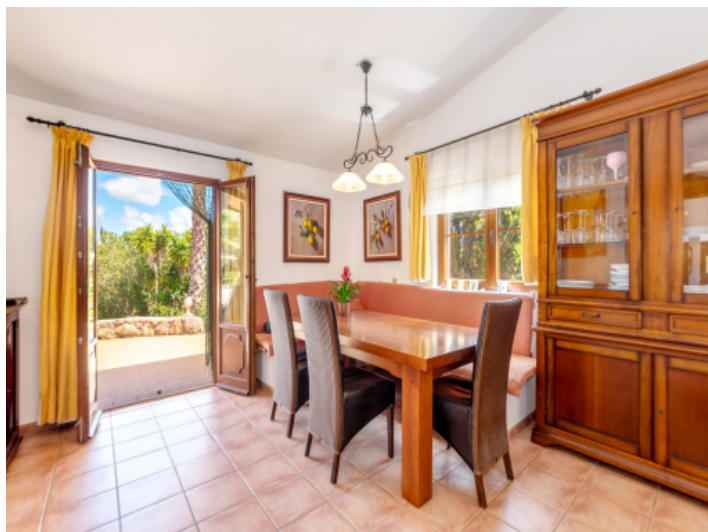
Dining area with open kitchen