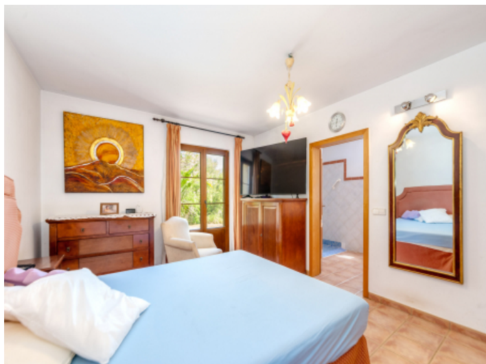
Second bedroom in the left wing