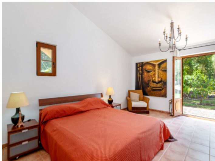
Third bedroom in the right wing