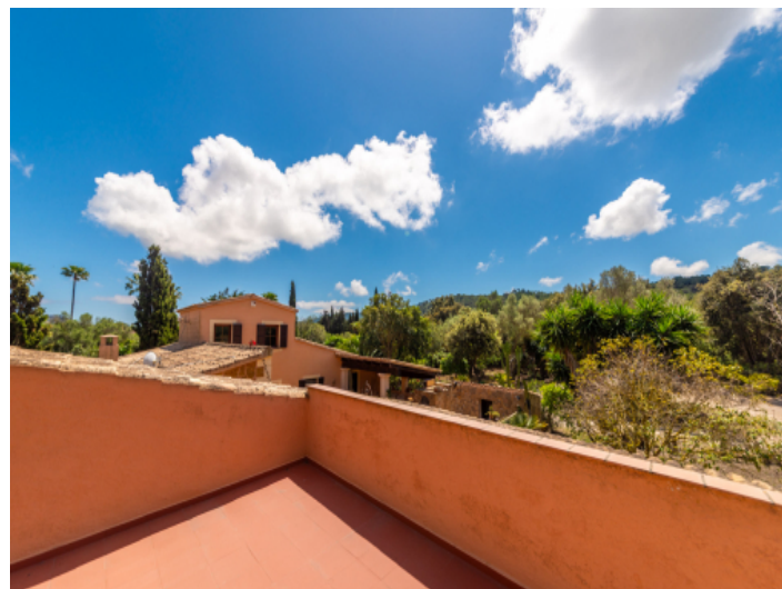
View from the upper terrace