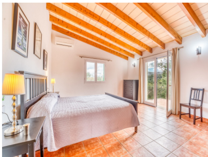
Second double bedroom first floor

PORTA MALLORQUINA • C./ COLOM 20 2º, 07001 PALMA, SPAIN