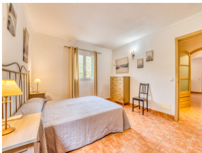
First of five double bedrooms Ground floor