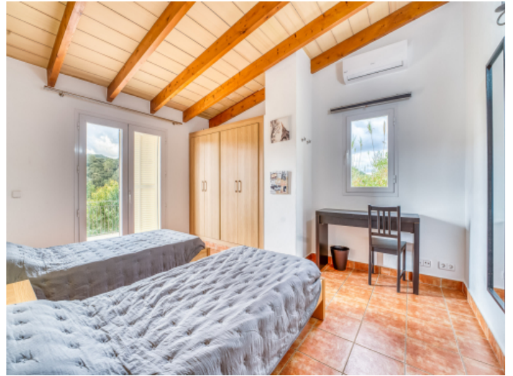
Third double bedroom first floor