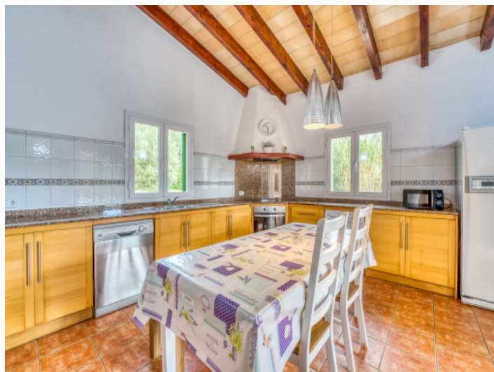
Spacious country kitchen with wooden elements