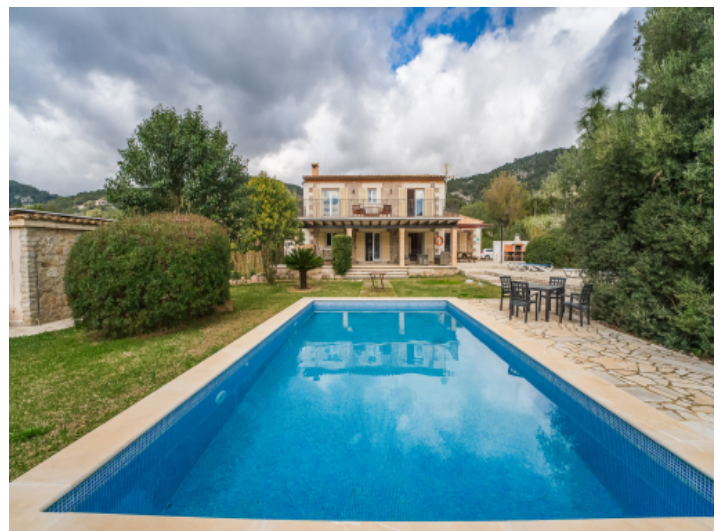
Idyllic finca with pool and mountain views