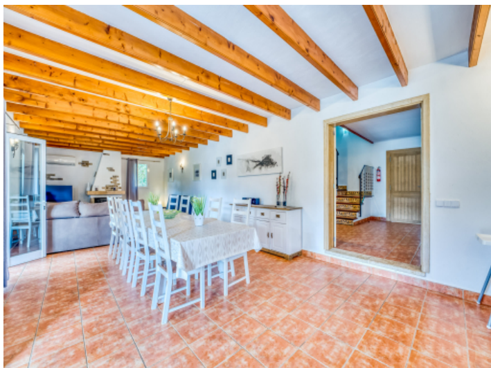
Spacious dining room with fireplace and wooden beams