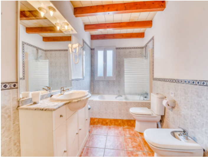
Second of three bathrooms first floor