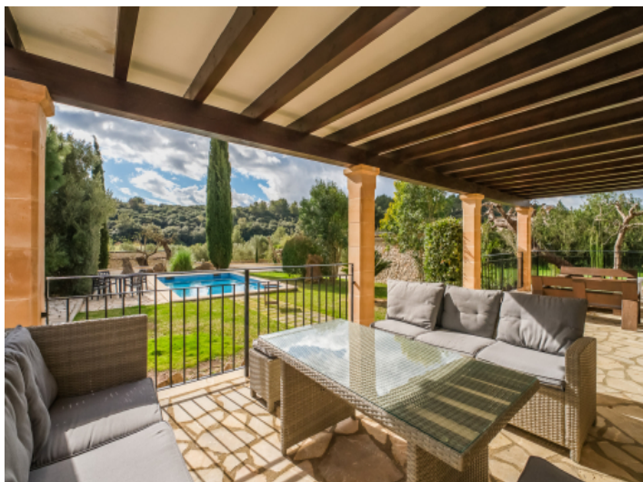
Covered terrace with pool and nature views