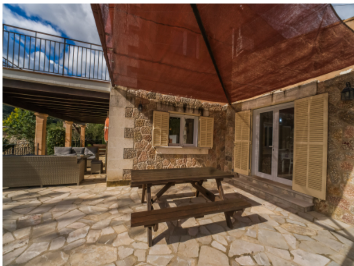
Cozy terrace with rustic charm