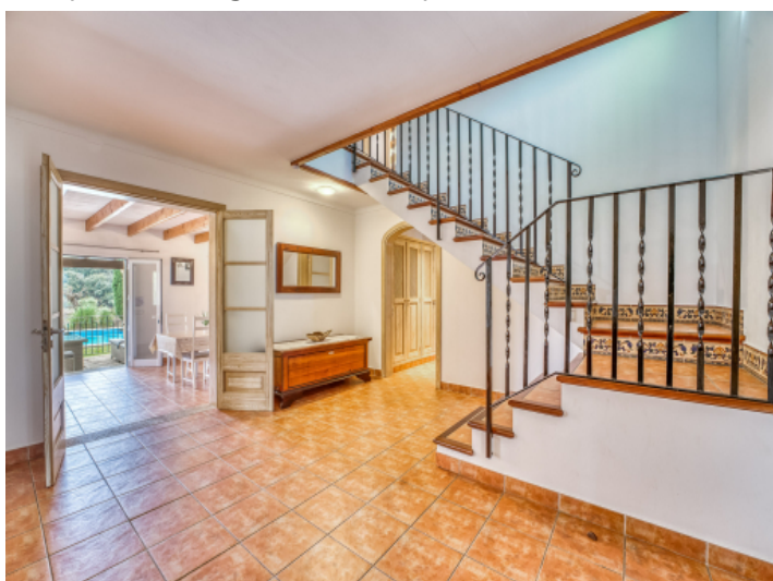
Bright entrance with traditional staircase