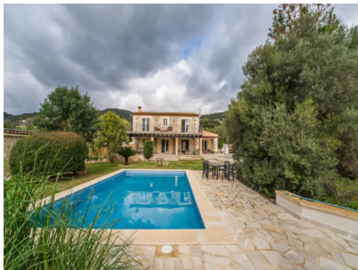
Dreamy finca with pool and mountain views