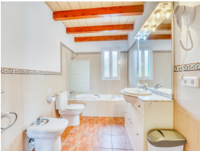
Third of three bathrooms first floor