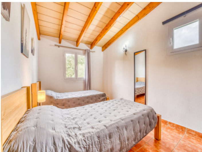
Fifth of five bedrooms