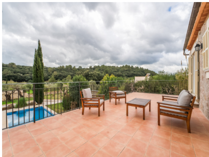
Spacious terrace with panoramic nature views