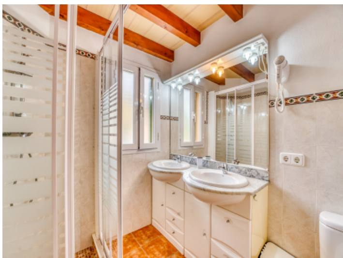
One of three bathrooms ground floor