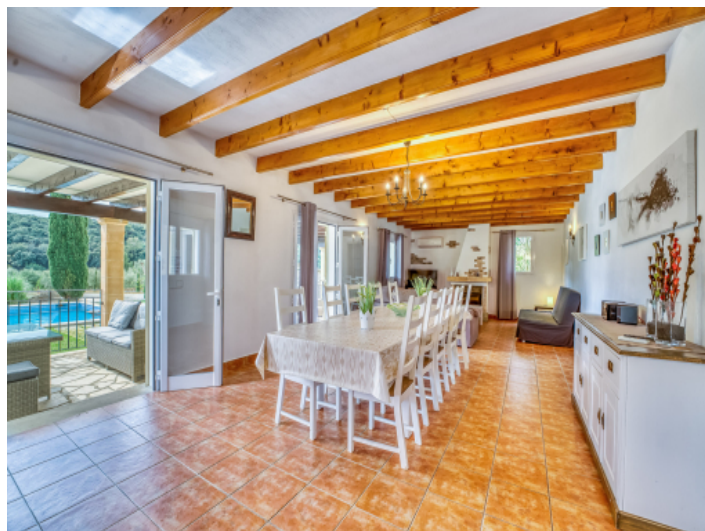
Bright dining room with fireplace and terrace access