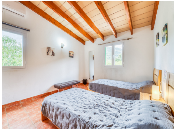
Fourth of five bedrooms