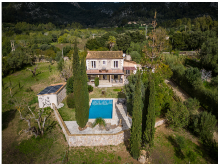
Charming finca with pool and nature views