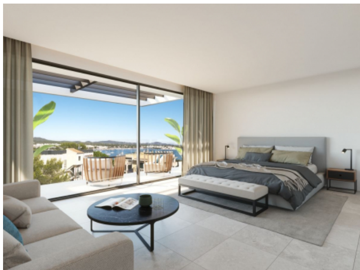
Master bedroom with a view