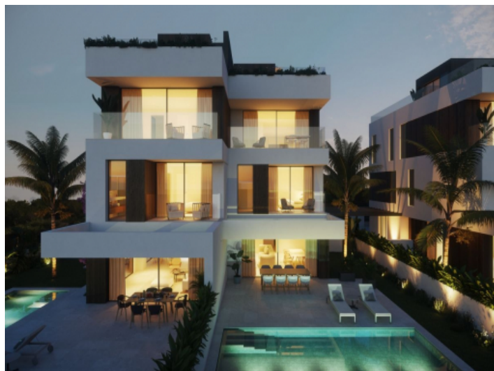
The house at night