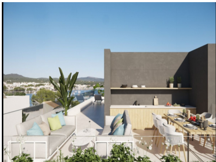
Spacious rooftop terrace