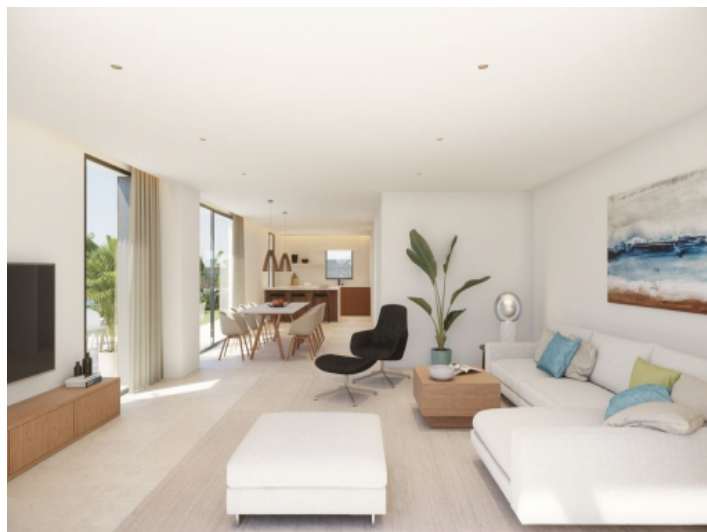
Alternative view of the living area