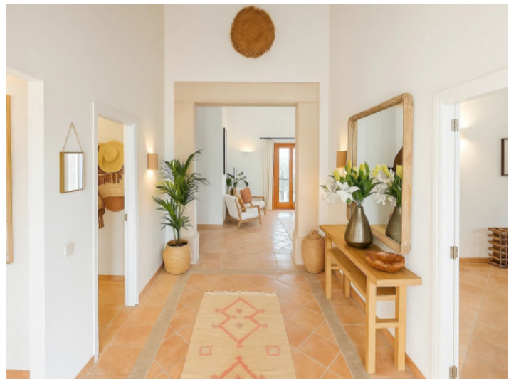
The entrance hall of the main house