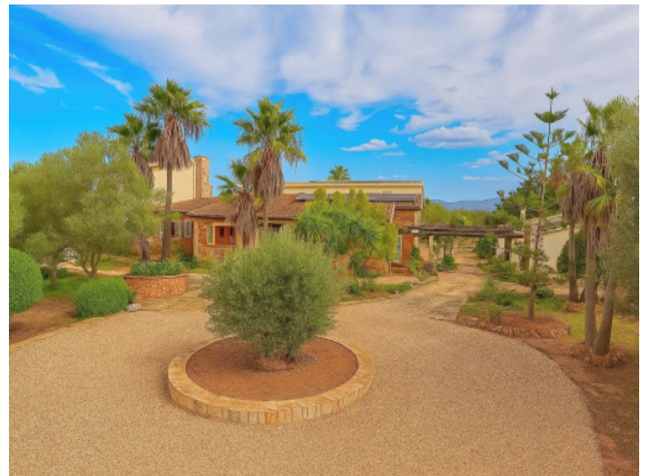
Circular driveway of the country house