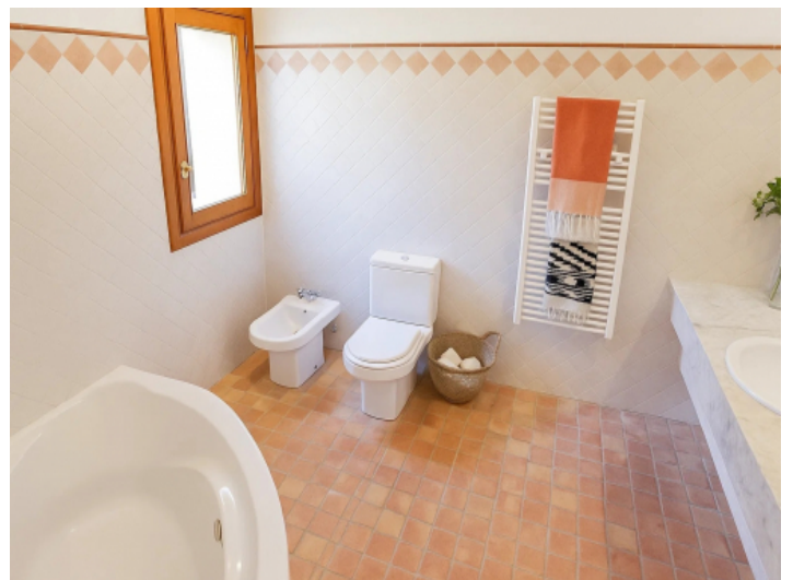
The main bathroom