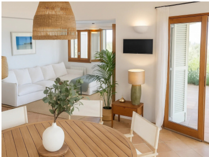
Separate guest area of the main house