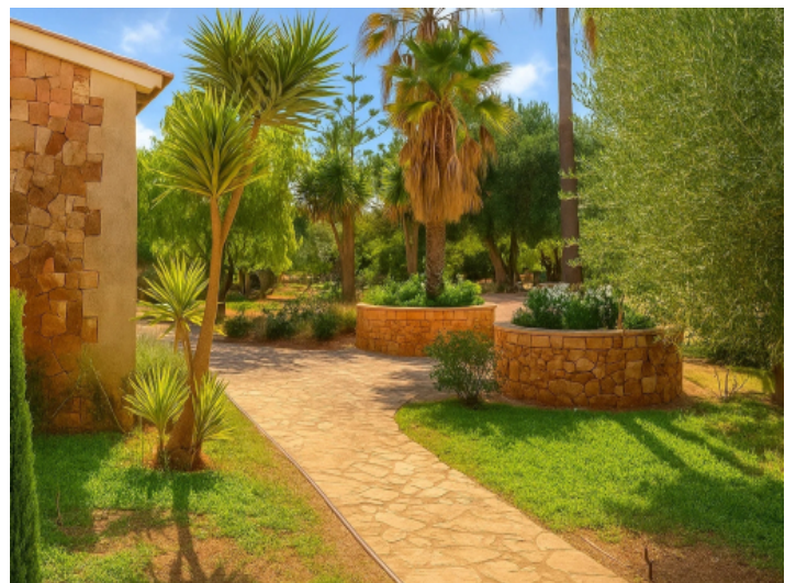
Impressive driveway to the houses