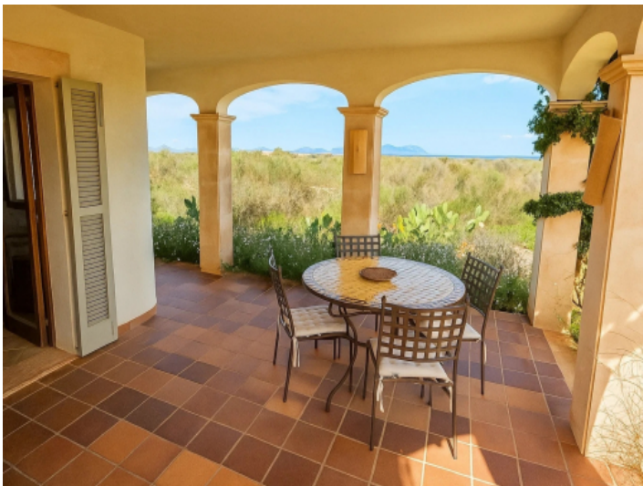
View towards the Bay of Alcudia