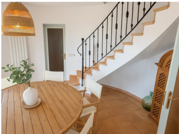
Staircase up to the bedrooms