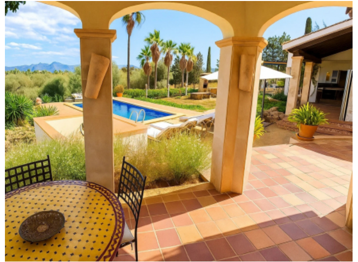
View from the guest wing terrace