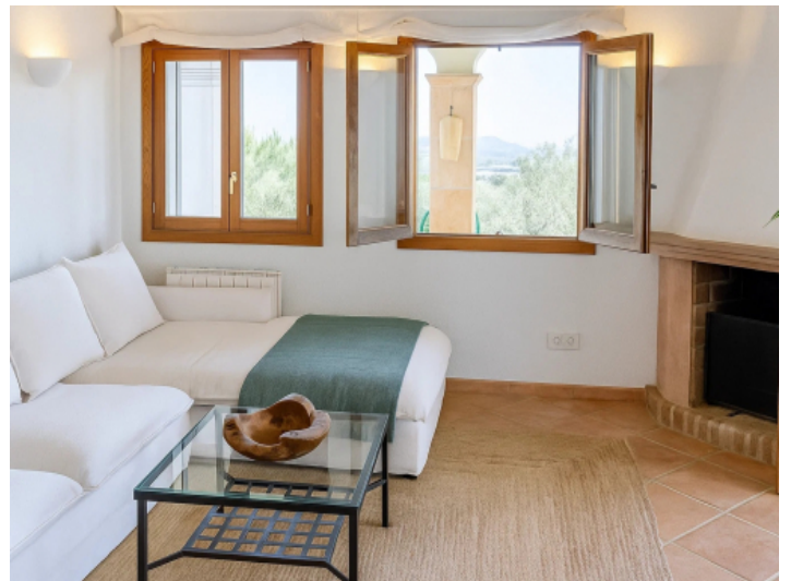
Living room of the self-contained apartment