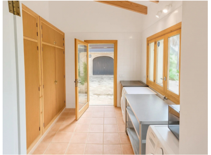
Laundry room with access to the outdoors