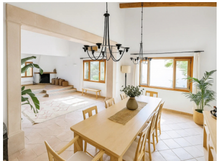
Dining area flowing into the living area