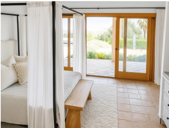
The master suite in the main house