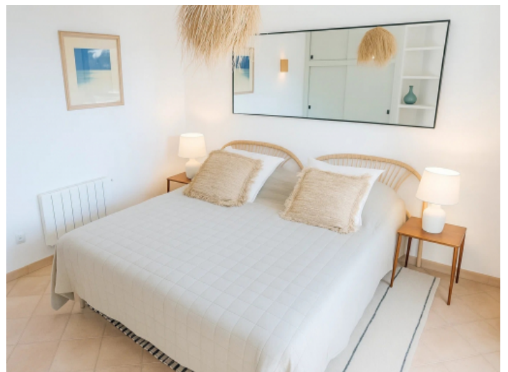
First bedroom of the self-contained apartment