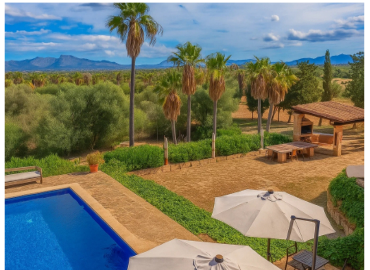
View over the garden and countryside