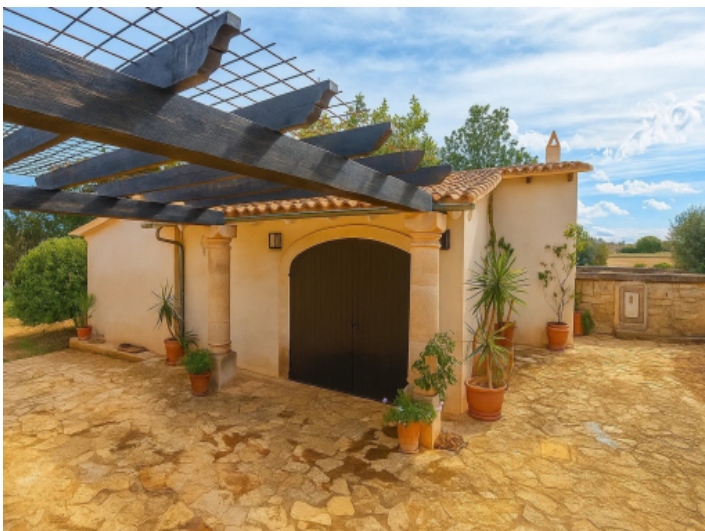
Separate guest house