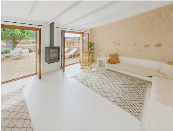
Stylish living room of the separate guest house