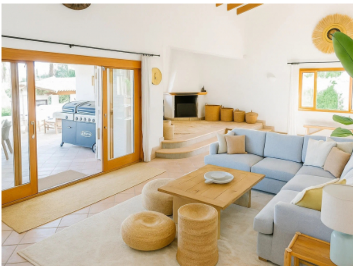
Modern living room with fireplace nook and terrace access