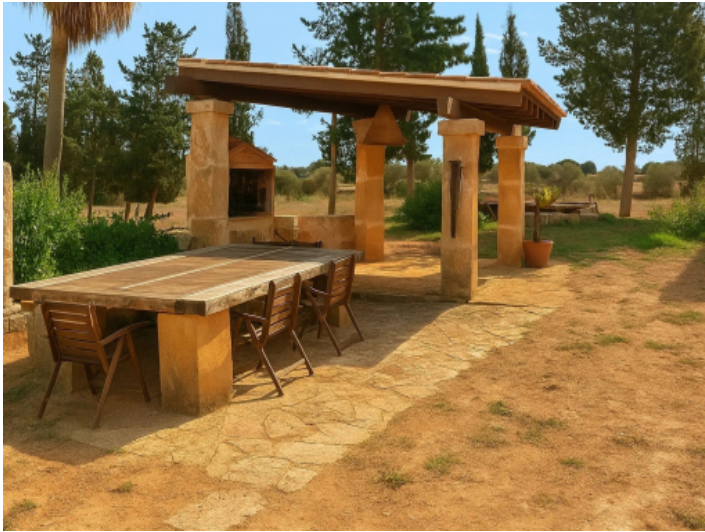
Covered barbecue area