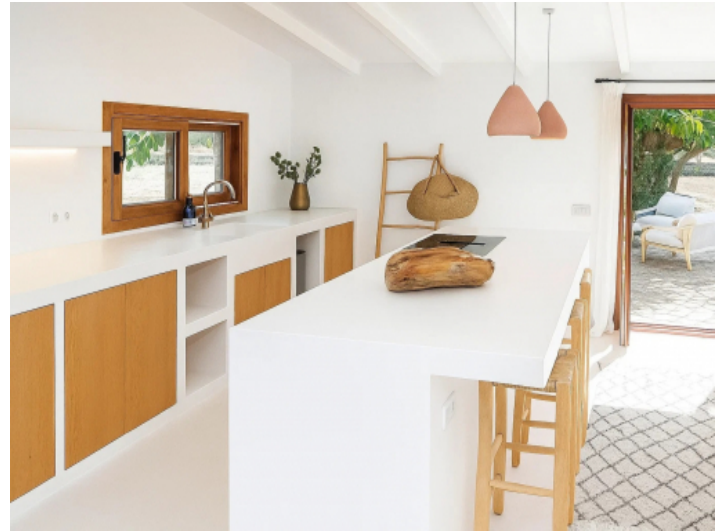
Fully equipped kitchen of the separate guest house