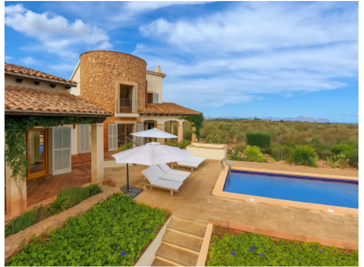
Finca with panoramic views