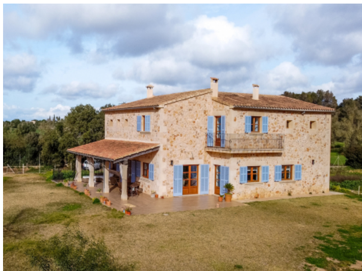
Exclusive natural stone finca with pool and panoramic views