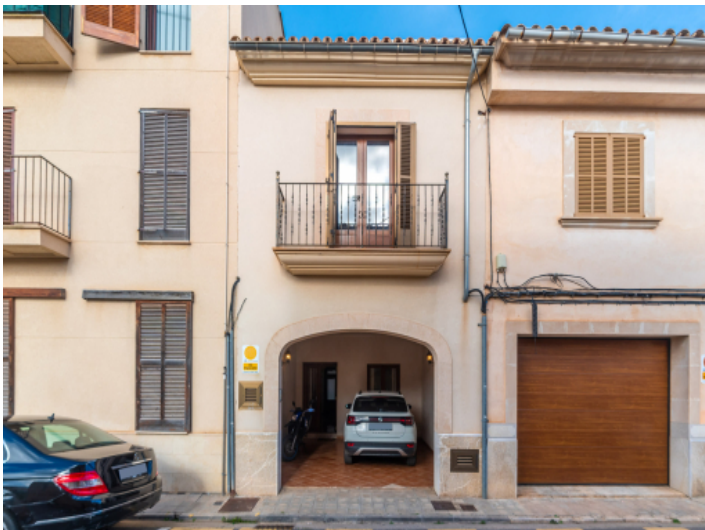
Front view and garage