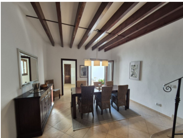
Dining area with patio access