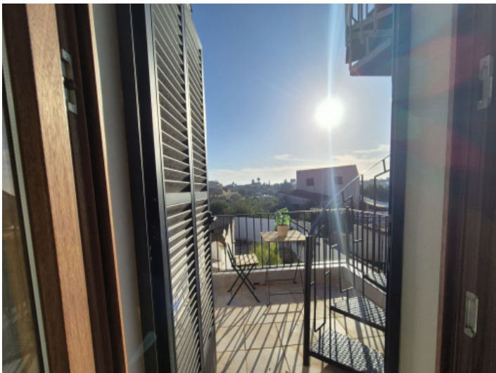
View to the rooftop terrace