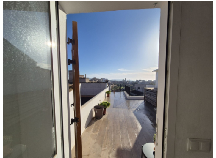
Access to the rooftop terrace