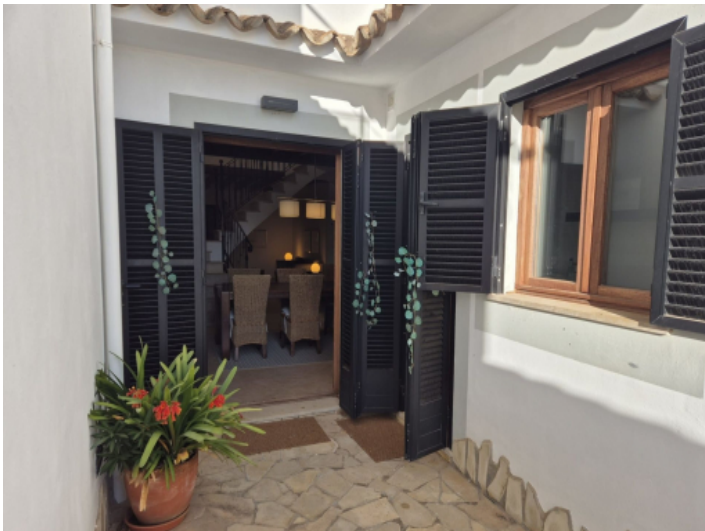
View from the patio to the dining area