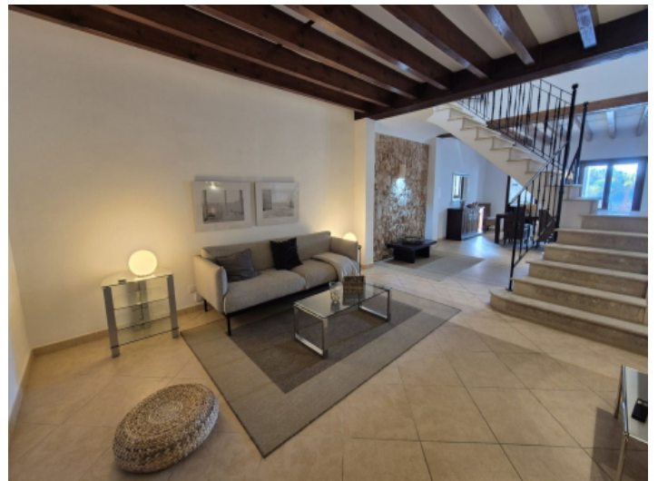
Cozy living and dining area