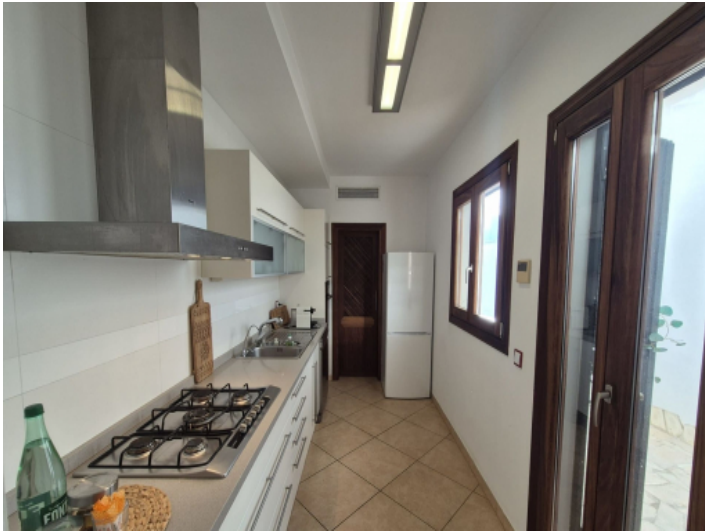
Sun flooded kitchen