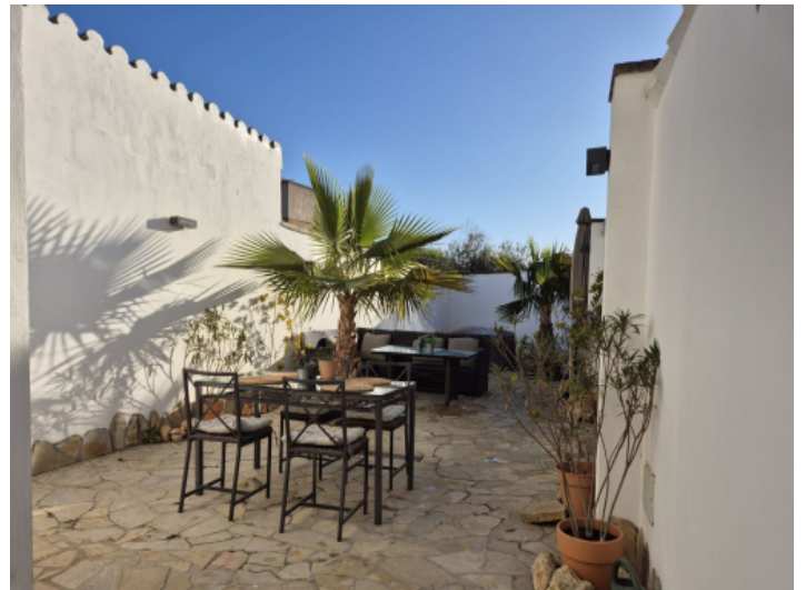
Tastefully renovated townhouse with cozy patio in Llucmajor