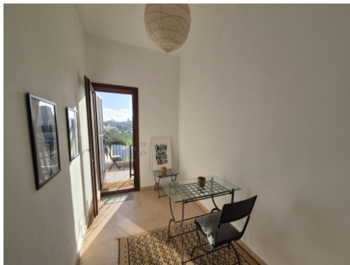
Access rooftop terrace