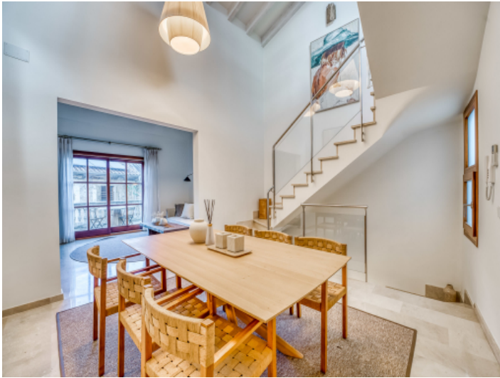
Gallery and dining area