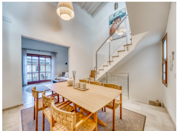
Gallery and dining area