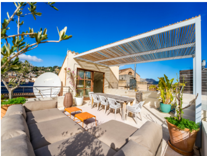
Roof top terrace with a view