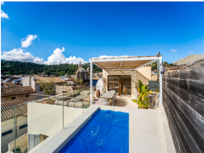
Roof top terrace with pool