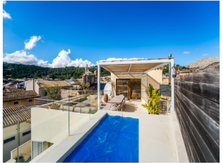
Roof top terrace with pool