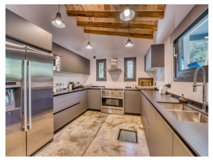
Modern, fully equipped kitchen