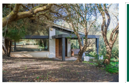
Cala Mesquida search for property MAL-122071