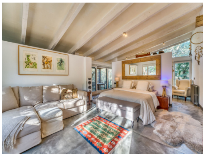
The master suite of the modern villa