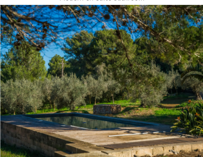
The pool surrounded by nature and olive trees