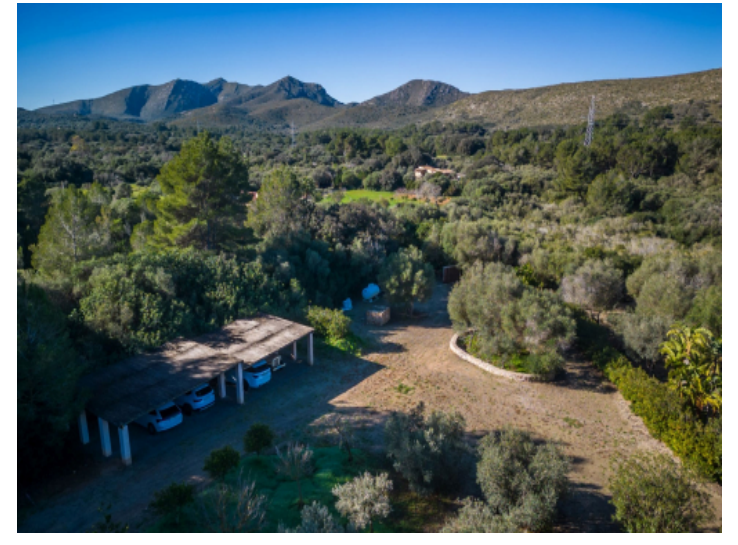
Driveway and covered parking spaces

PORTA MALLORQUINA • C./ COLOM 20 2°, 07001 PALMA, SPAIN TEL.: +34 971 698 242 • INFO@PORTAMALLORQUINA.COM • WWW.PORTAMALLORQUINA.COM