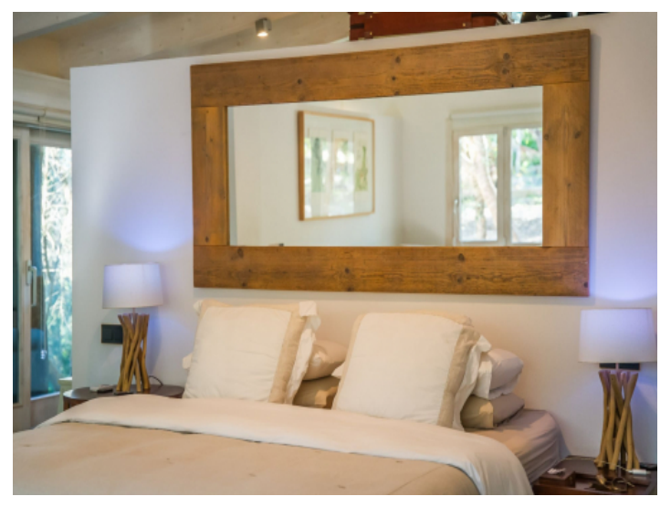
Classic furnishing of the master suite