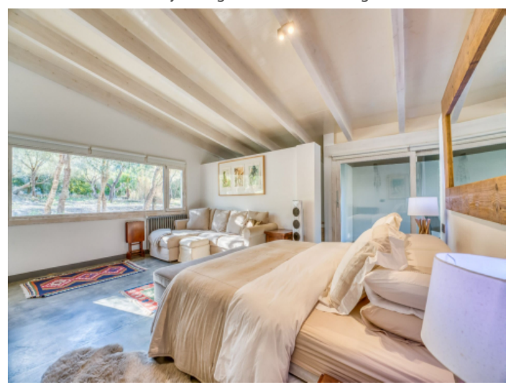
Generosity defines the master suite