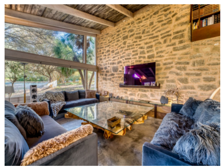
Romantic living area