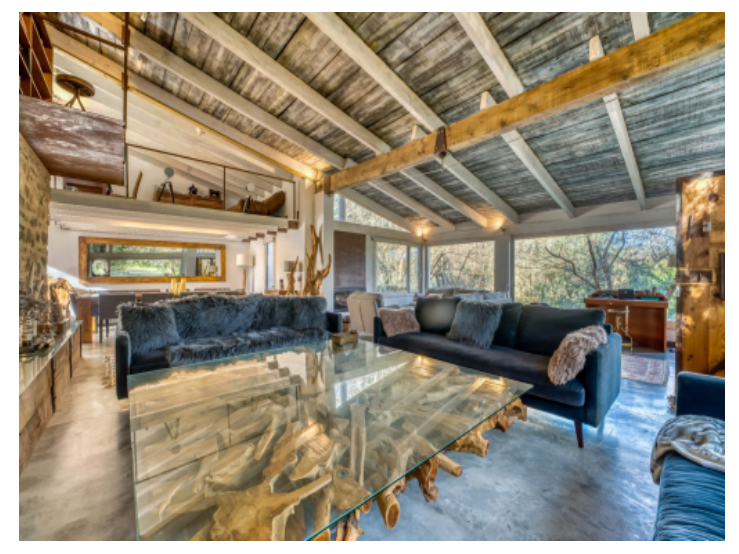
Modern country house in Cala Mesquida