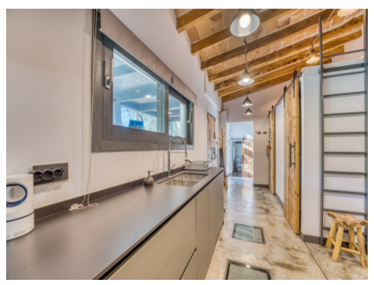
Pantry and guest WC on the right