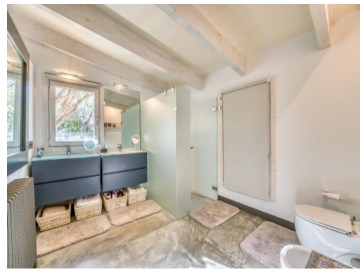
Modern en-suite bathroom