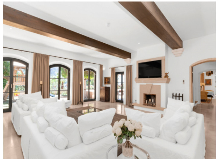
Large living area with fireplace