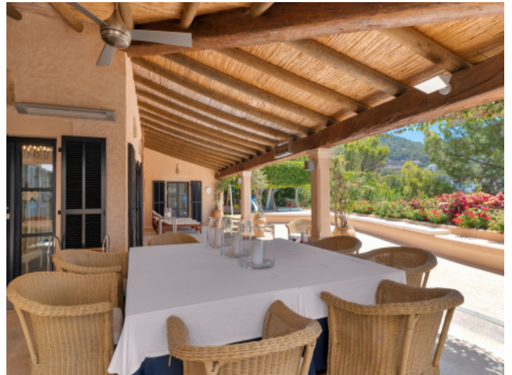
Dining al Fresco