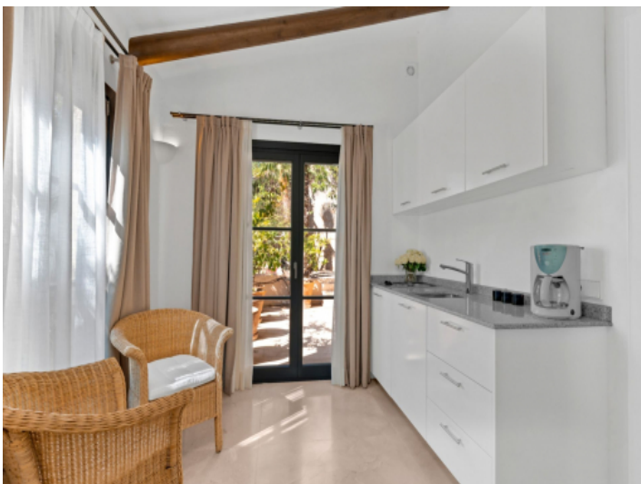
Kitchen guest area