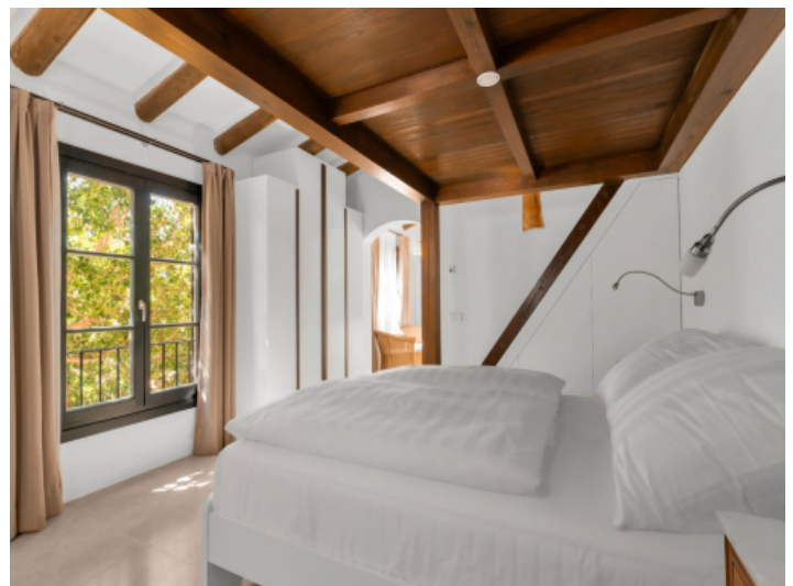
Bedroom guest area