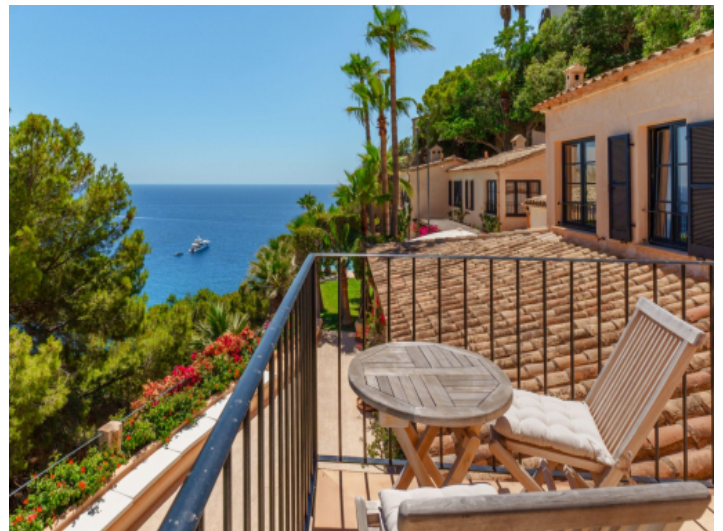
Amazing sea views