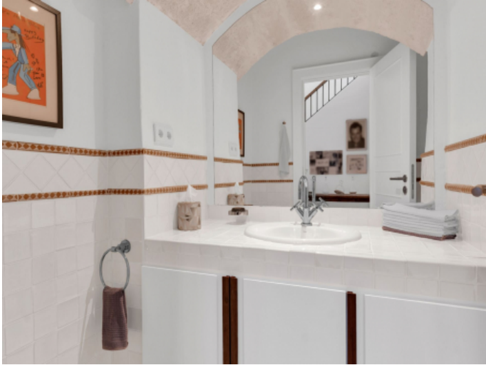
Bathroom guest area