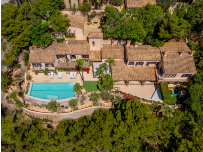
View to this amazing property