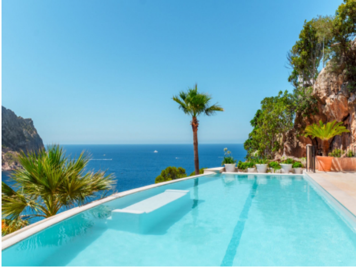
Fantastic pool area