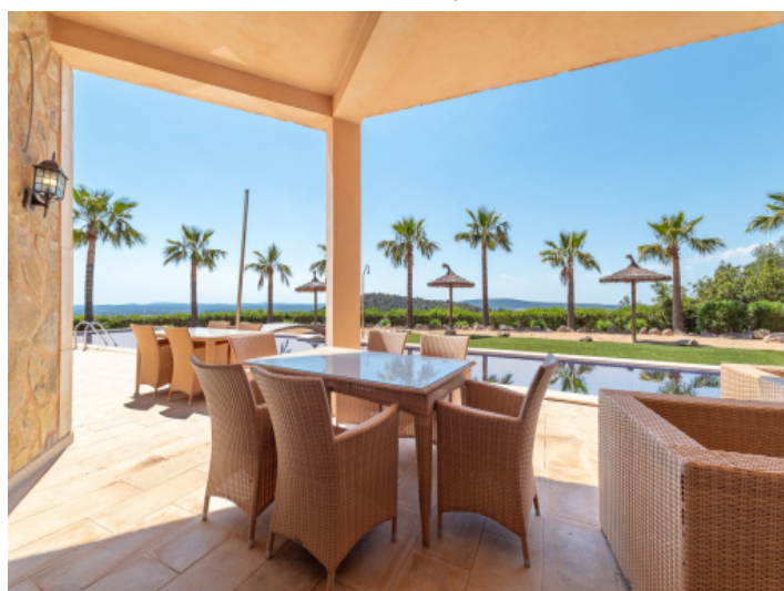
Covered terrace with dining area