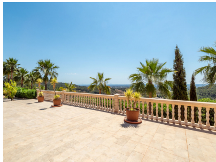
Terrace with views over the landscape