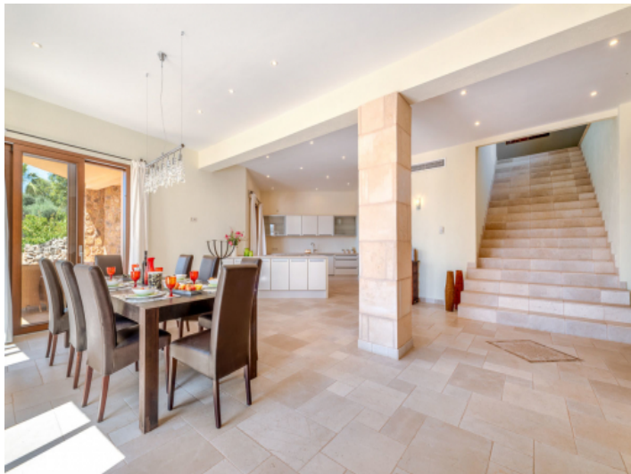
Dining area and open kitchen