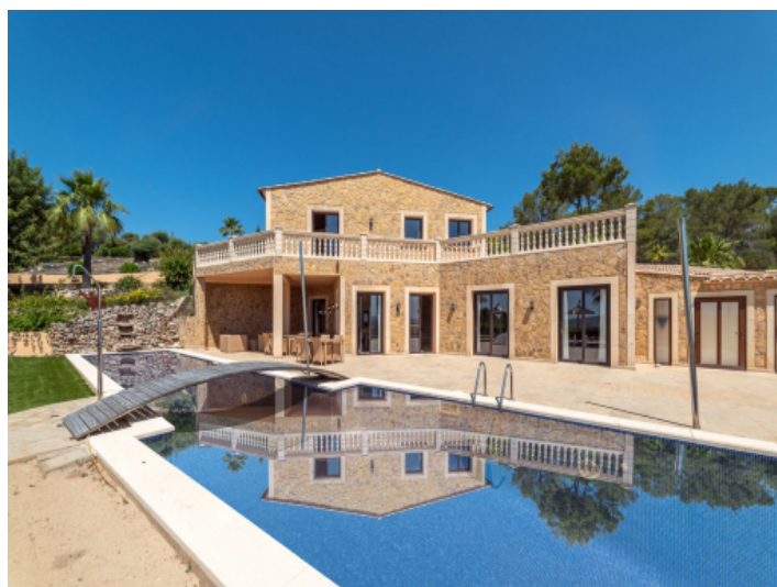
Exterior view and pool area