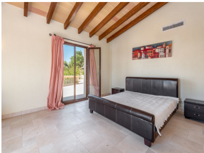
One of 10 bedrooms