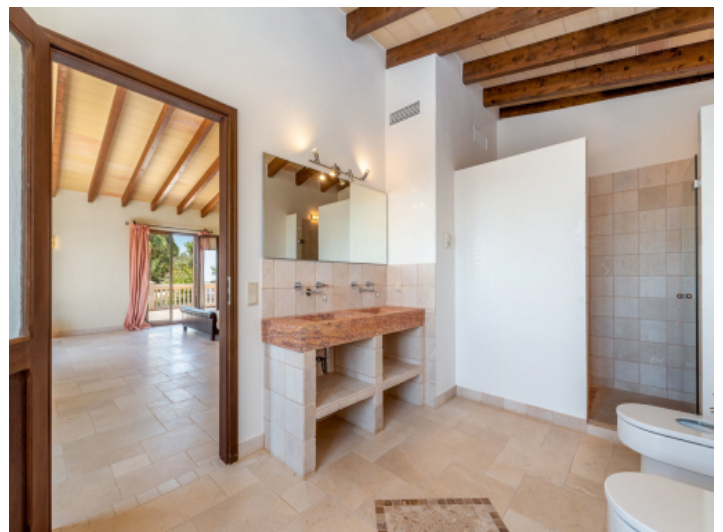
One of 6 bathrooms