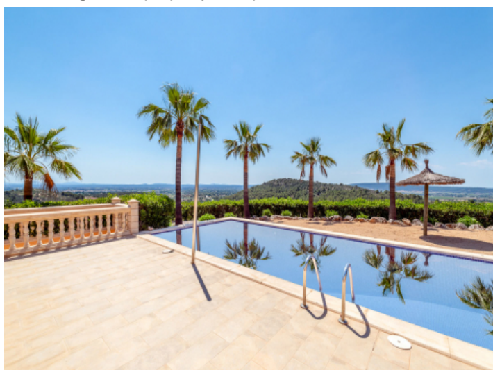
Pool area with beautiful sweeping views