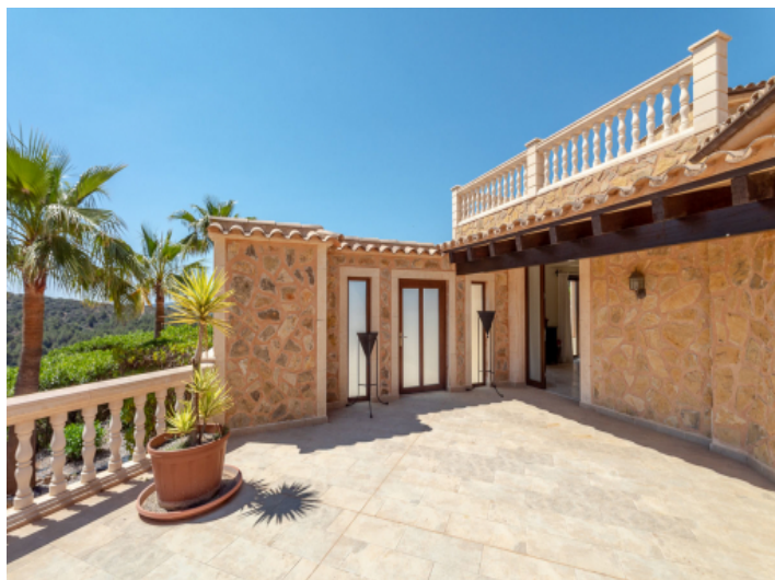
Sunny upper terrace