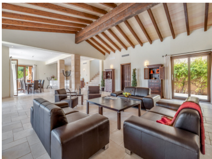
Open-plan living area with wooden ceiling beams