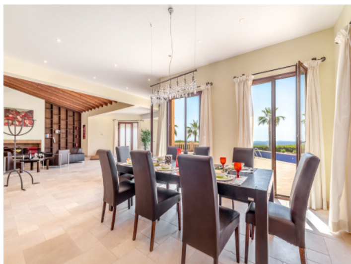
Lightflooded dining area with terrace access

PORTA MALLORQUINA • C./ COLOM 20 2º, 07001 PALMA, SPAIN