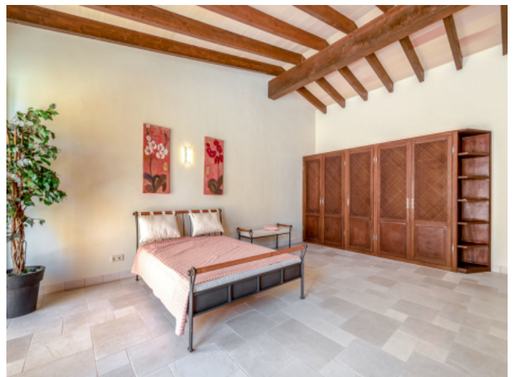
One of 10 bedrooms