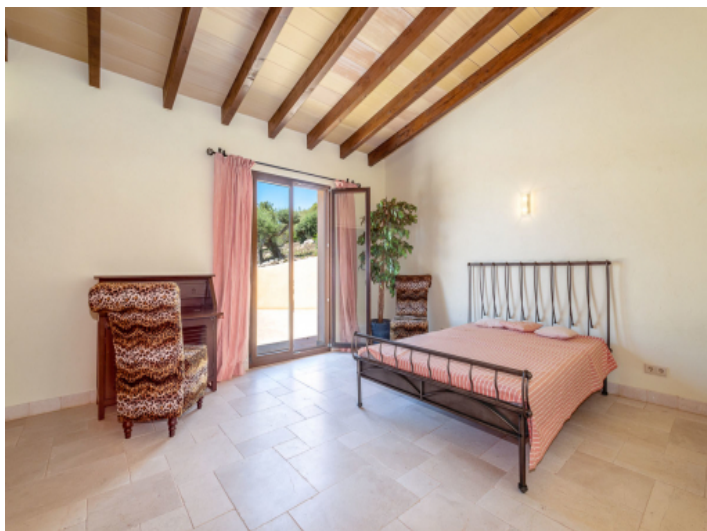
One of 10 bedrooms