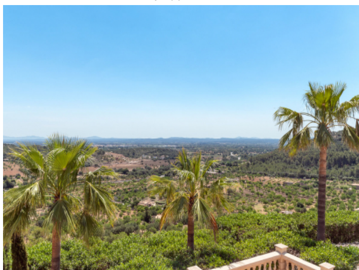
Wonderful panoramic views