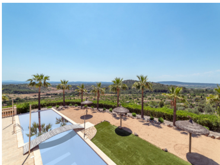
Large finca property with panoramic views in Alaro