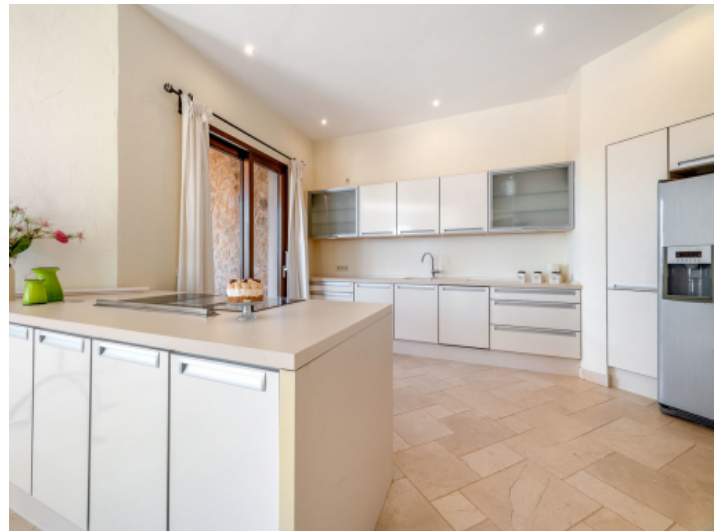
Large, modern kitchen