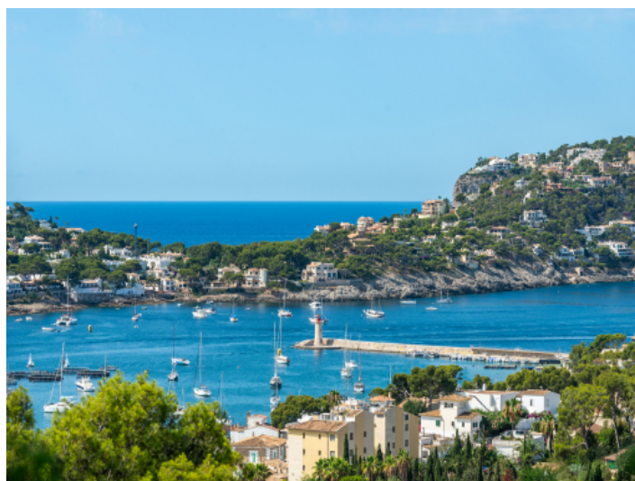
Stunning sea views