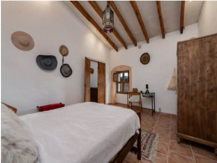
Bedroom on the first floor