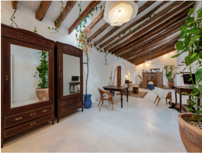
Room on the first floor