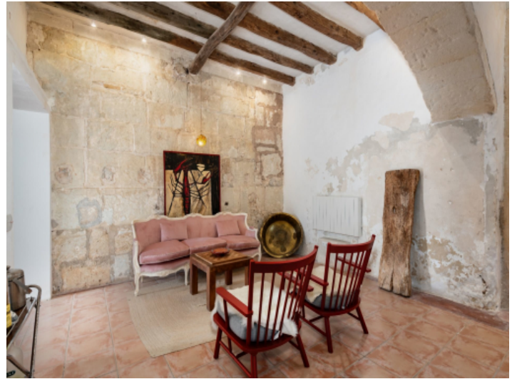
Restored sandstone walls