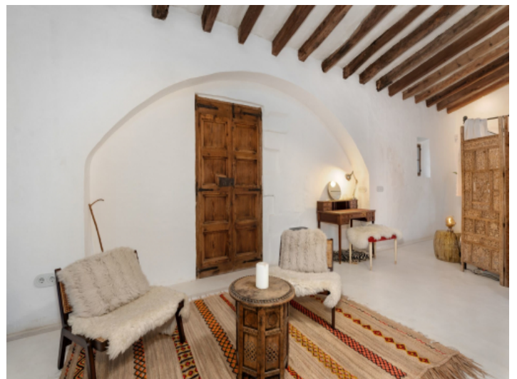
High ceilings and restored wooden beams