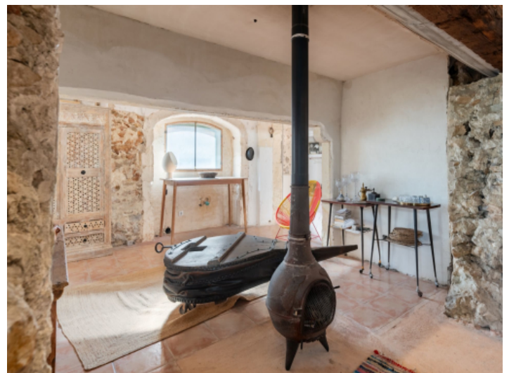
Fireplace corner at the dining area