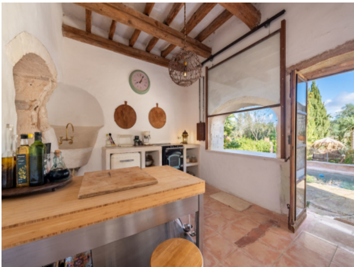
Kitchen with views over the pool