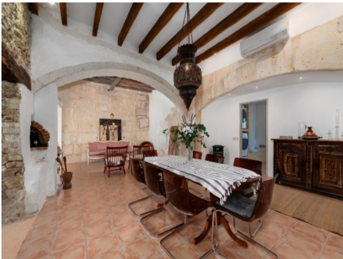
Amazing dining area