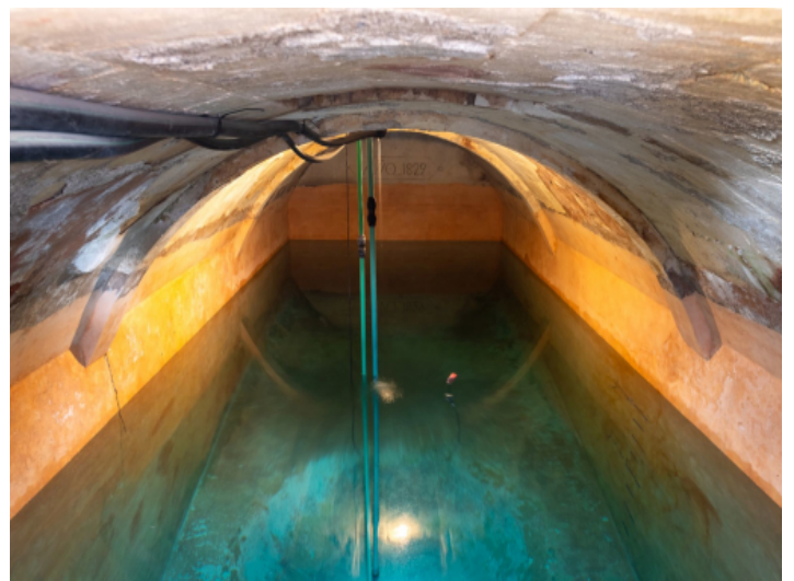
Underground waterbasin from 1829