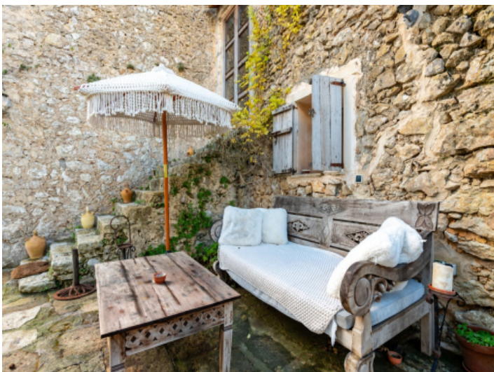
Cosy sitting area in the patio