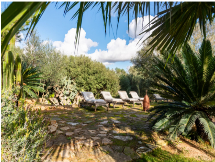
Lots of privacy