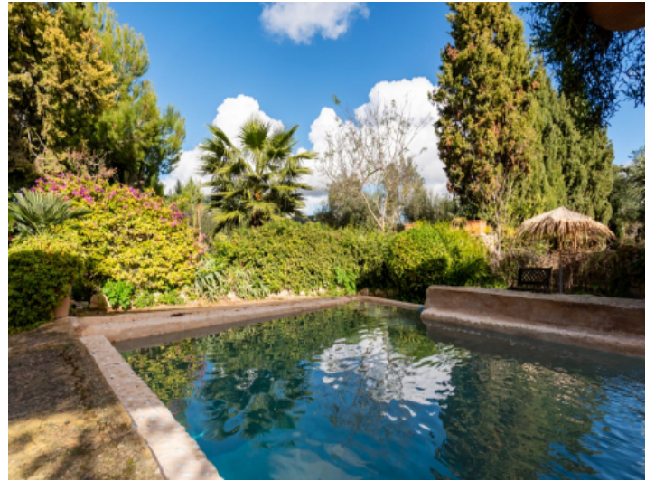
Old water basin converted into a pool