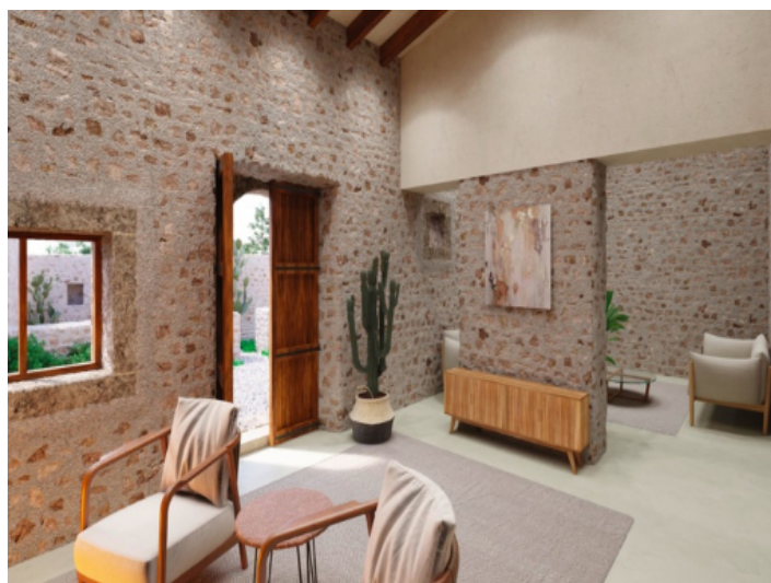
Entrance area with high ceilings