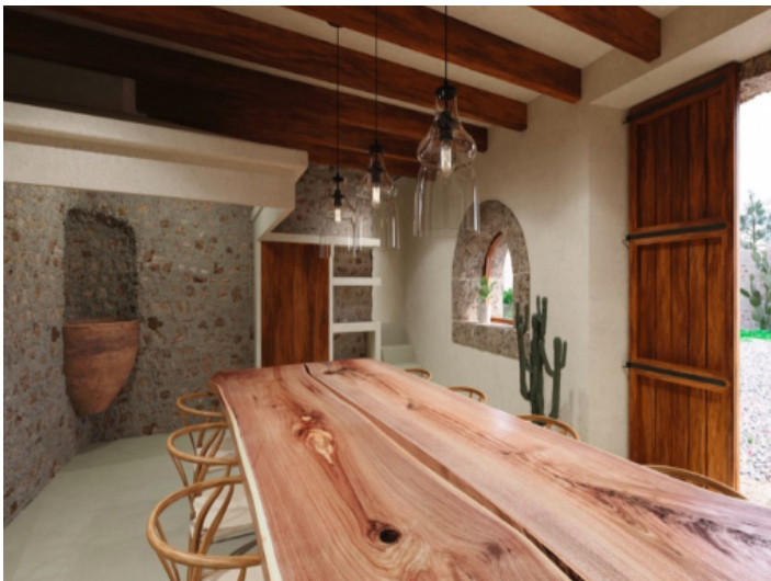
Future dining area