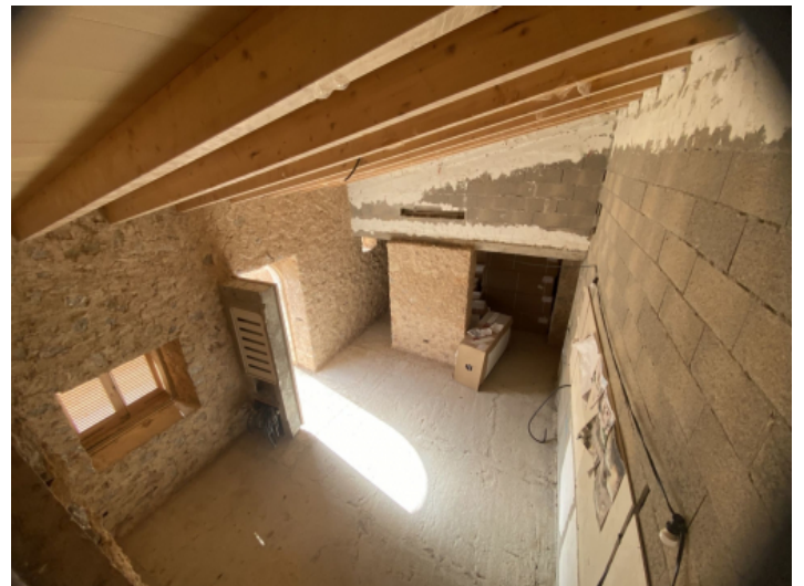
High ceilings and wooden beams