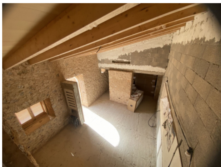
High ceilings and wooden beams