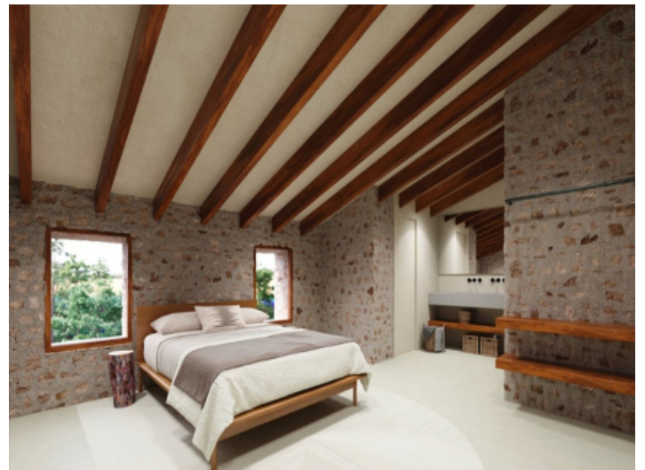
Bedroom first floor