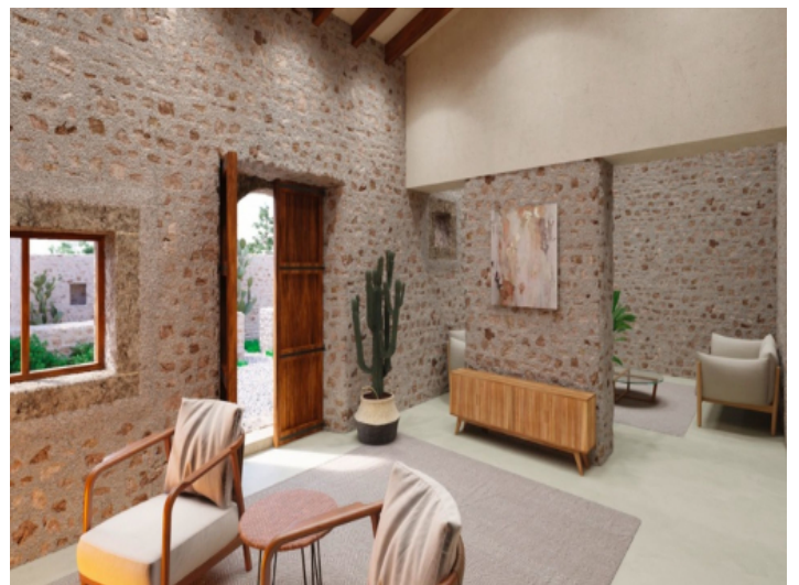
Entrance area with high ceilings