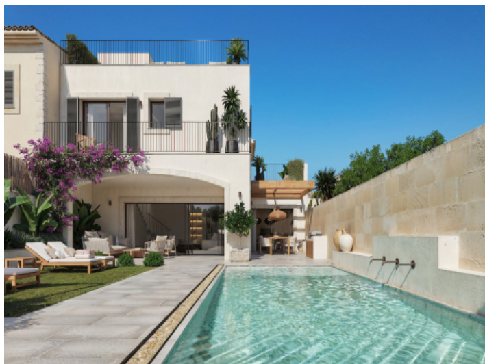
house, Ses Salines