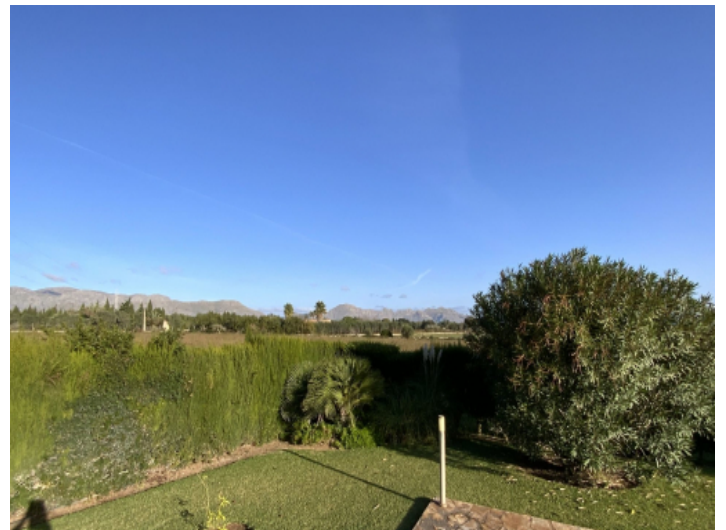
Fantastic mountain views