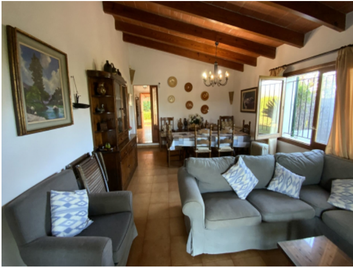
Open plan living and dining room