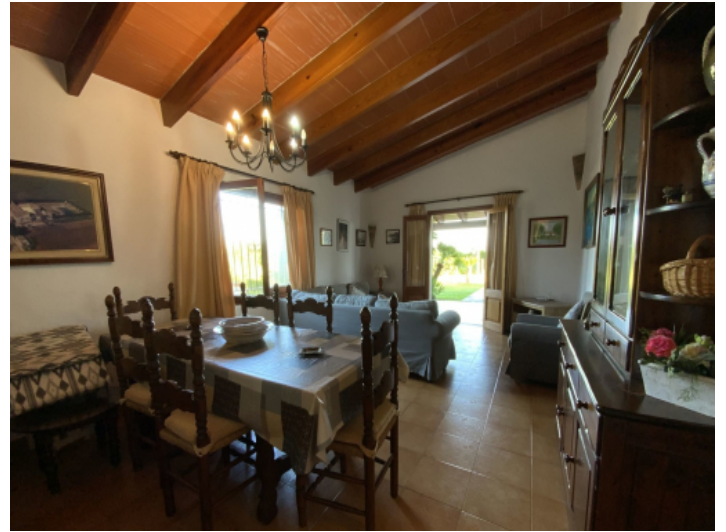
Dining room with wooden beams