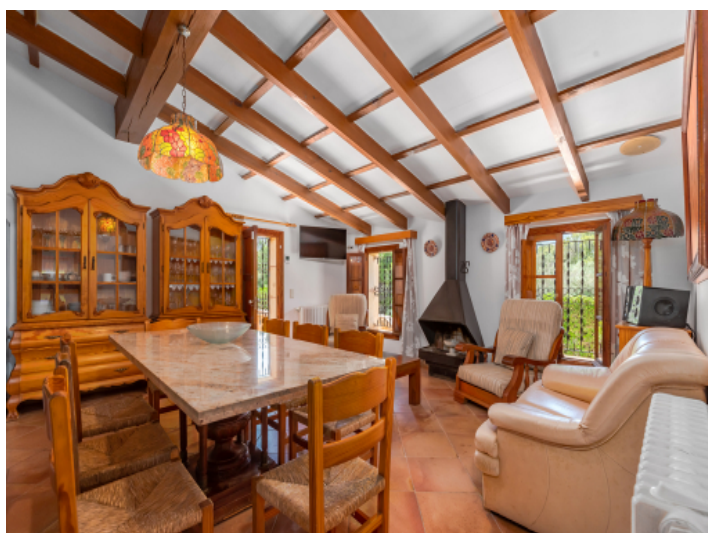
Living and dining area with fireplace