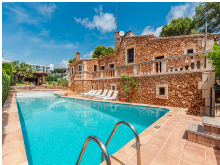
Majorcan villa with pool, garden and holiday rental licence in