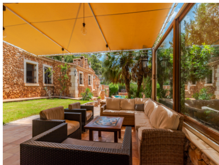
Covered terrace with comfortable seating