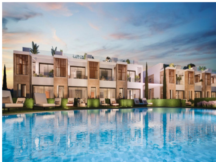
Large community pool