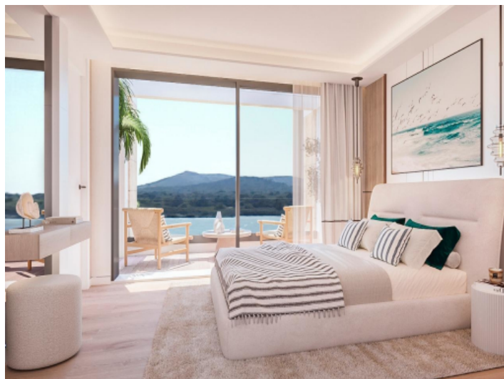
Schlafbereich mit Blick